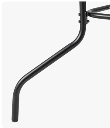
Supportive Metal Tube Legs