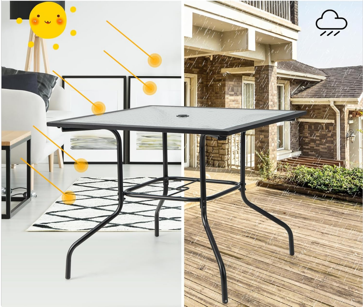
Image: Illustration showing the table's suitability for both indoor and outdoor environments, with a note to avoid leaving it in heavy rain.