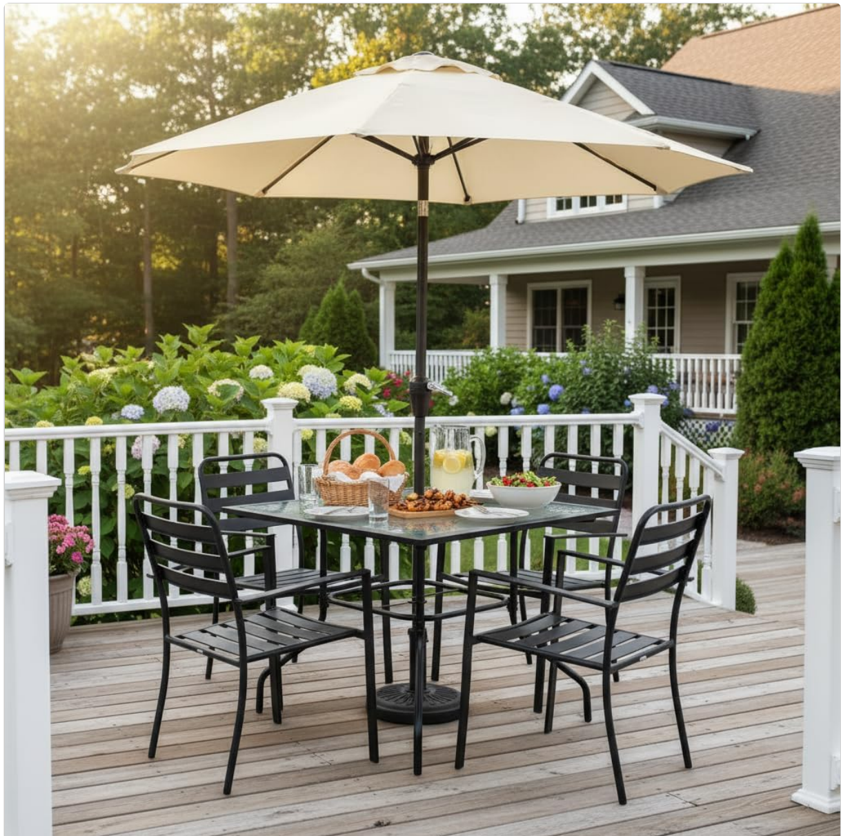
Image: The fully assembled Tangkula 35 Inch Square Patio Dining Table, ready for use.