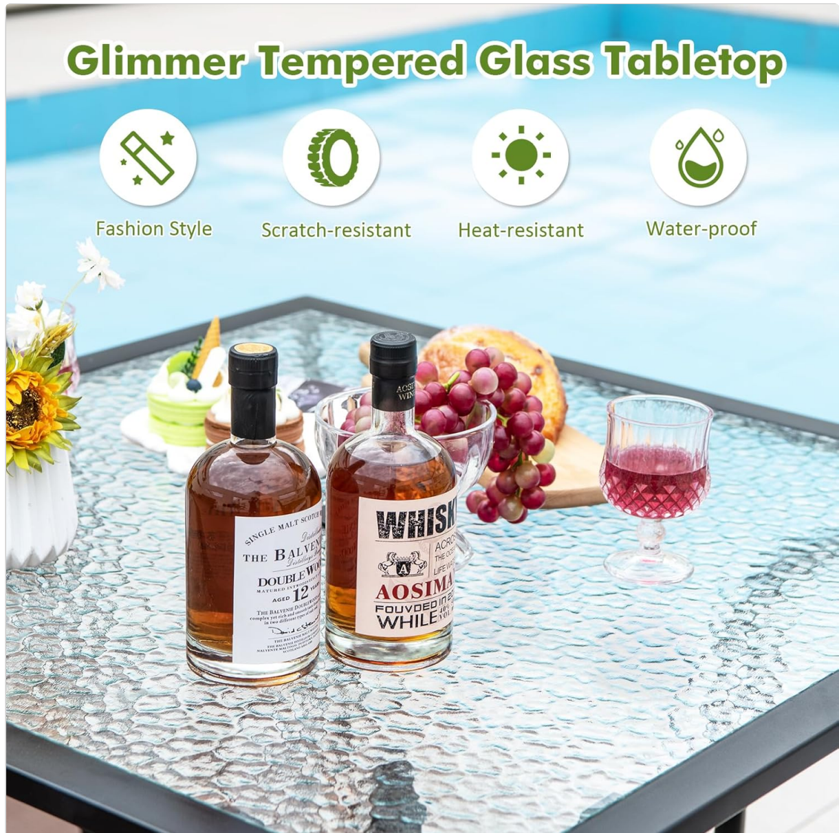
Image: Features of the glimmer tempered glass tabletop, highlighting its scratch-resistant, heat-resistant, and waterproof properties.