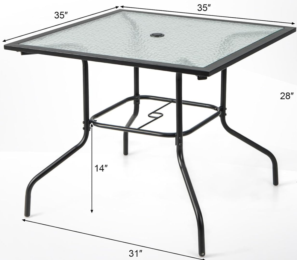
Image: Detailed dimensions of the Tangkula 35 Inch Square Patio Dining Table.