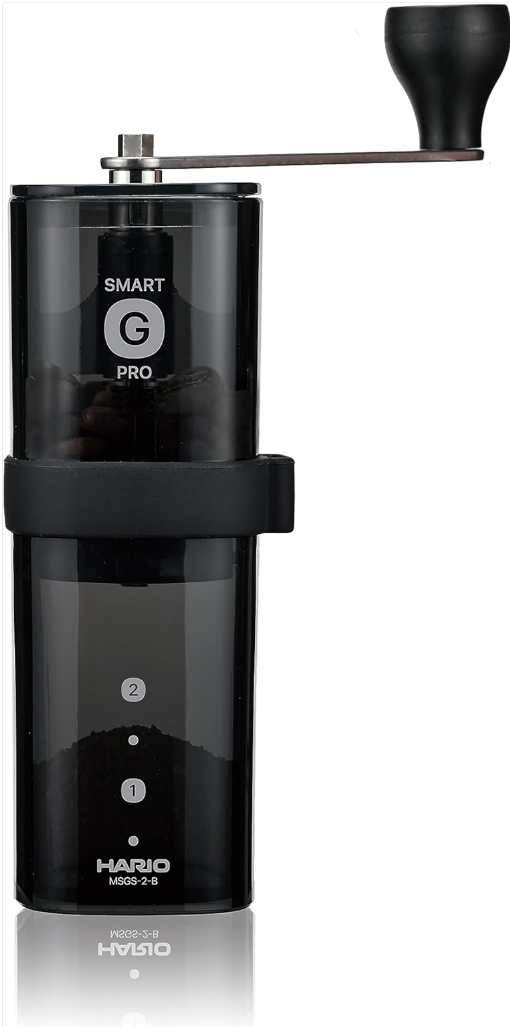
Image: Fully assembled HARIO Smart G PRO Coffee Grinder, showing the handle, bean hopper, and catch cup.