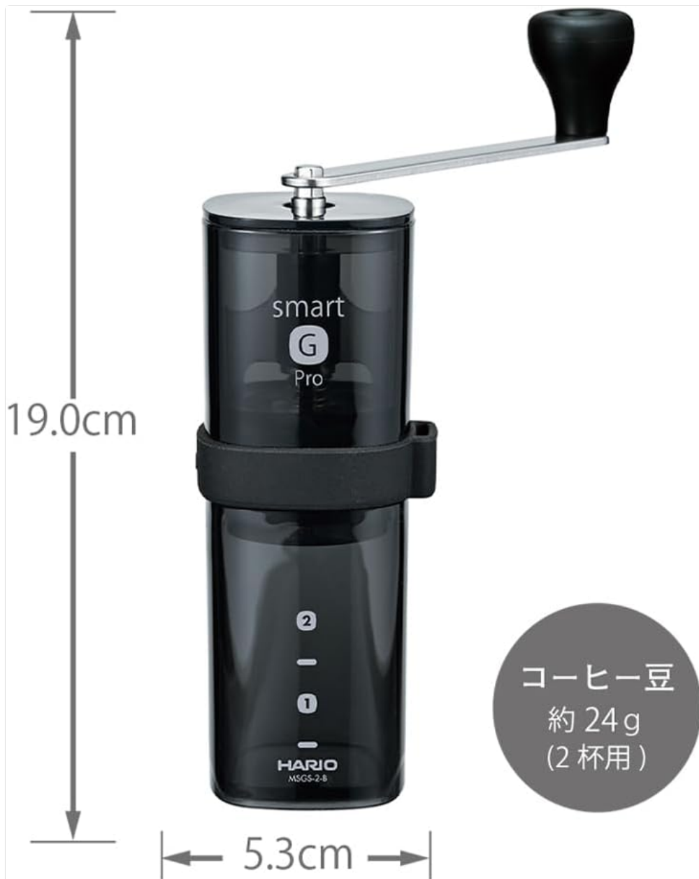
Image: Diagram showing the height (19.0 cm) and width (5.3 cm) of the HARIO Smart G PRO Coffee Grinder, along with its capacity (approx. 24g coffee beans).