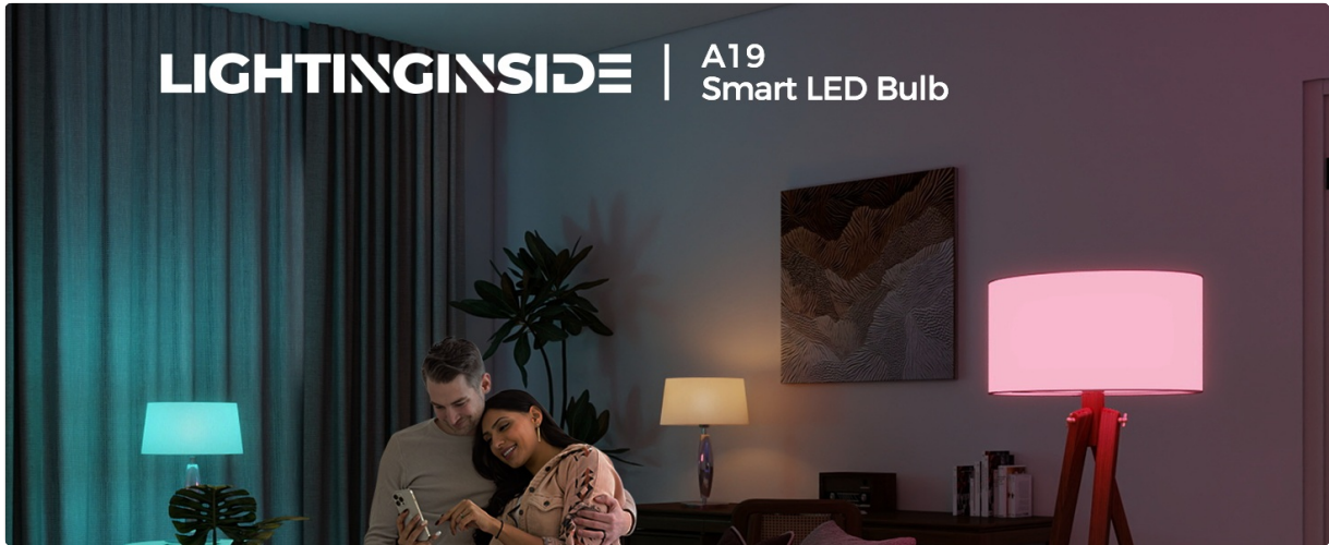
Image: Highlighting the 'No Hub Required' feature for easy setup.