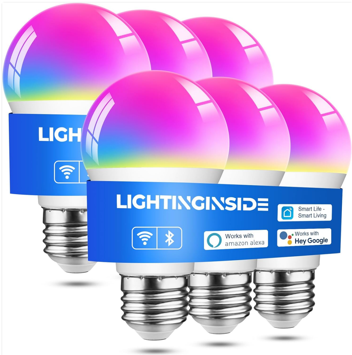
Image: Six Lightinginside Smart LED Bulbs, highlighting their smart features and compatibility.