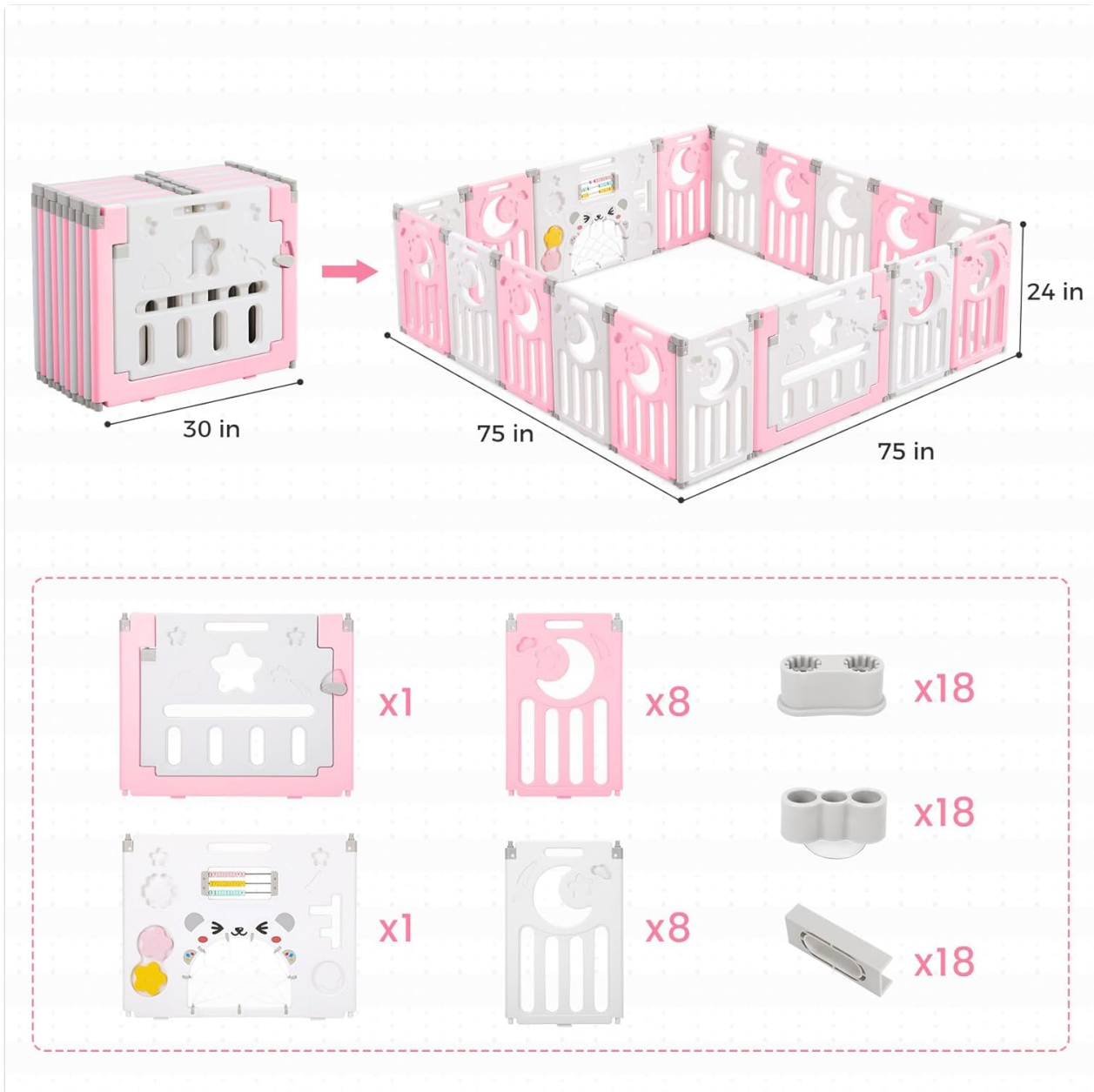
Figure 1: All components included in the Driplex Baby Playpen package, along with overall dimensions of 75x75x24 inches when fully assembled in a square configuration.