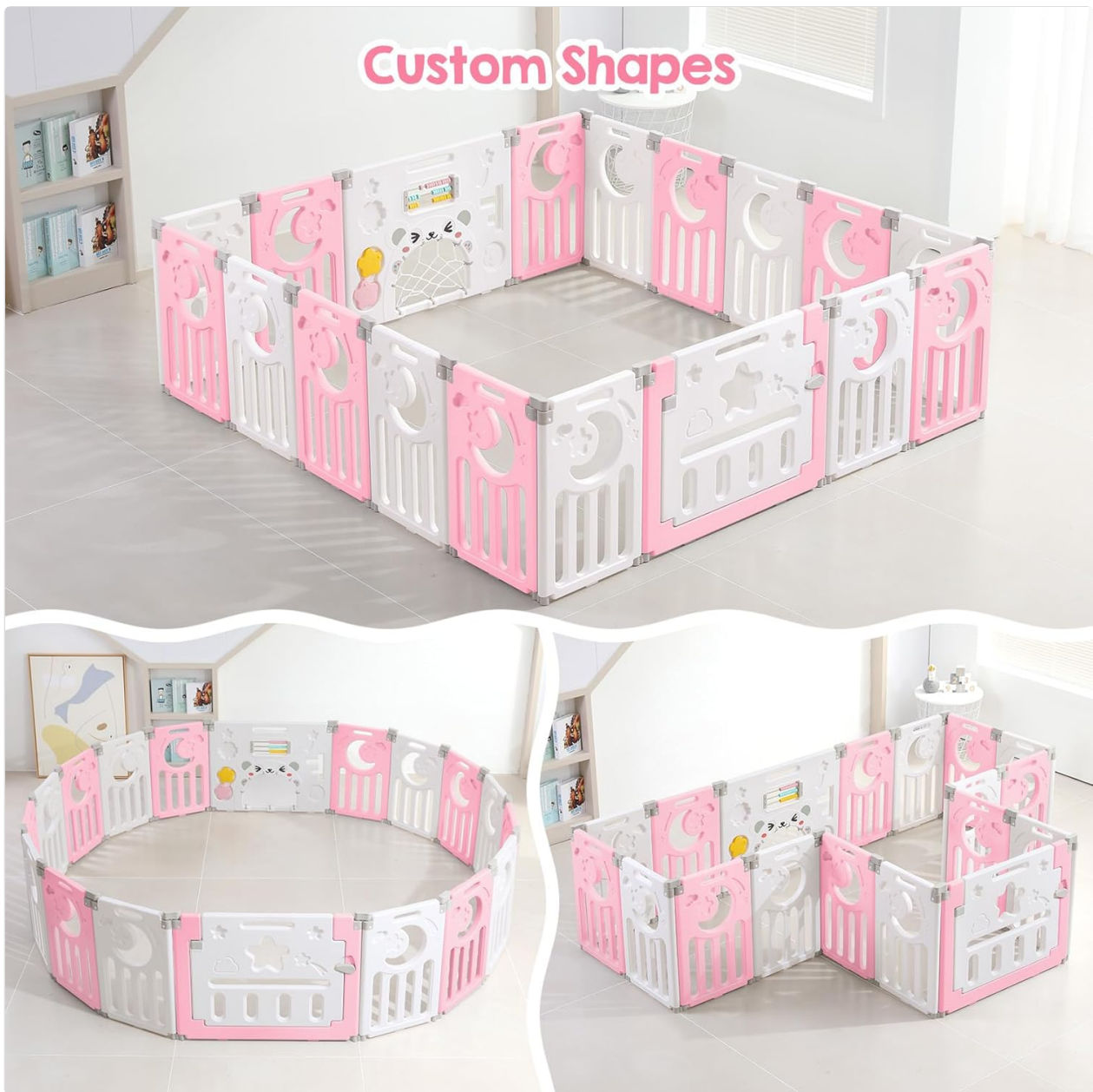
Figure 3: The Dripex Baby Playpen configured in square, round, and L-shaped layouts, demonstrating its customizable design.