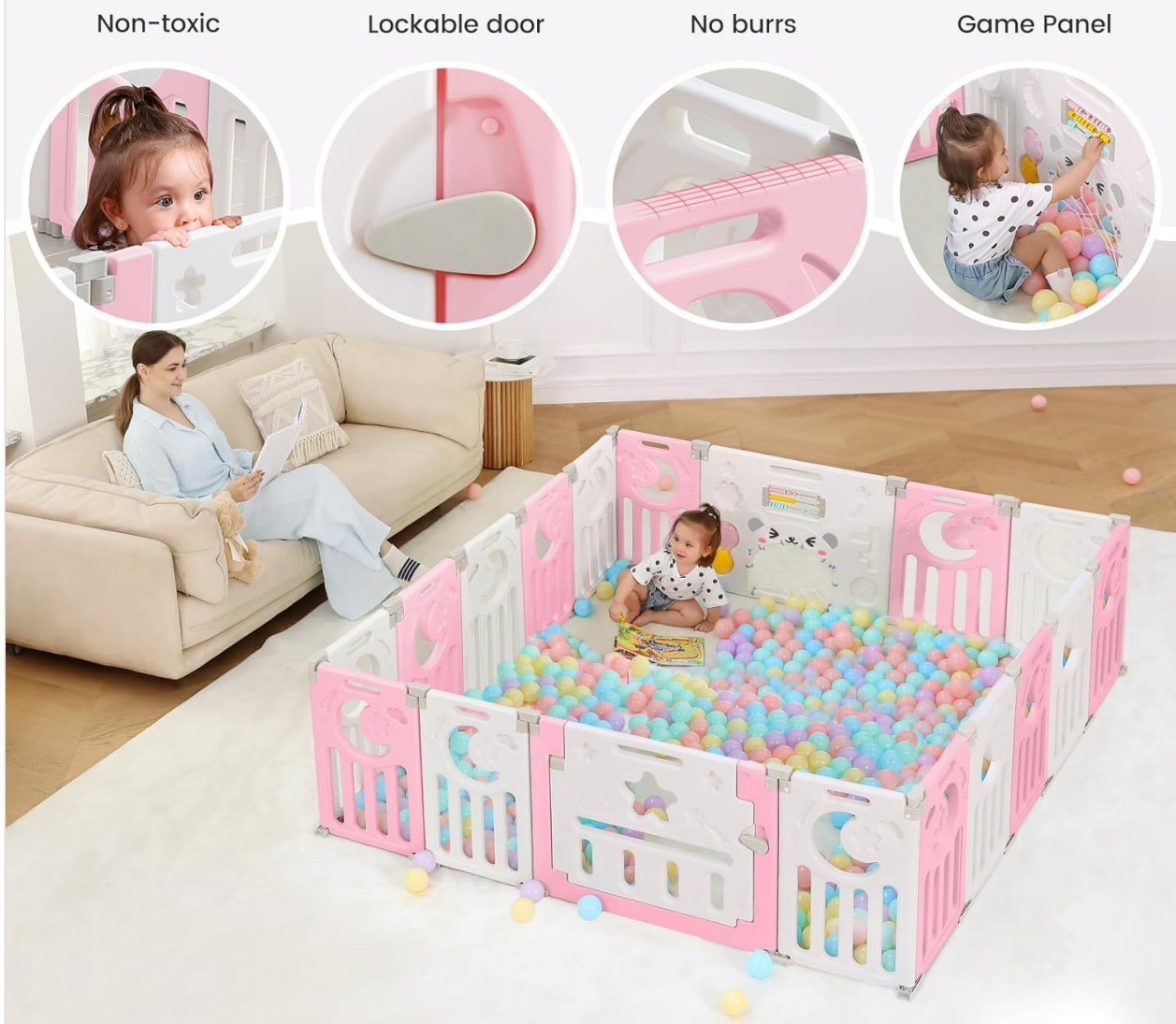
Figure 4: A child playing safely inside the Dripex Baby Playpen, highlighting its non-toxic materials, lockable door, smooth edges, and engaging game panel.