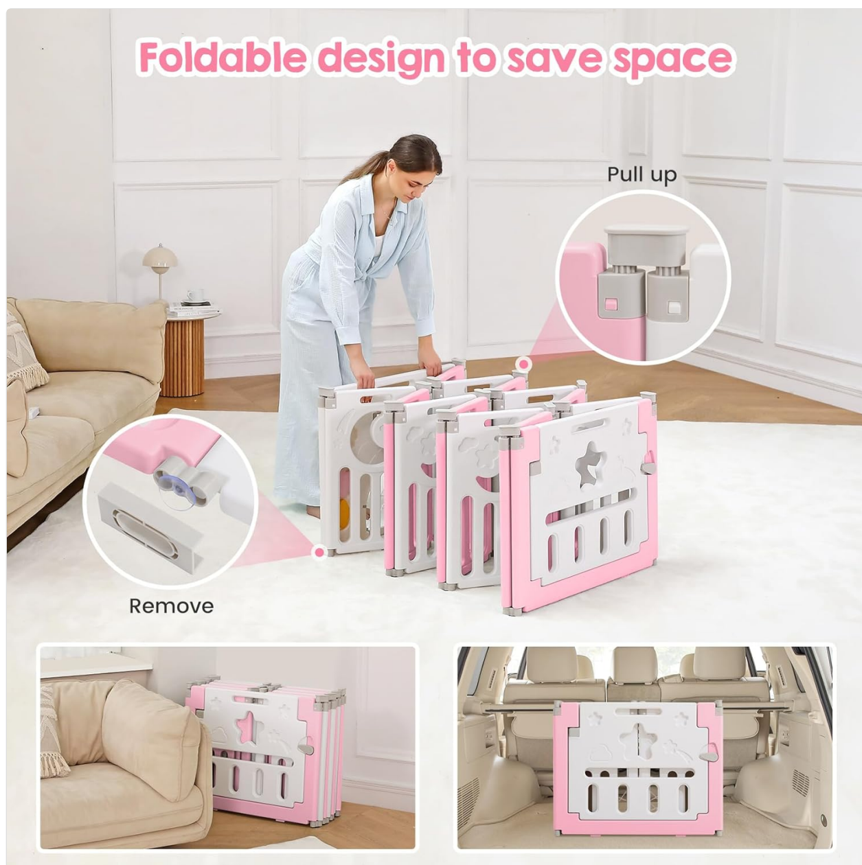
Figure 6: A woman demonstrating how to easily fold the playpen for compact storage, showing it fits into a car trunk.