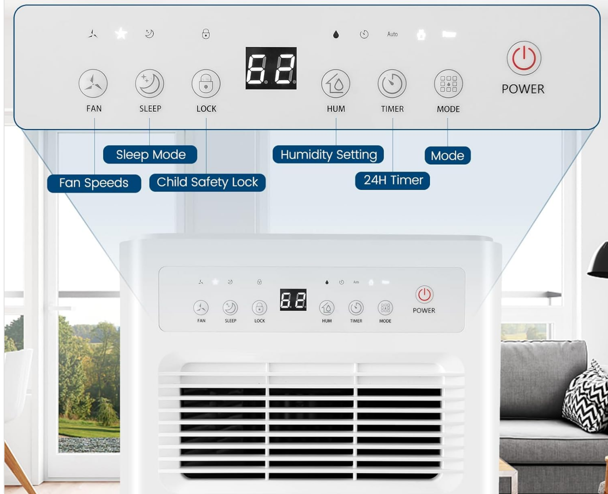
Figure 3: Detailed view of the control panel, highlighting buttons for Fan, Sleep, Lock, Humidity Setting, Timer, Mode, and Power.