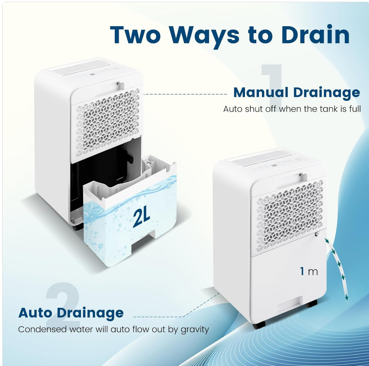
Figure 2: Illustration of manual water tank drainage and continuous drain hose connection.