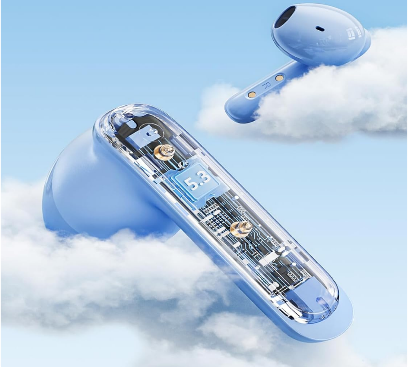
Figure 3: Bluetooth 5.3 connection. This image illustrates the Bluetooth 5.3 technology, showing an earbud with internal components and a "5.3" display, emphasizing smooth, anti-electromagnetic interference, and low power consumption connectivity.

Anti-electromagnetic interference, no jam or disconnection, high-speed transmission low power consumption