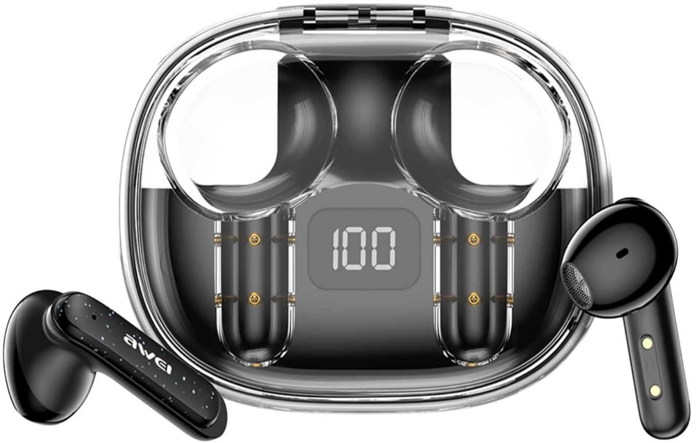
Figure 1: awei T86 Earbuds and Charging Case. This image shows the black awei T86 earbuds resting in their transparent charging case, which features a digital battery display showing "100".