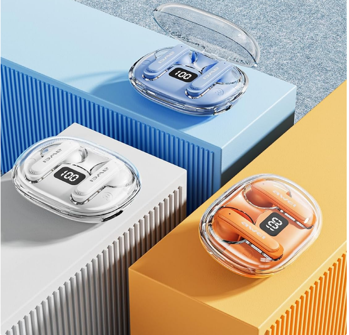
Figure 2: awei T86 Earbuds in various colors. This image displays the awei T86 earbuds and their charging cases in multiple colors (blue, white, orange) on a colorful, layered background, highlighting the "Jelly Bean Style" and "Classy Melodies and Colors".