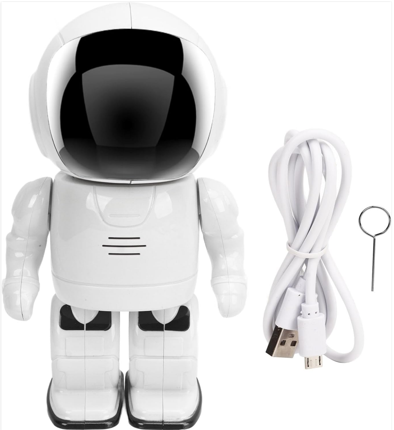
Image: The Marhynchus 1080P Surveillance Camera, USB charging cable, and a card pin.