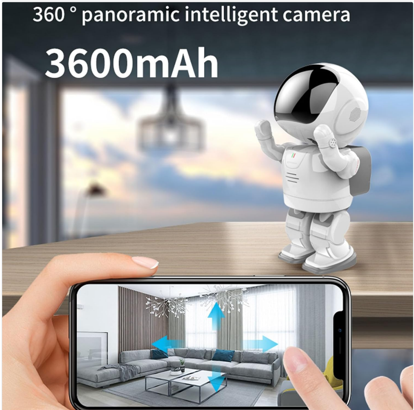
Image: A smartphone screen showing the camera's live feed with arrows indicating the 360-degree panoramic intelligent camera function.

achieve a panoramic view of the monitored area.