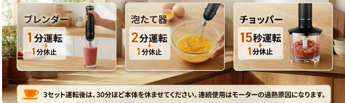
Image: Examples of quick preparation with the hand blender.

Video: Demonstrates the assembly, blending, pureeing, chopping, whisking, and cleaning functions of a 5-in-1 hand blender.