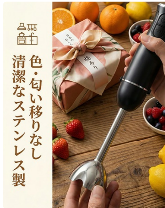
Image: The hand blender is a versatile tool for many kitchen tasks.