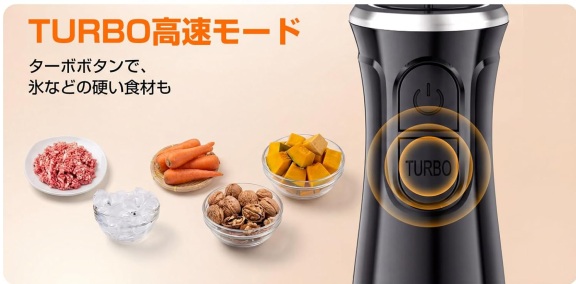
Image: Speed adjustment dial and Turbo button for precise control.