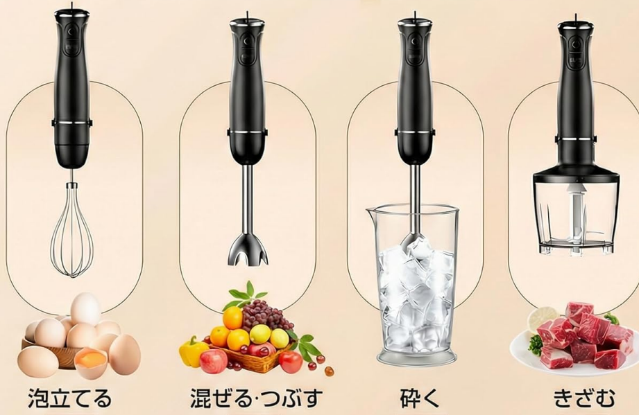
Image: Visual guide for attaching and detaching the various blender components.