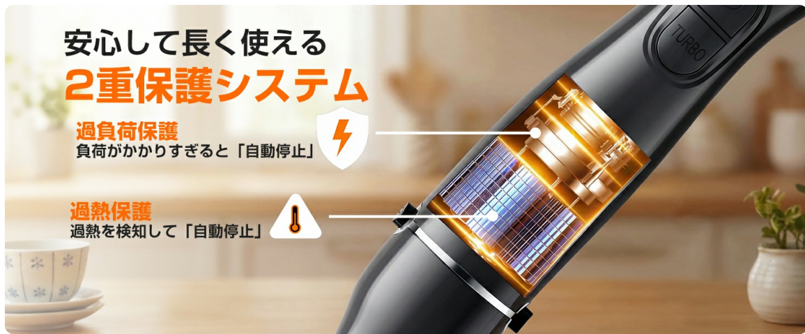
Image: The hand blender is suitable for a wide range of culinary applications.