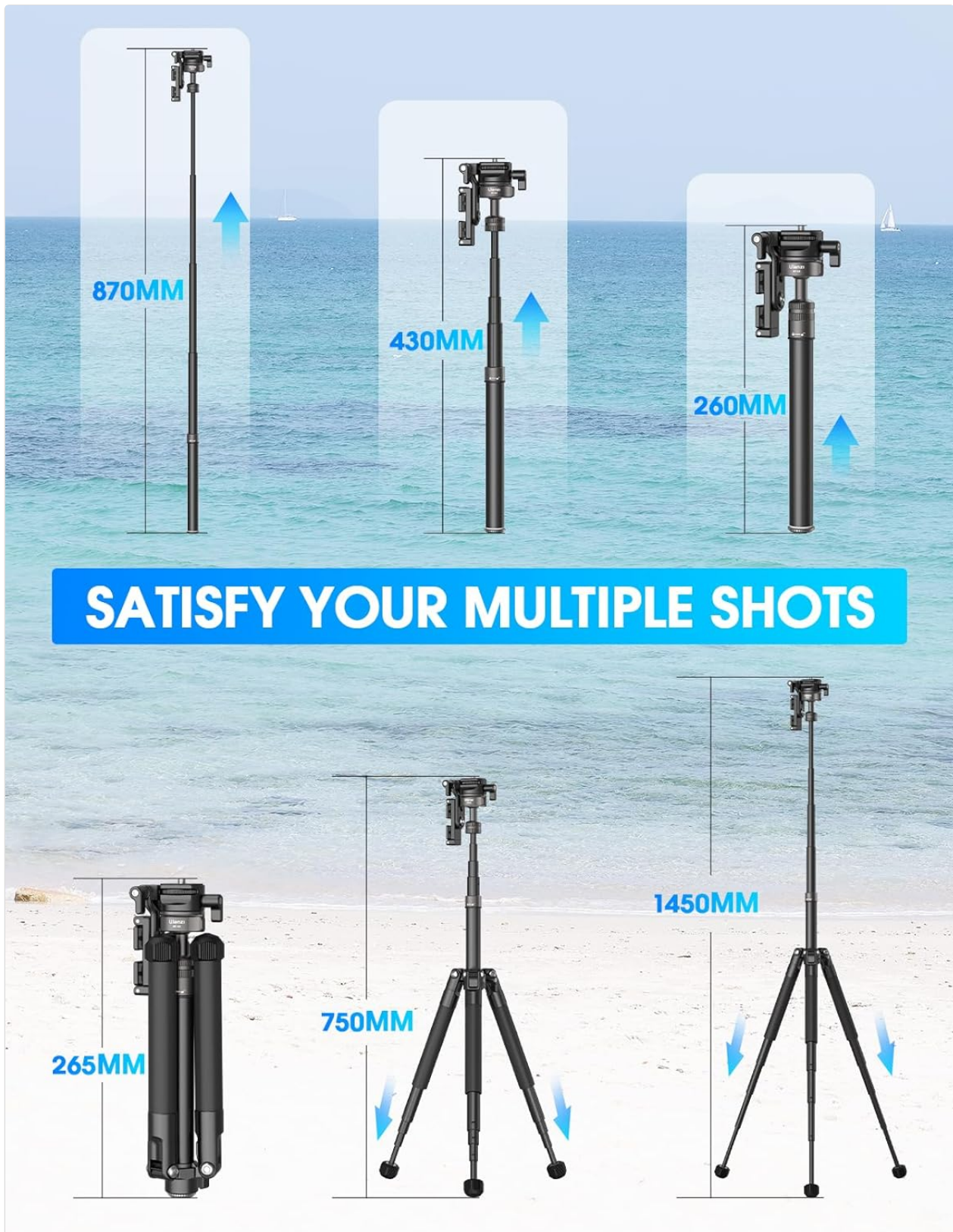
Figure 6: The center column can be extended to achieve different heights, up to 1450mm (57 inches), by twisting to release, pulling up, and twisting to lock.

3. Twist the central shaft locking knob clockwise to lock it securely.