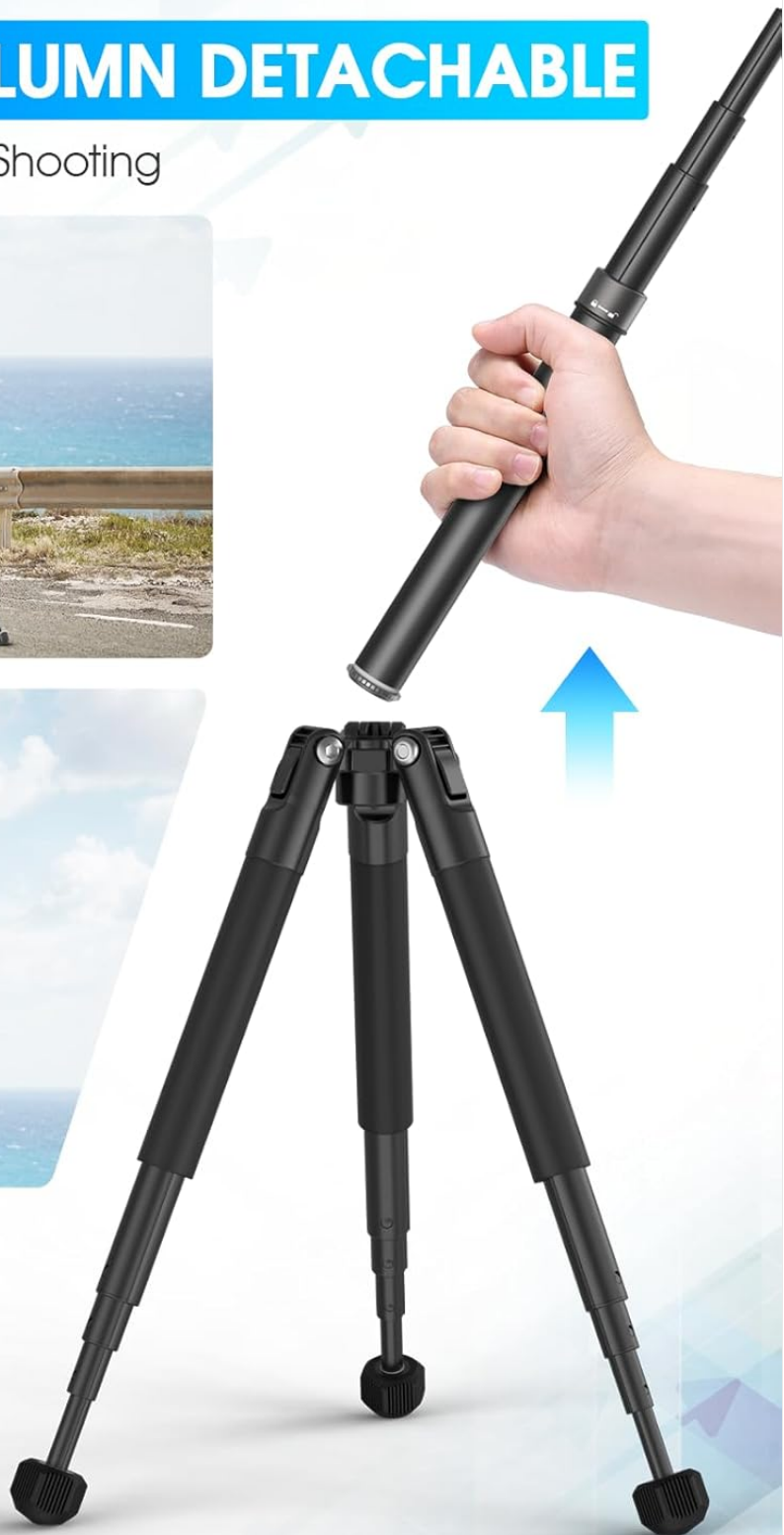
Figure 10: The tripod can be folded into a compact handle for stable handheld shooting, ideal for vlogging or on-the-go capture.