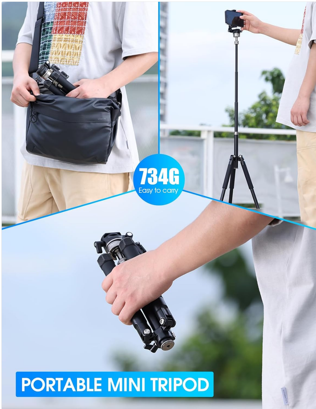
Figure 5: The tripod legs feature a 3-stage adjustment mechanism, allowing for various angles for compact size or low-angle shots.

3. Release the buckle to lock the leg in place.