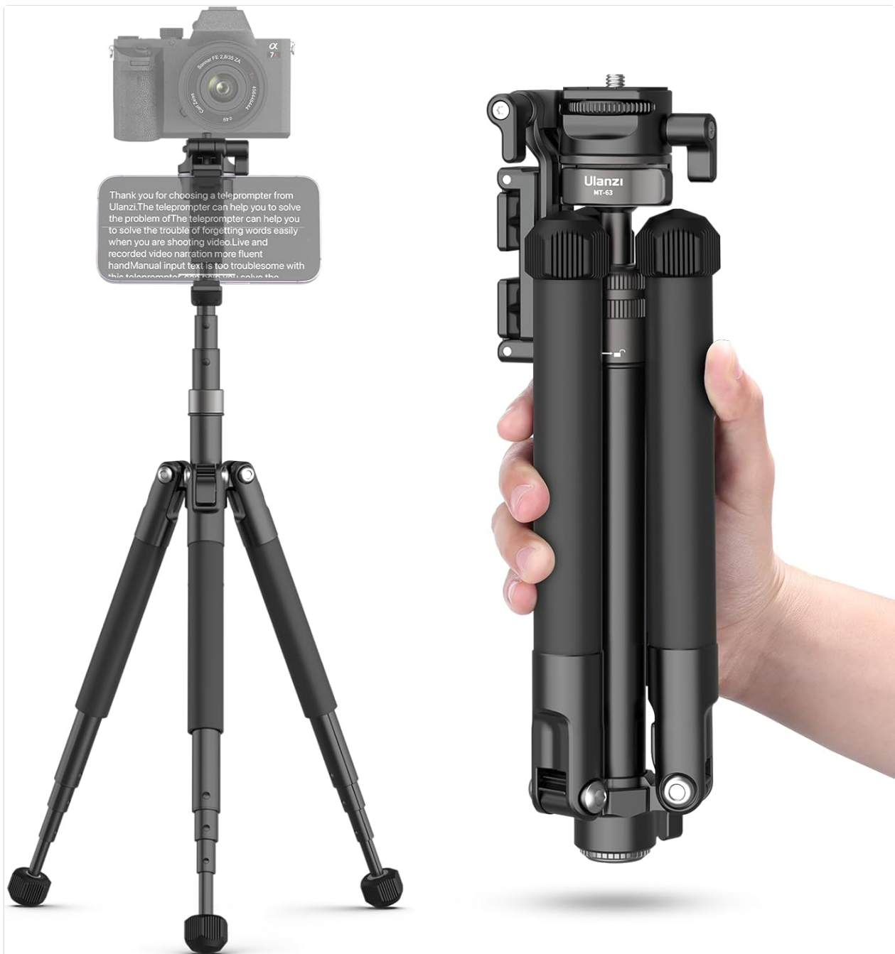
Figure 1: The ULANZI MT-63 tripod in its compact, folded state and fully extended with a camera mounted.