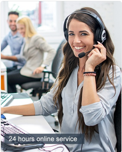
Image 8.1: Hoofun offers dedicated customer support for product inquiries and assistance.

Hoofun is committed to providing professional after-sales service. While specific warranty duration is not detailed, if you have any questions or encounter issues with your Hoofun Professional Pet Trimmer, please do not hesitate to contact us. We aim to provide a satisfactory solution within 24 hours.