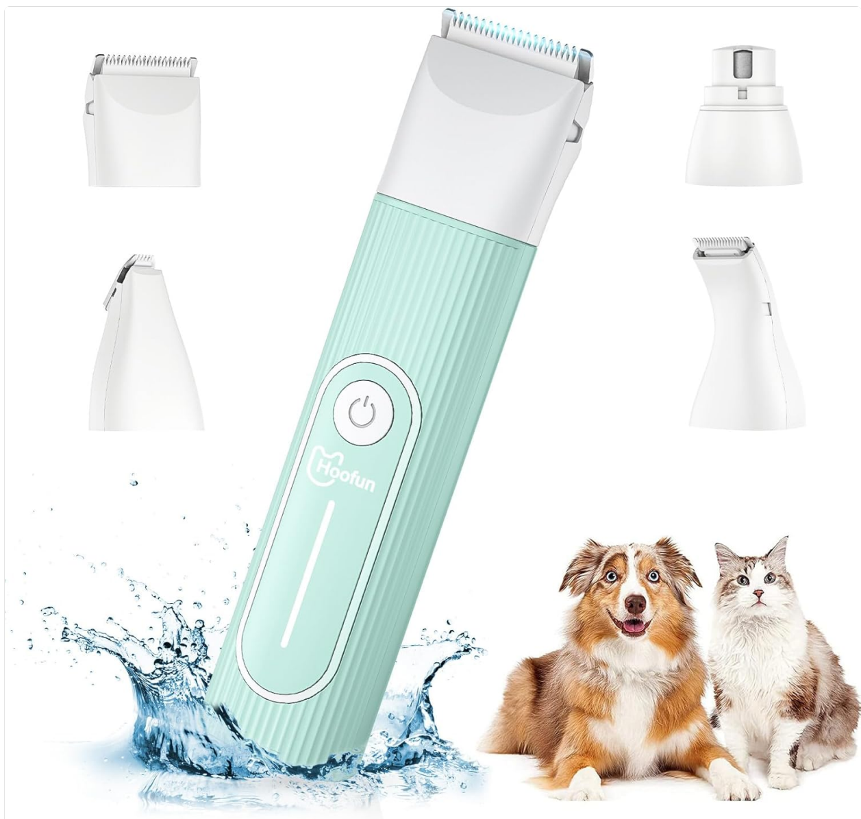
Image 5.1: The trimmer being rinsed under water, illustrating its IPX7 waterproof design for hygienic cleaning.