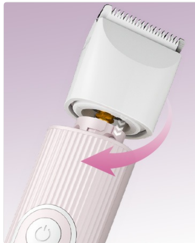
Image 3.2: Illustration of the head removal process by twisting the attachment.