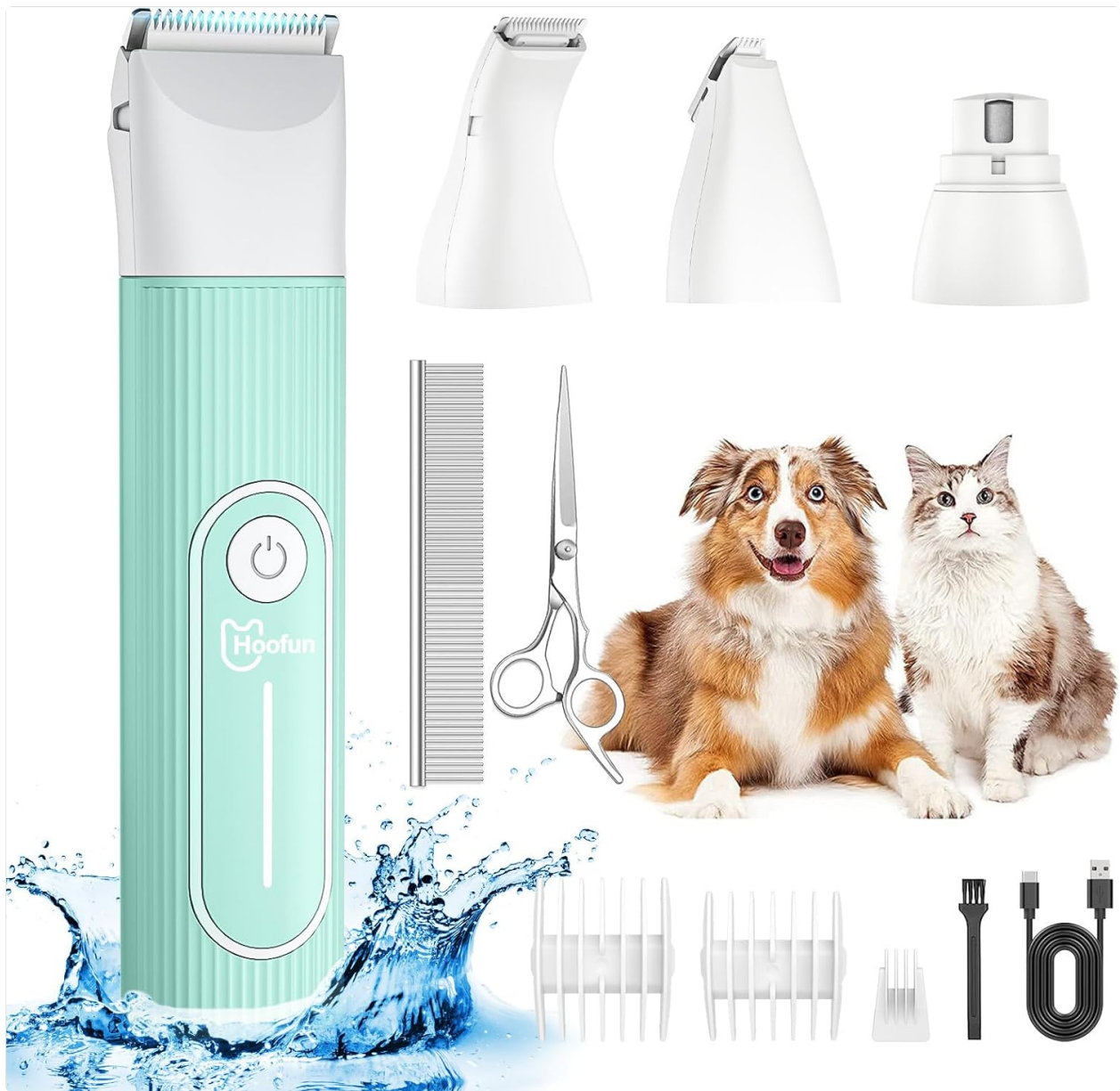
Image 1.1: Complete Hoofun 4-in-1 Pet Trimmer kit, showcasing the main unit, interchangeable heads, grooming accessories, and charging cable.