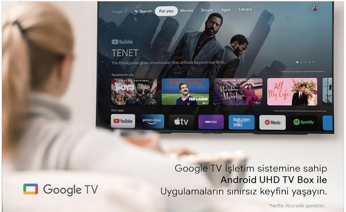
Image: A television screen displaying the Google TV interface, showing various streaming app icons and content recommendations. This illustrates the user interface of the Next Start 4K Media Player.

The Next Start 4K TV Box runs on Android 11 with the Google TV interface, providing a personalized experience with content recommendations.