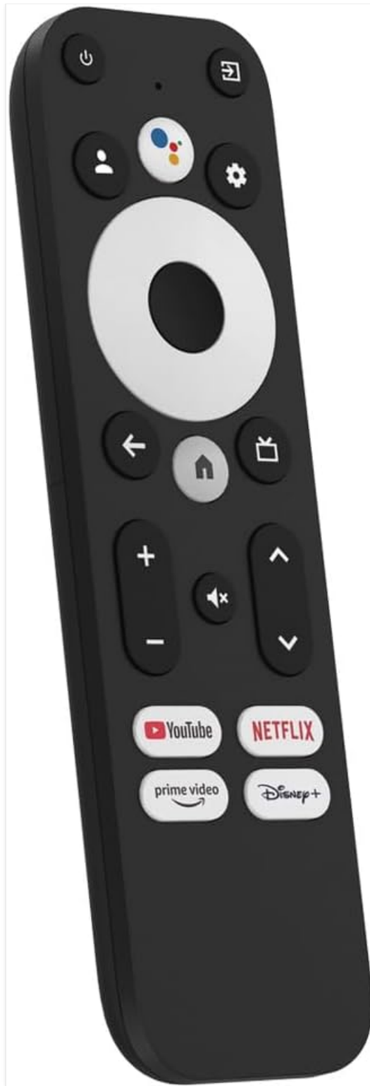
Image: The remote control for the Next Start 4K Media Player. It features a power button, navigation pad, volume controls, a Google Assistant button, and dedicated shortcut buttons for YouTube, Netflix, Prime Video, and Disney+.