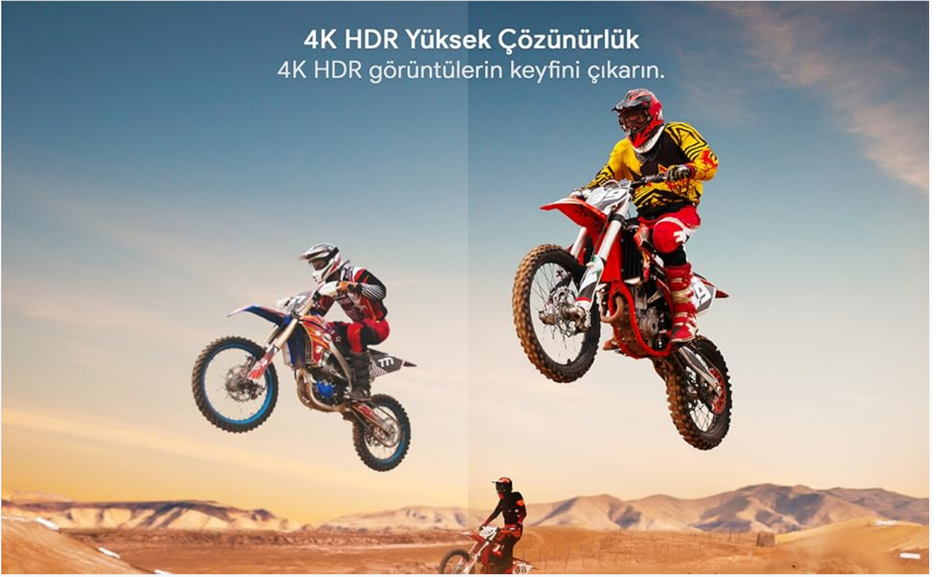
Image: A split image demonstrating the visual difference between standard resolution and 4K HDR, highlighting enhanced detail and color. This illustrates the capability of the Next Start 4K Media Player.

4K HDR Yüksek Çözünürlük 4K HDR görüntülerin keyfini çıkarın.