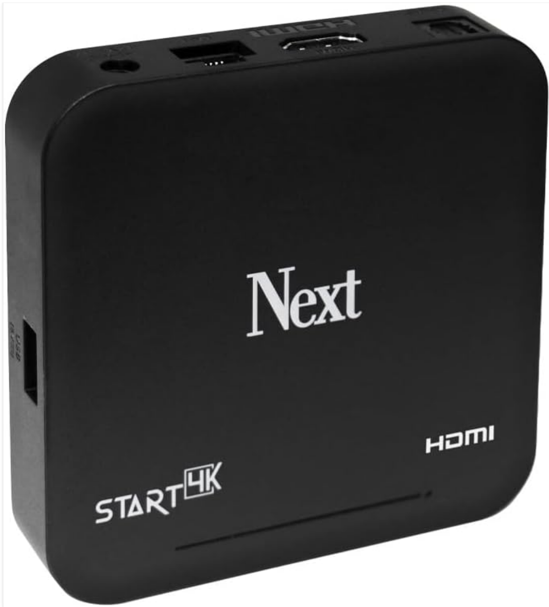
Image: Front view of the Next Start 4K Media Player. This image shows the compact, black TV box with the "Next START 4K" logo and an HDMI port visible on the front/side.