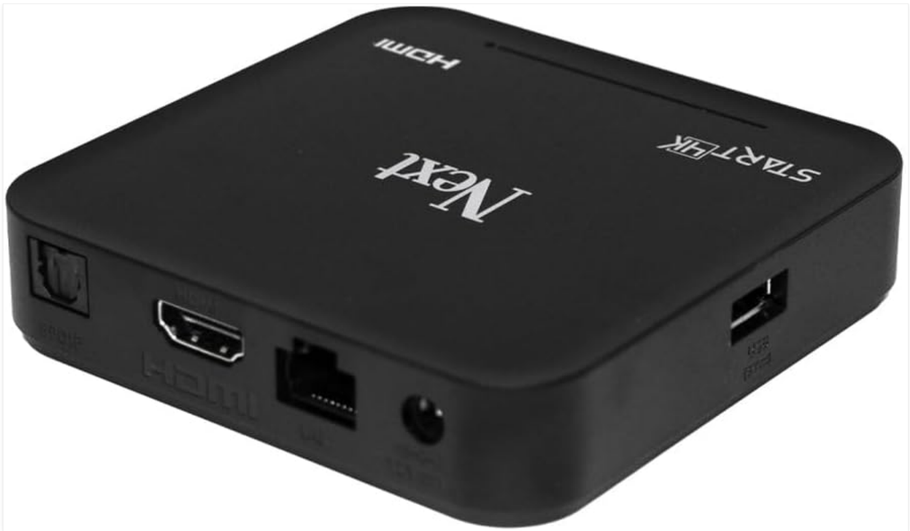
Image: Rear view of the Next Start 4K Media Player, displaying the connectivity ports. From left to right, these include an S/PDIF optical audio output, an HDMI output, an Ethernet (LAN) port, and a DC 12V power input.