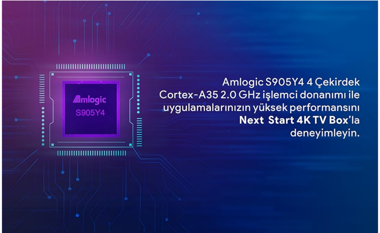
Image: A diagram illustrating the Amlogic S905Y4 chipset, highlighting its role in the high performance of applications on the Next Start 4K TV Box.