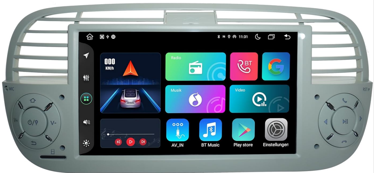
Figure 1.1: TAFFIO TF-500W Head Unit displaying its main Android interface with various application icons.

The TAFFIO TF-500W is a state-of-the-art 7-inch touchscreen Android head unit designed for seamless integration into Fiat 500 vehicles (2007-2015 models). It offers advanced features including GPS navigation, wireless CarPlay, Android Auto, and comprehensive multimedia capabilities, enhancing your in-car experience.