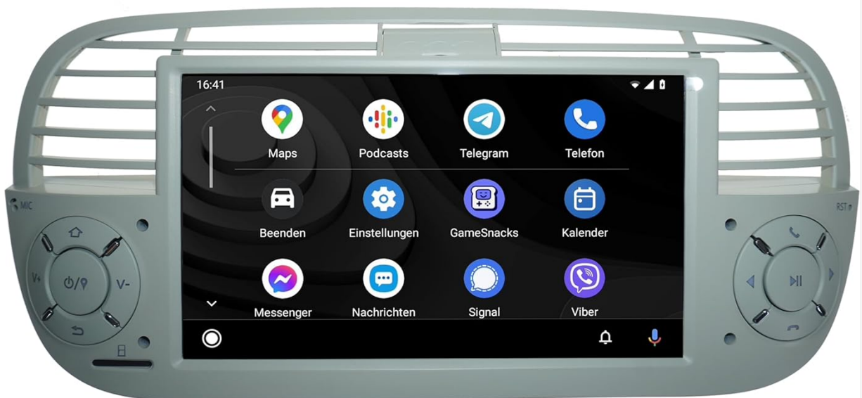
Figure 4.4: The Android Auto interface on the TAFFIO TF-500W, presenting Android applications in a car-friendly layout.