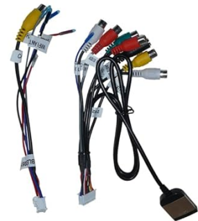
RCA Plugs + Sim Card Slot