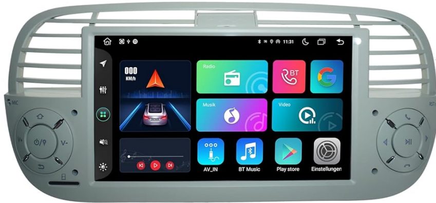
Multimedia + Navigationssystem