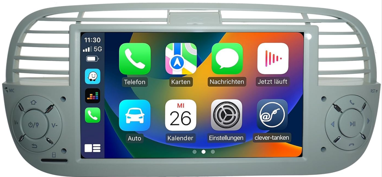
Figure 4.3: The Wireless CarPlay interface displayed on the TAFFIO TF-500W, showing familiar iOS app icons optimized for in-car use.