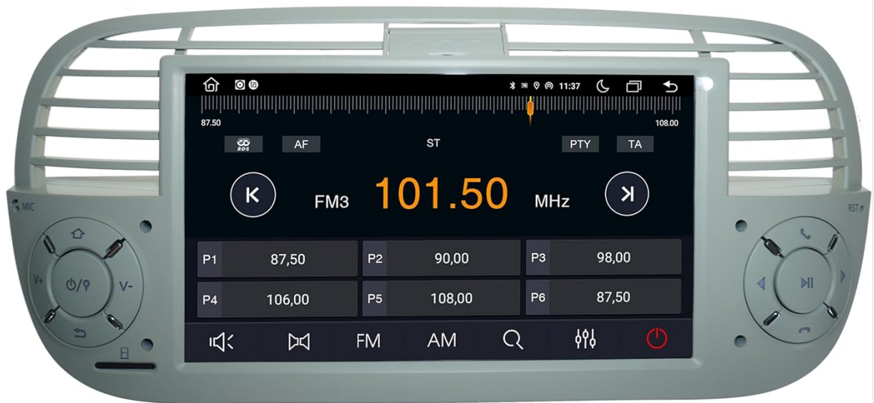
Figure 4.2: The radio interface of the TAFFIO TF-500W, showing frequency display, station presets, and tuning controls.