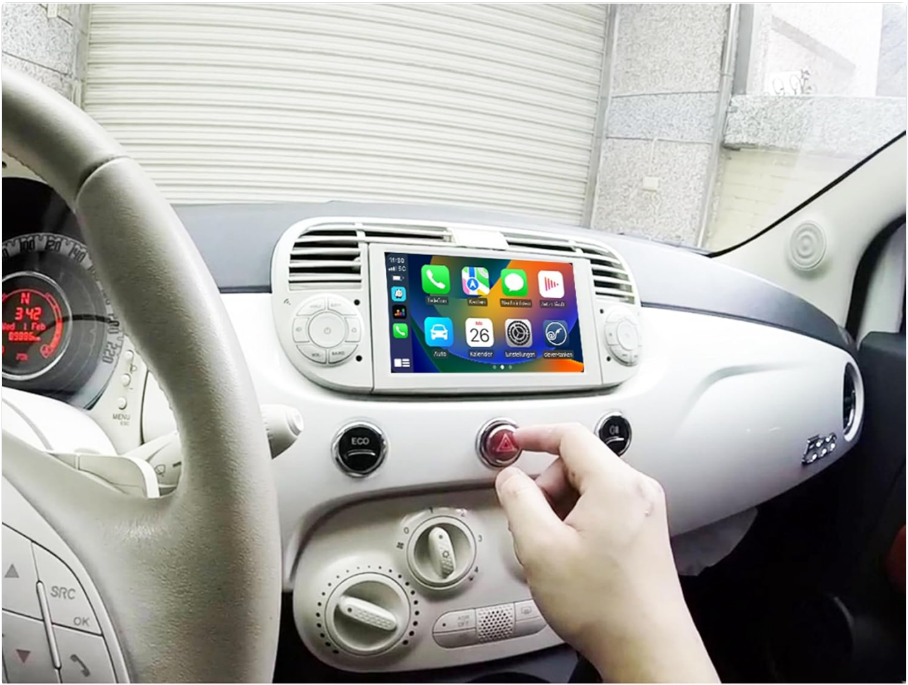
Figure 3.1: The TAFFIO TF-500W head unit seamlessly installed within the dashboard of a Fiat 500, demonstrating its integrated appearance.