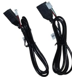
2x USB Cable