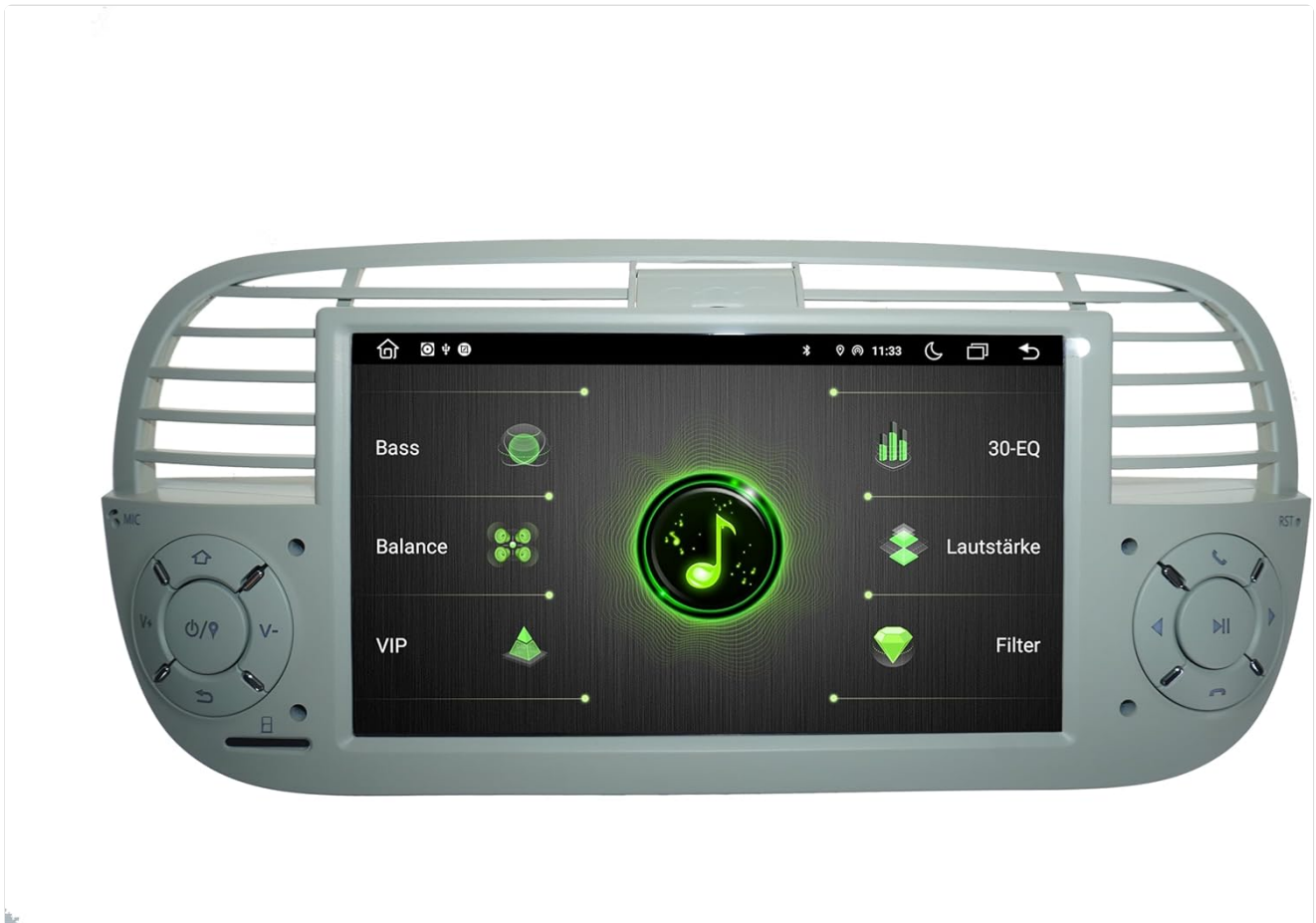
Figure 4.5: The audio equalizer settings screen on the TAFFIO TF-500W, allowing users to fine-tune sound output with various controls like Bass, Balance, and 30-band EQ.