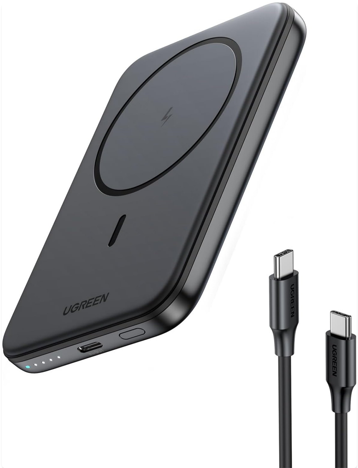
Image: The UGREEN Magnetic Power Bank, a sleek black portable charger, is shown alongside two USB-C charging cables. The power bank features a circular magnetic charging area and LED indicators on its side.