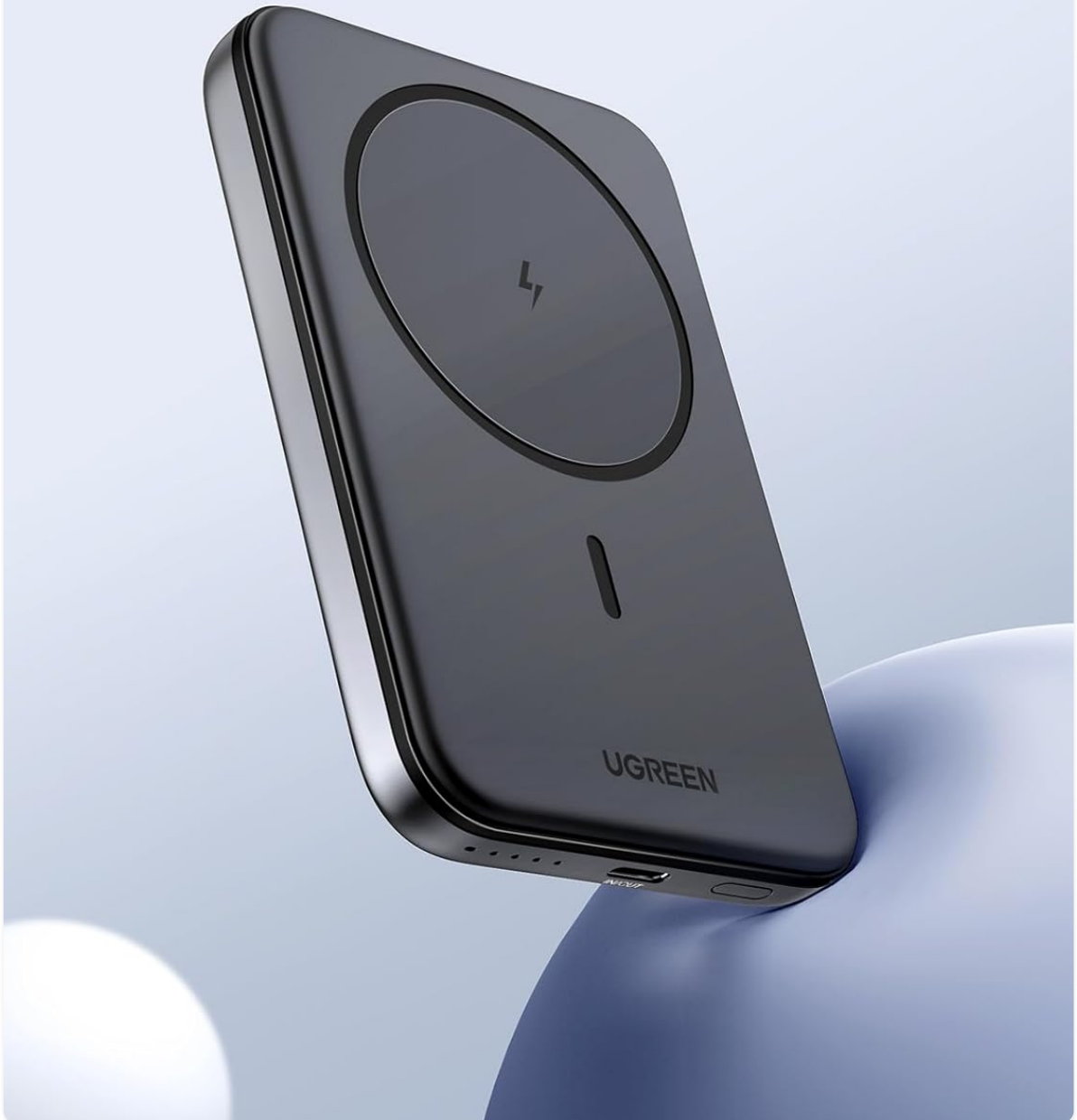
Image: A close-up view of the UGREEN Magnetic Power Bank, highlighting its smooth, skin-friendly silicone surface and sleek design.