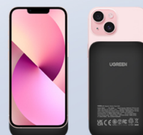
iPhone 13 Mini 5.4 inches