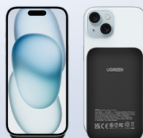
iPhone 15 6.1 inches