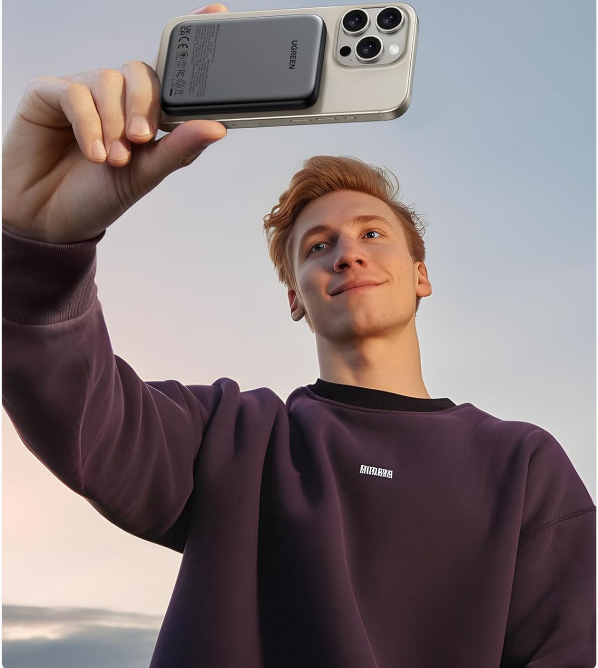
Image: A man holds an iPhone with the UGREEN Magnetic Power Bank securely attached to its back, illustrating the strong magnetic connection.