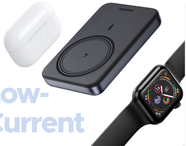
Image: An illustration highlighting the key features of the magnetic power bank, including 15W rapid charge, 7.5W powerful magnetic attachment, 5000mAh capacity, and its suitability for travel.