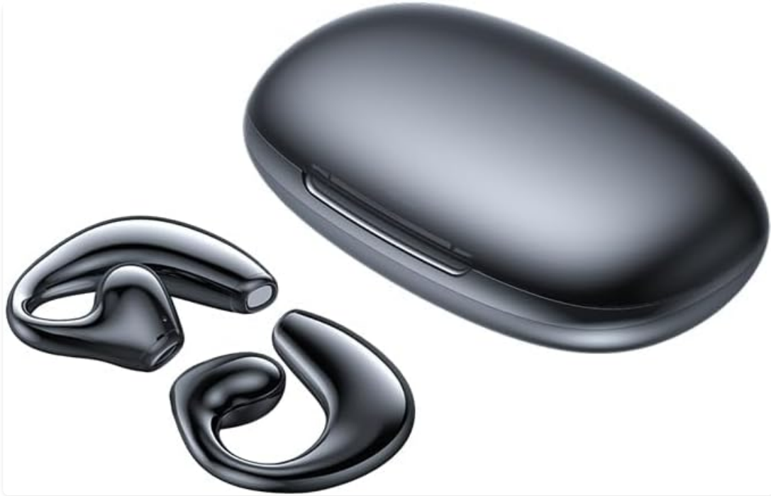
Image: Contents of the ElecSmart JR02 package, showing the earbuds and their charging case.