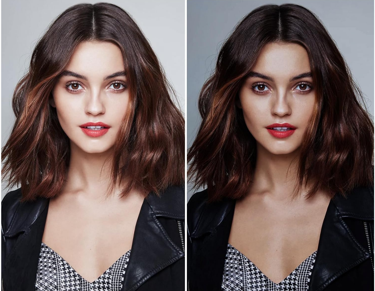
Image 5.3: Demonstration of the VIZOLINK W4DS Webcam's automatic light correction feature, improving image brightness and clarity in challenging lighting conditions.