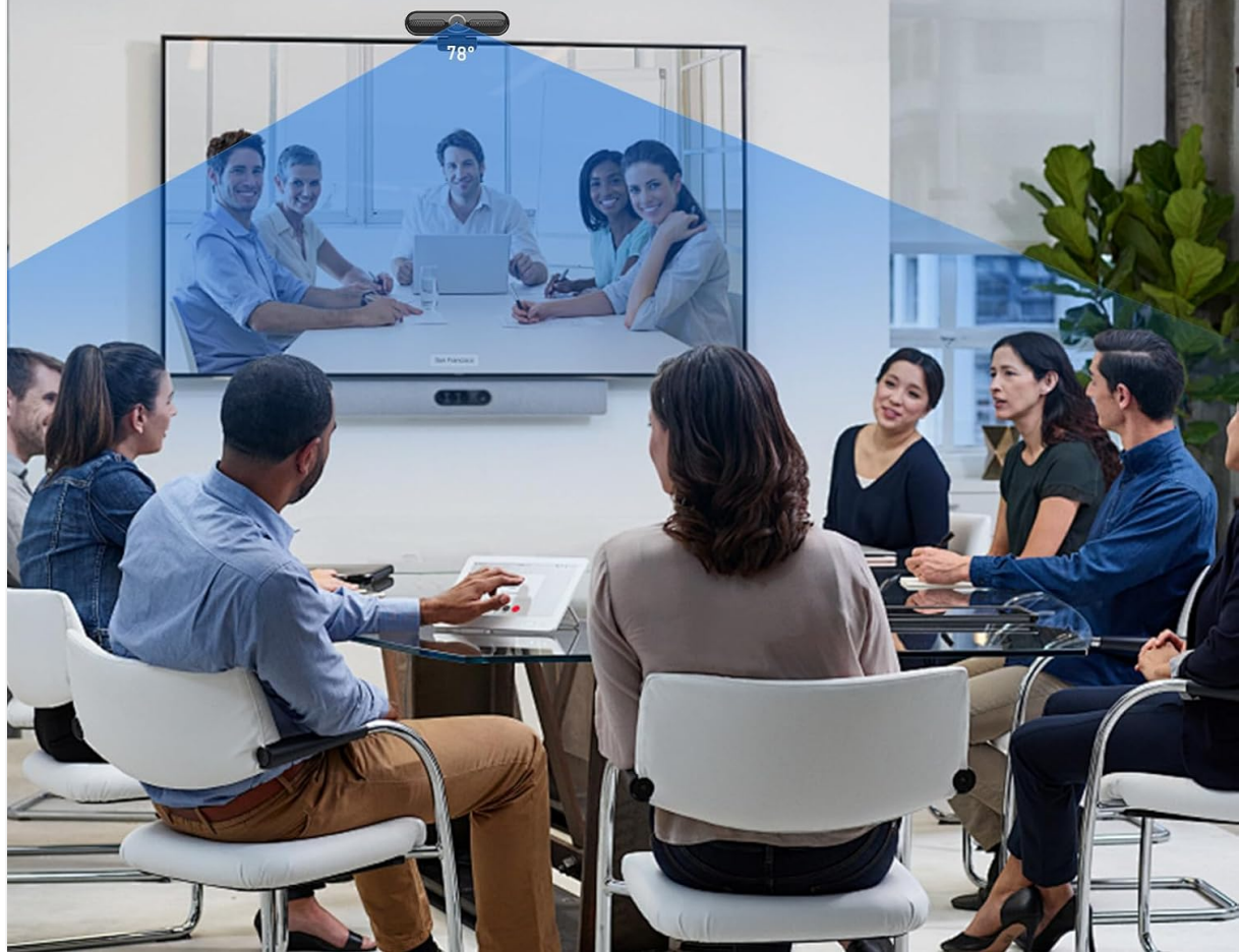
Image 5.2: The VIZOLINK W4DS Webcam's 78-degree field of view, suitable for capturing individuals or small groups in a meeting setting.