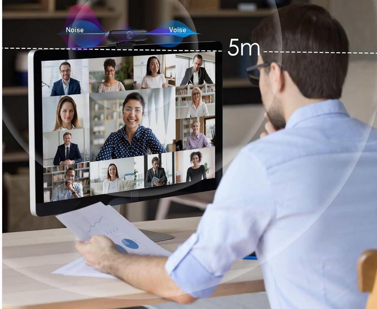
Image 5.4: The VIZOLINK W4DS Webcam's dual stereo noise-cancelling microphone, capable of picking up clear audio from up to 5 meters away while filtering out background noise.