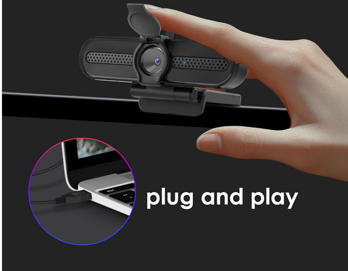
Image 3.1: VIZOLINK W4DS Webcam with privacy cover and USB cable connected to a laptop, illustrating its plug-and-play functionality.