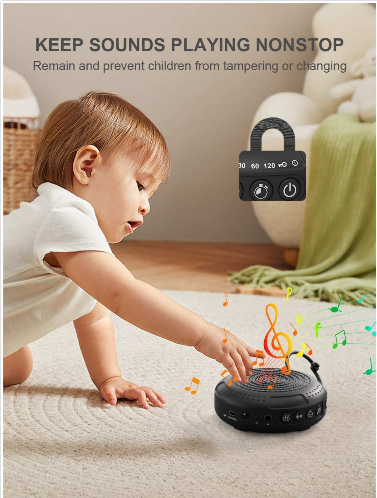
Image: The PPLEE CR1021 White Noise Machine with a visual representation of its child lock feature, designed to maintain settings and prevent tampering.