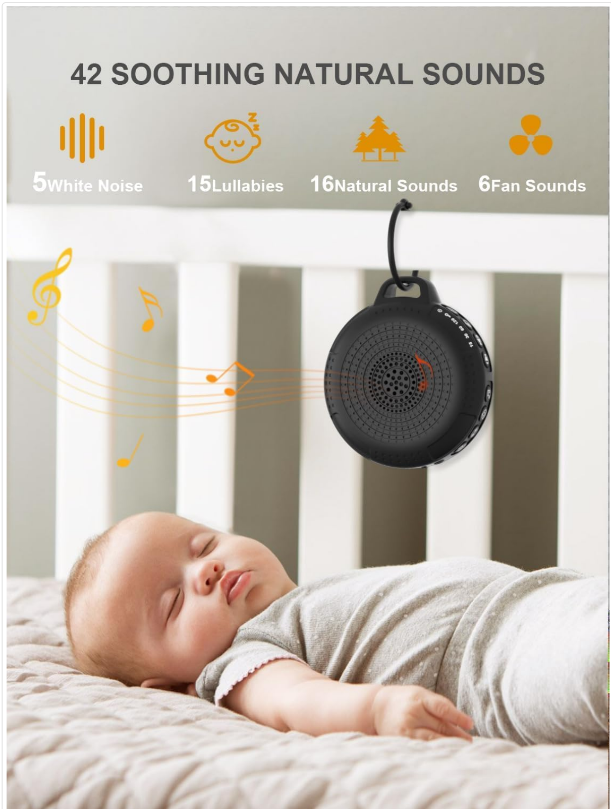
Image: The PPLEE CR1021 White Noise Machine displaying the variety of 42 soothing sounds available, categorized for easy selection.