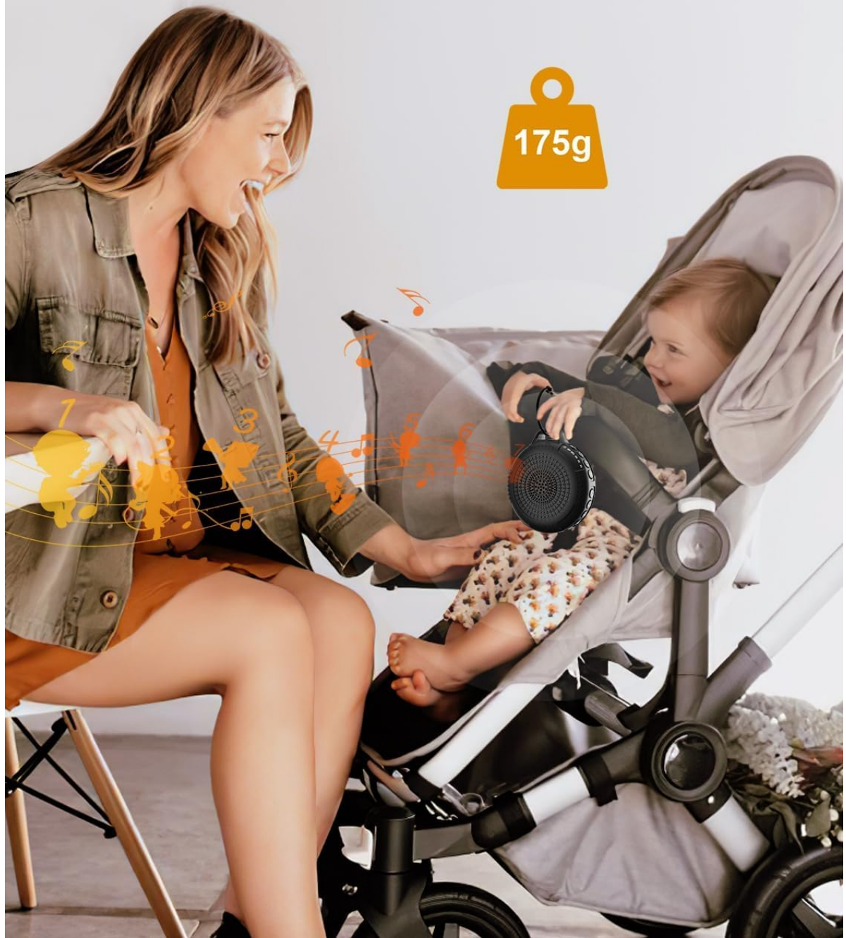
Image: The PPLEE CR1021 White Noise Machine hanging from a stroller, highlighting its compact and portable design for travel.

Small and lightweight makes the outdoors is perfect