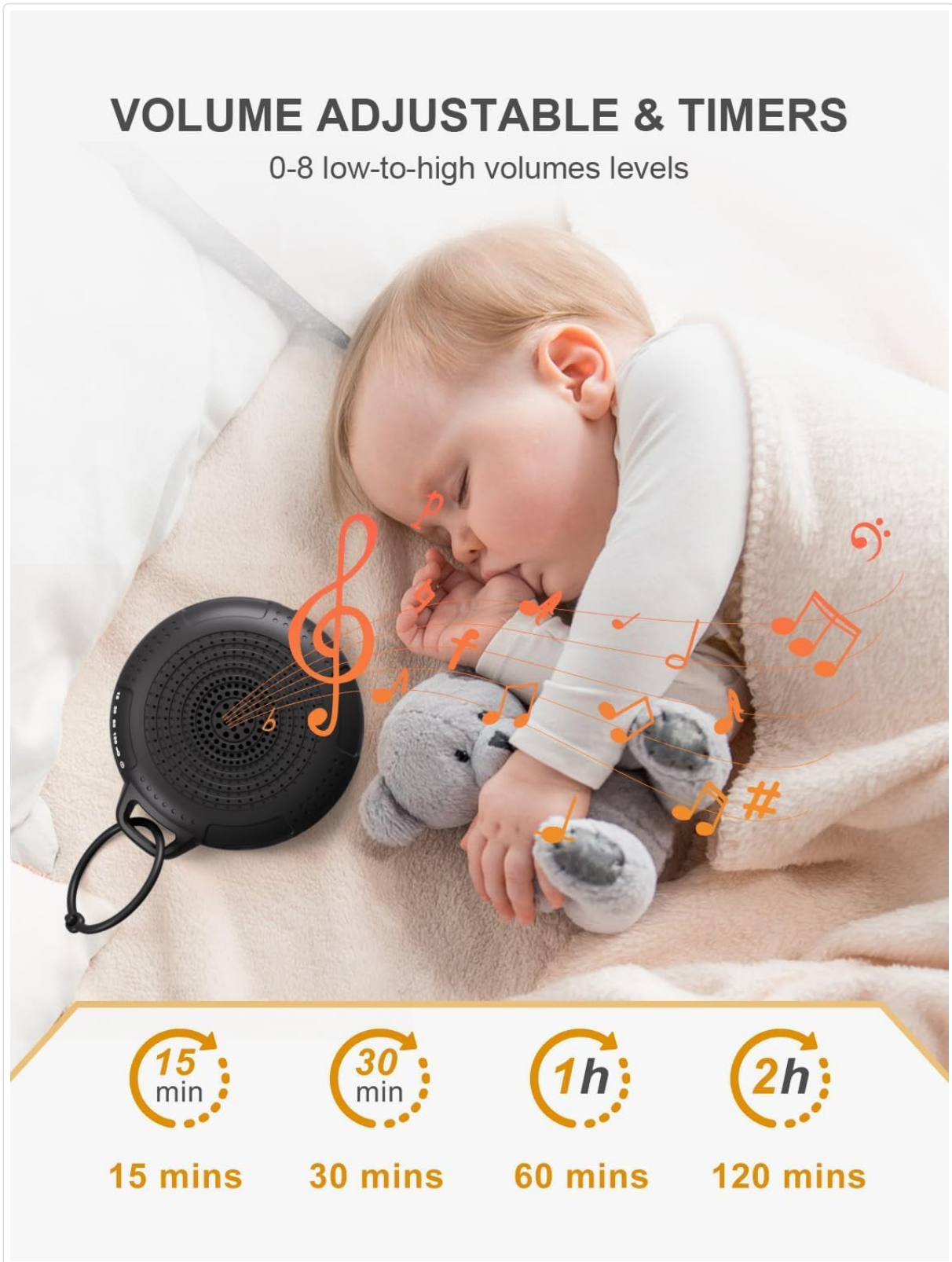
Image: The PPLEE CR1021 White Noise Machine highlighting its volume adjustment and timer functions, showing options for 15, 30, 60, and 120 minutes.