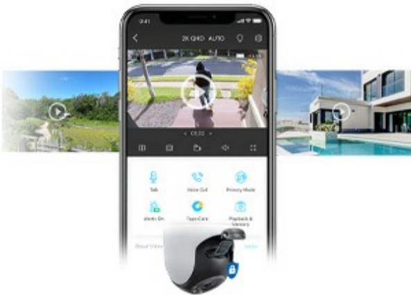
An image depicting a person interacting with a delivery driver via the camera's two-way audio feature.