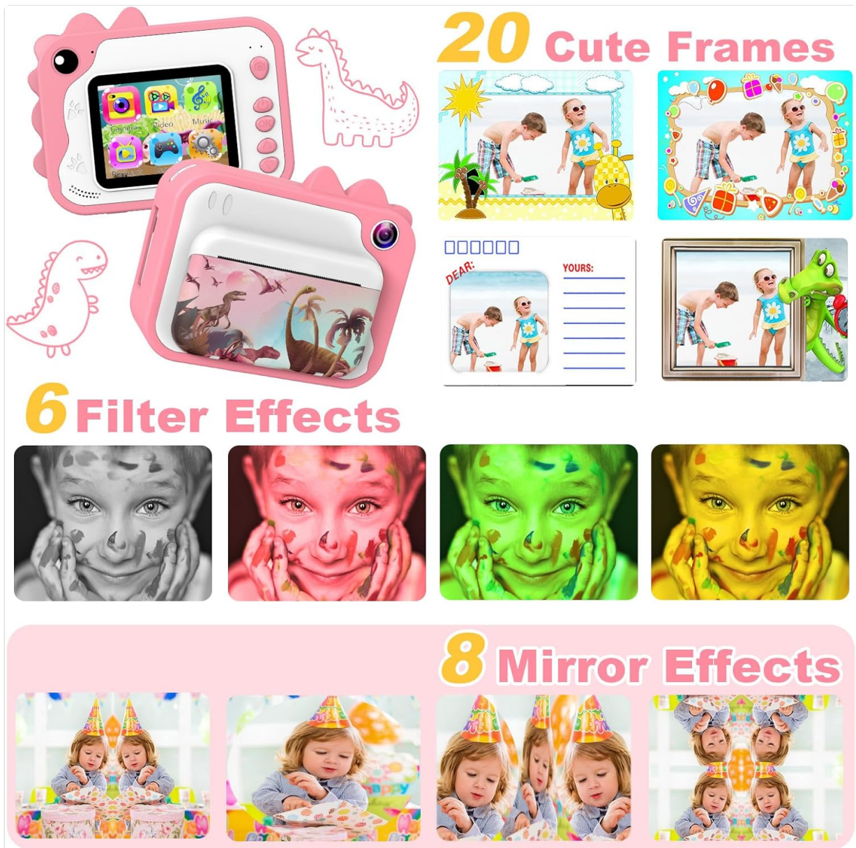
Image 5.3: A visual demonstration of the 20 cute frames, 6 filter effects (including black and white, sepia, vibrant colors), and 8 mirror effects available on the CHAKEYAKE P80 camera.