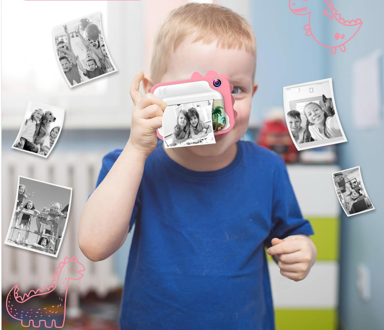
Image 5.1: A child holding the CHAKEYAKE P80 camera, with a printed photo emerging from the device, demonstrating the one-click print function.