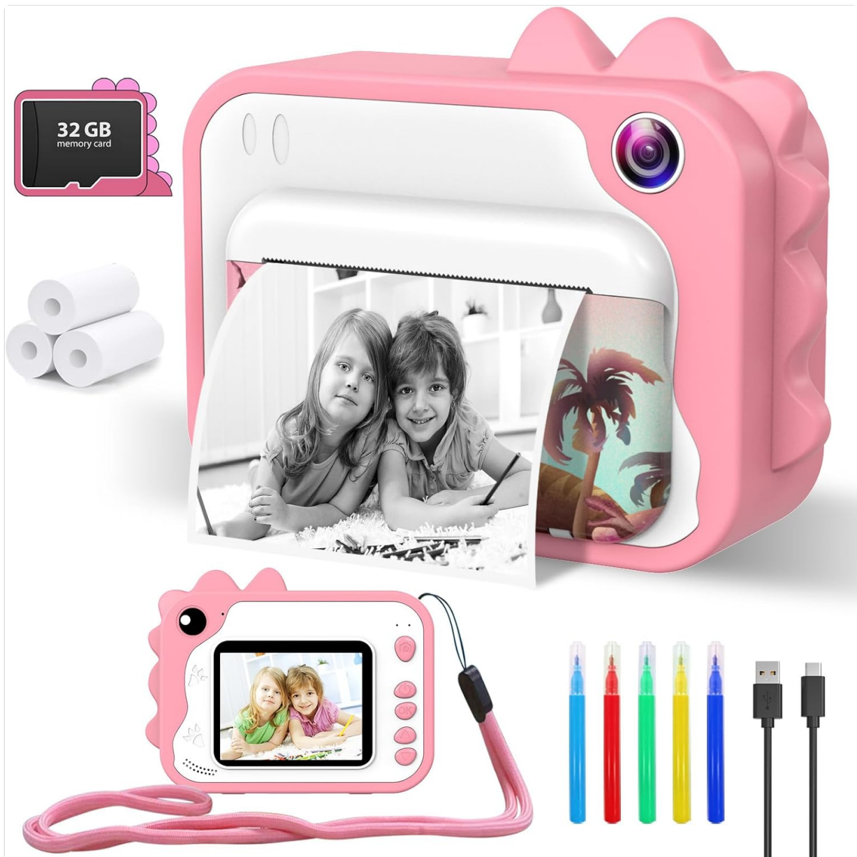
Image 2.1: Contents of the CHAKEYAKE P80 Kids Instant Print Camera package, including the pink camera, a 32GB memory card, three rolls of thermal print paper, a USB charging cable, a pink lanyard, and a set of five coloring pens.