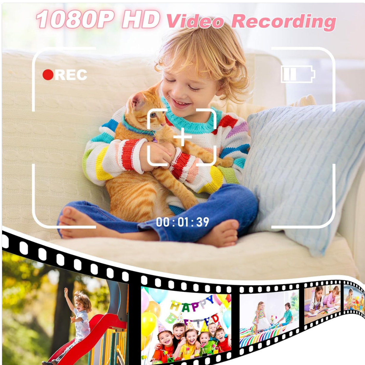
Image 5.2: A representation of the CHAKEYAKE P80 camera screen displaying the 1080P HD video recording interface, with a child and cat as the subject.