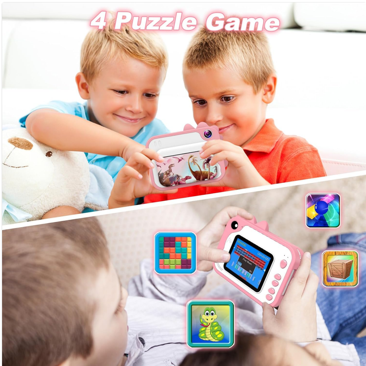
Image 5.6: Two children interacting with the CHAKEYAKE P80 camera, which displays a puzzle game on its screen, illustrating the "4 Puzzle Game" feature.