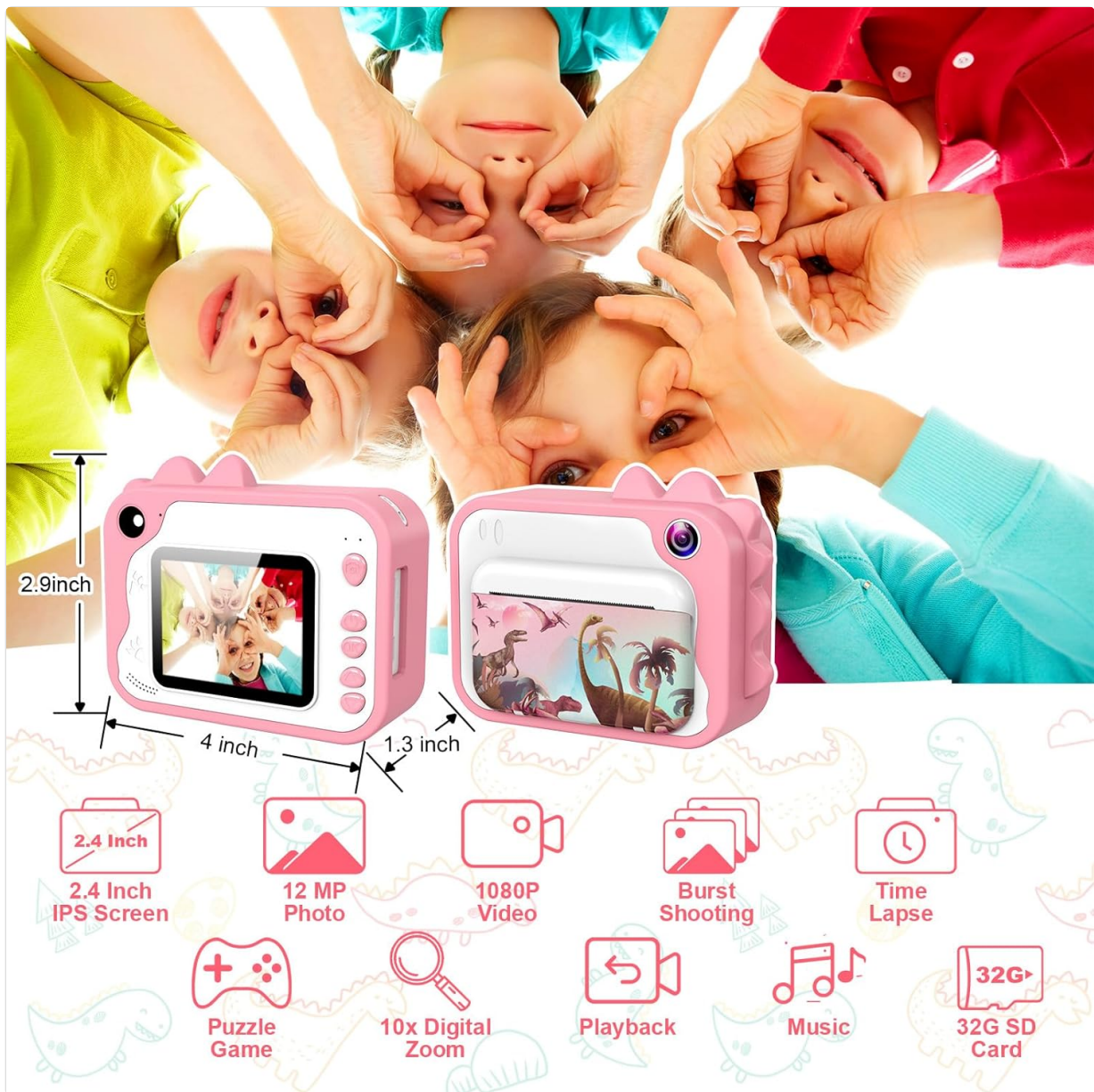
Image 3.1: An illustrative diagram highlighting the key features of the CHAKEYAKE P80 camera, including its 2.4-inch IPS screen, 12MP photo capability, 1080P video recording, burst shooting, time-lapse, puzzle games, 10x digital zoom, playback, and music functions.