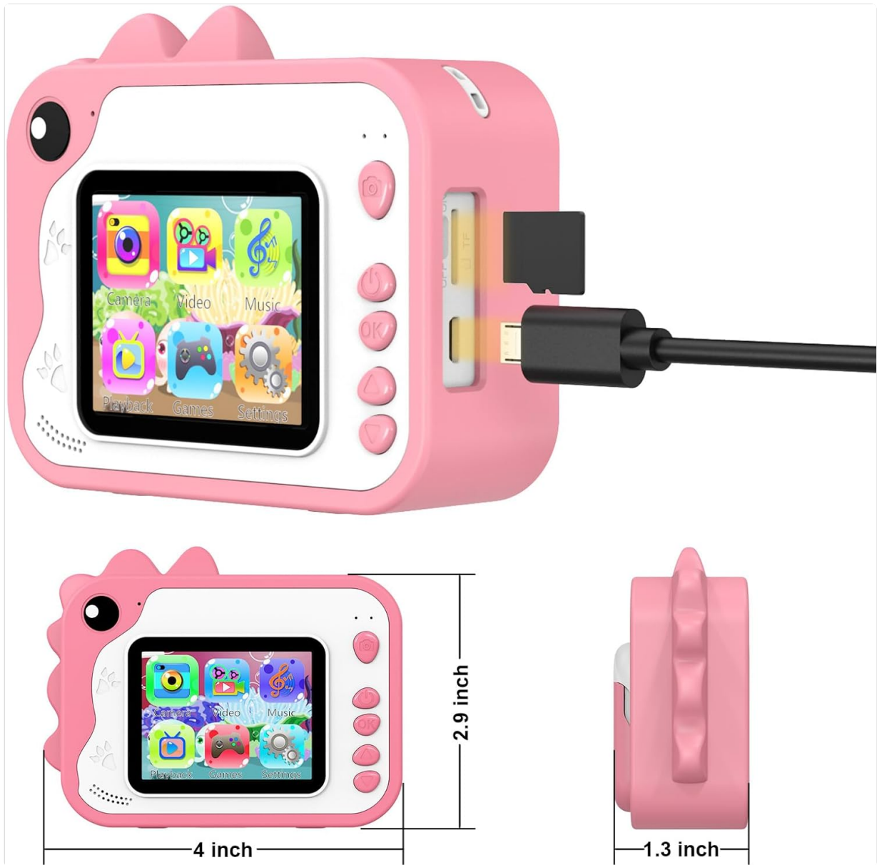
Image 3.2: A side view of the CHAKEYAKE P80 camera, illustrating the location of the TF card slot and the USB charging port.