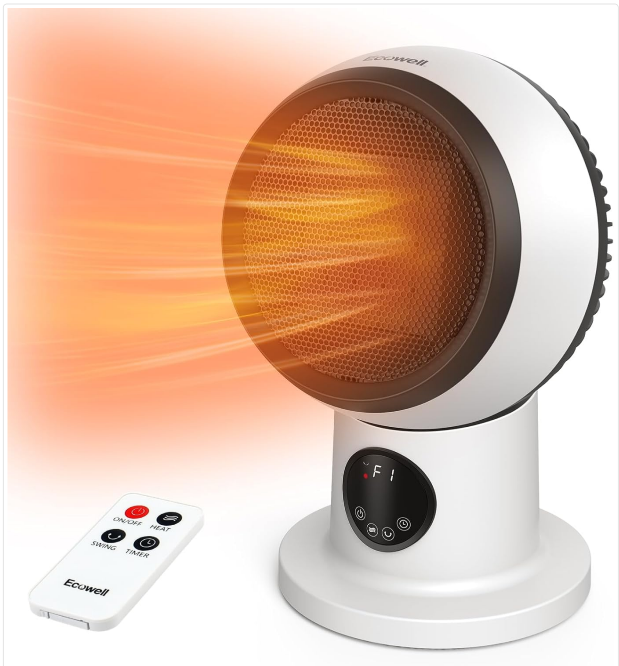
Figure 1: ECOWELL EHT150 Heater and Remote Control. The heater is a compact, modern device with a circular fan/heating element and a base. The remote control has buttons for power, swing, wind/heat mode, and temperature.