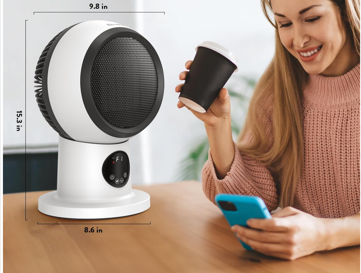
Figure 2: Dimensions of the ECOWELL EHT150 heater. The unit measures 15.3 inches in height, 9.8 inches in depth, and 8.6 inches in width.