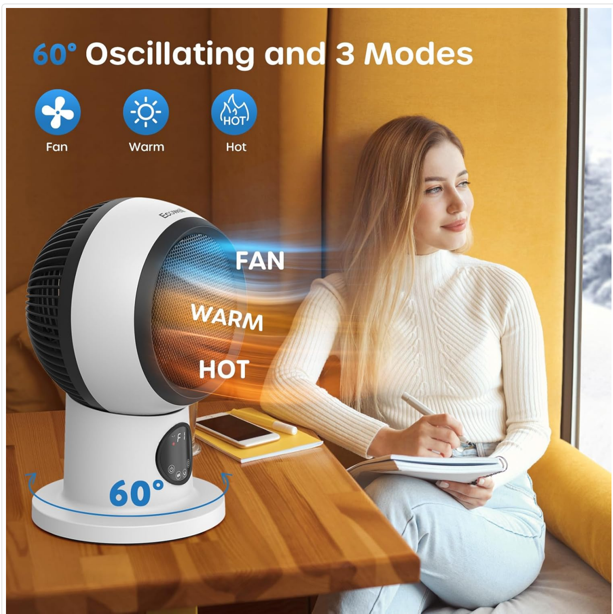
Figure 5: The heater offers 60-degree automatic oscillation for wide-angle heat distribution and three modes: Fan, Warm, and Hot.