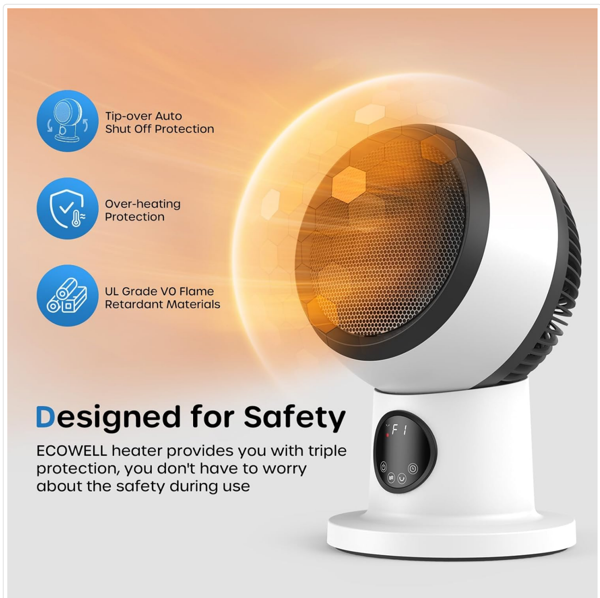
Figure 6: Visual representation of the heater's safety features including Tip-over Auto Shut-Off, Over-heating Protection, and UL Grade V0 Flame Retardant Materials.