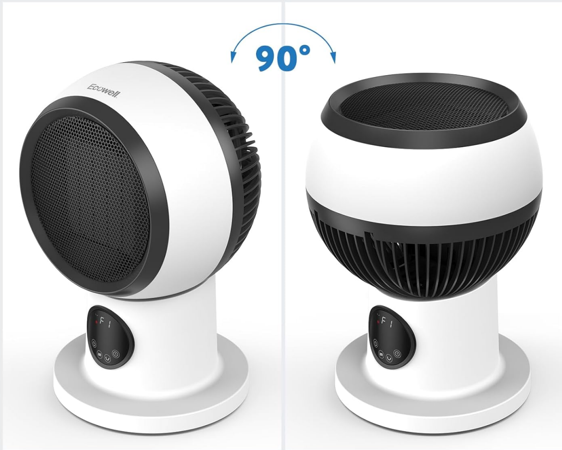
Figure 4: The heater head can be manually tilted up to 90 degrees to direct airflow as needed.

You can adjust the angle of the heater according to your different postures