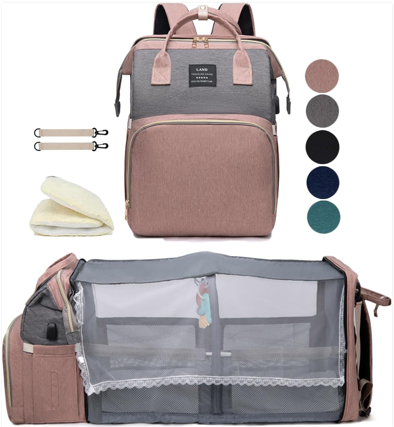
Figure 1: The Houscly Diaper Backpack in its backpack configuration and unfolded as a changing station, showcasing its dual functionality.