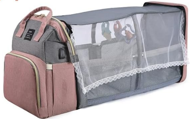
Baby Protection Sunshade and Anti-mosquito