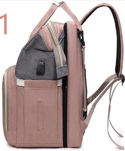
Baby Bag Model