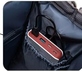
POWER BANK POCKET