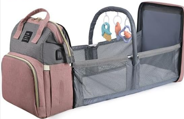
Baby Play Station