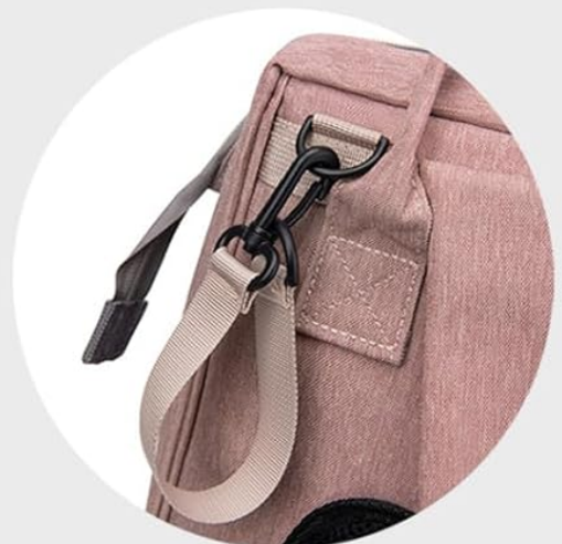
Figure 5: Details of the multifunctional design, including the power bank pocket, USB port, dry & wet separation compartment, and insulated bottle pockets.