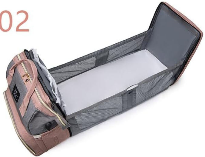
Baby Bed or Change Station