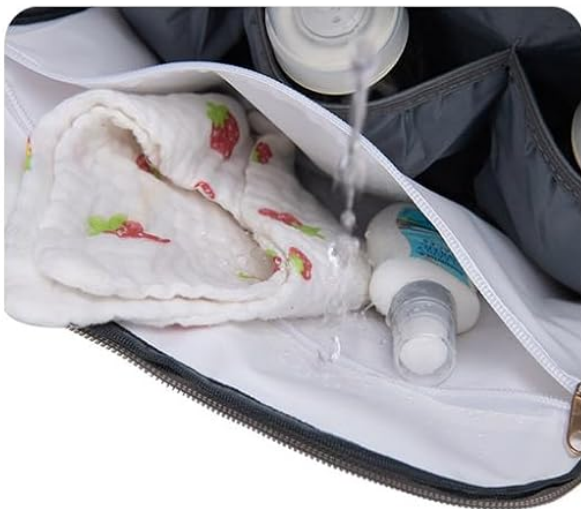
DRY & WET SEPARATION