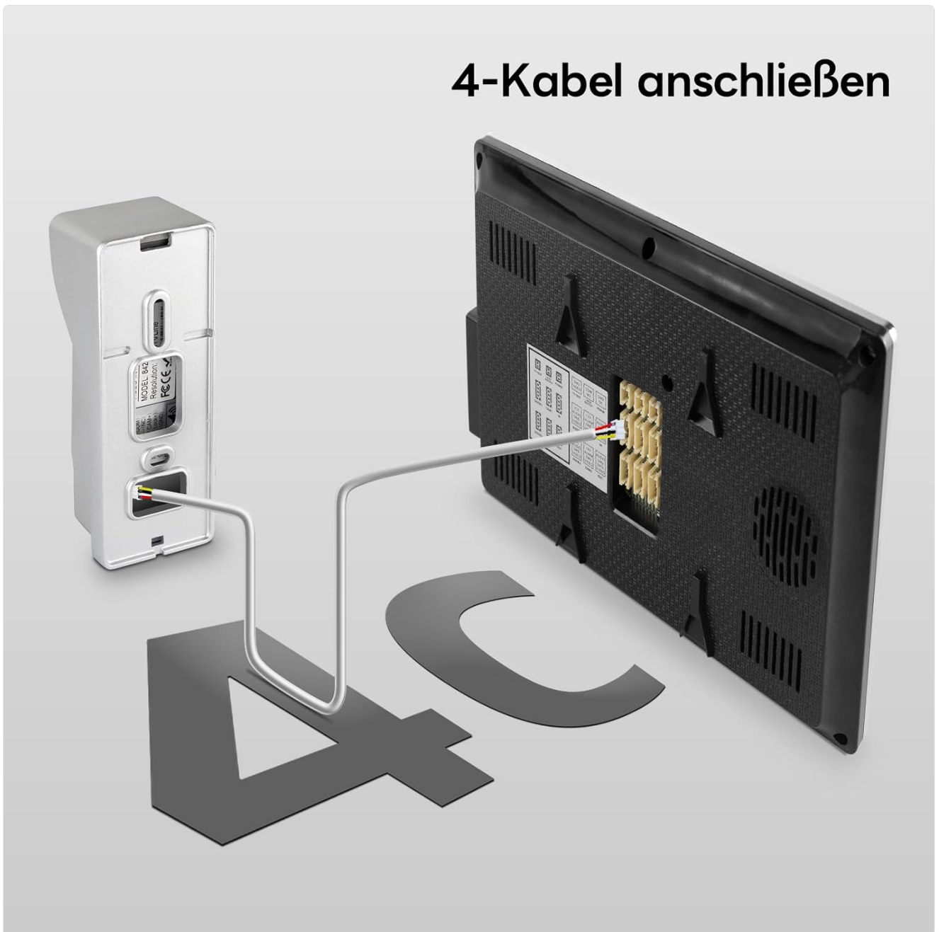
Figure 3.1: Illustration of the 4-wire connection between the outdoor doorbell unit and the indoor monitor.