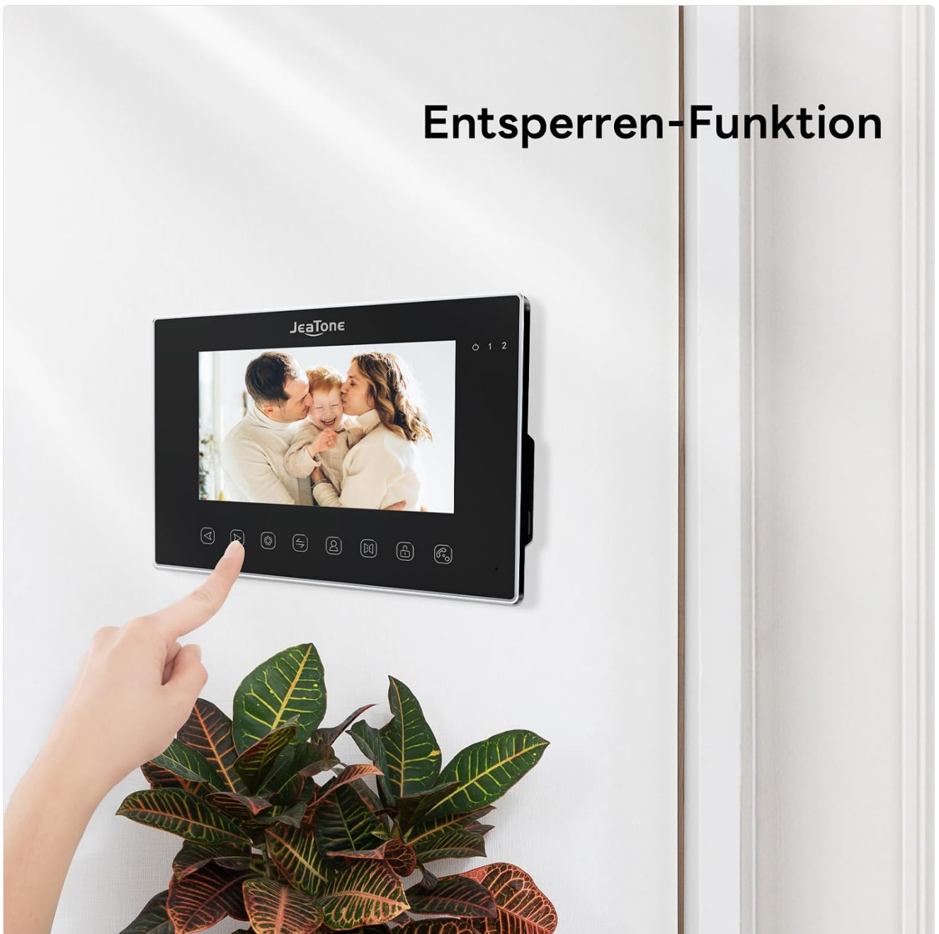
Figure 4.4: A finger interacting with the touch-sensitive unlock button on the indoor monitor, demonstrating the remote unlock feature.