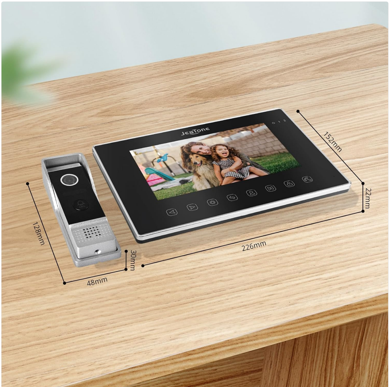
Figure 2.2: Detailed dimensions of both the indoor monitor and the outdoor doorbell unit, providing measurements for installation planning.