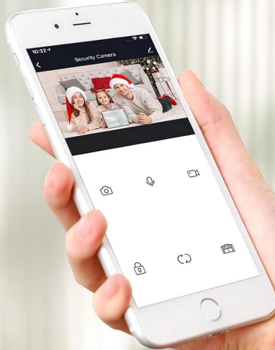
Figure 4.1: A hand holding a smartphone showing the Tuya app, which enables remote viewing and unlocking functionalities.