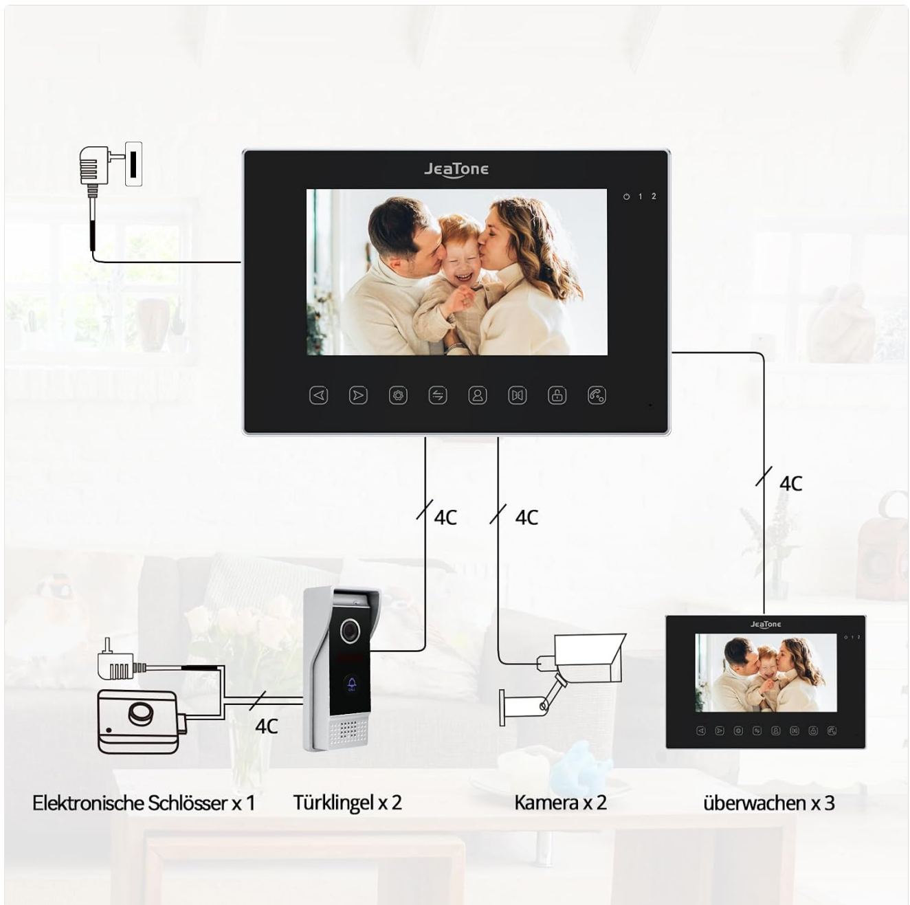
Figure 3.2: Diagram illustrating how to expand the system with additional indoor monitors, CCTV cameras, and electronic locks.