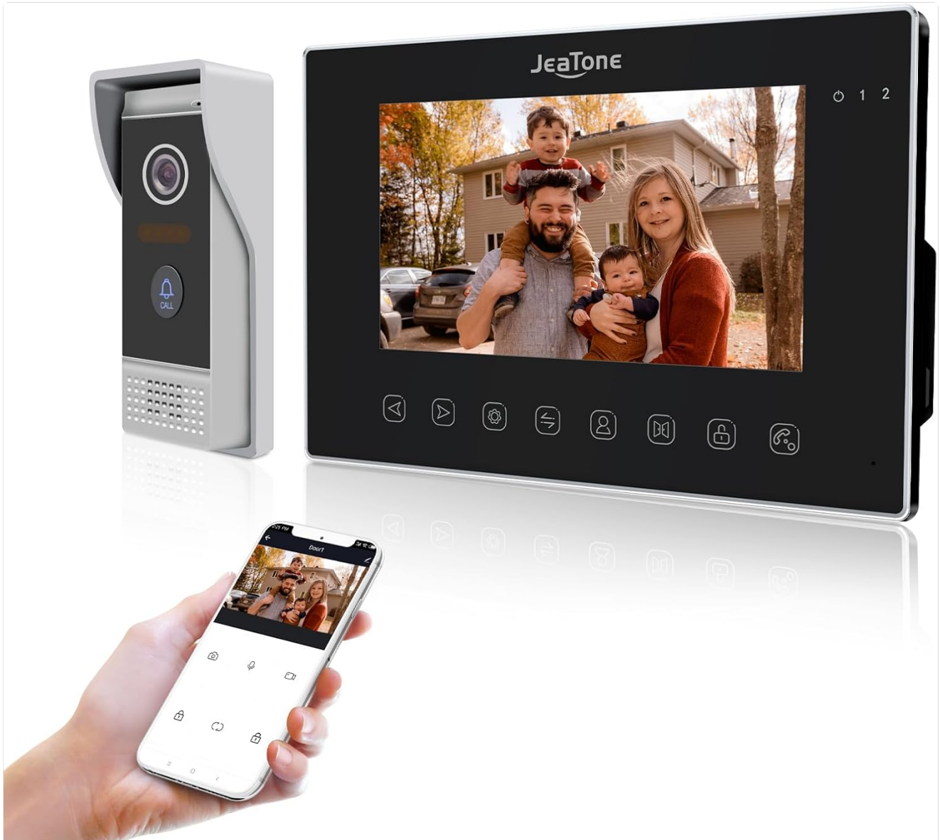
Figure 2.1: Overview of the JeaTone Wifi Video Doorbell Intercom System, showing the outdoor doorbell unit, the indoor monitor, and a smartphone displaying the mobile application.