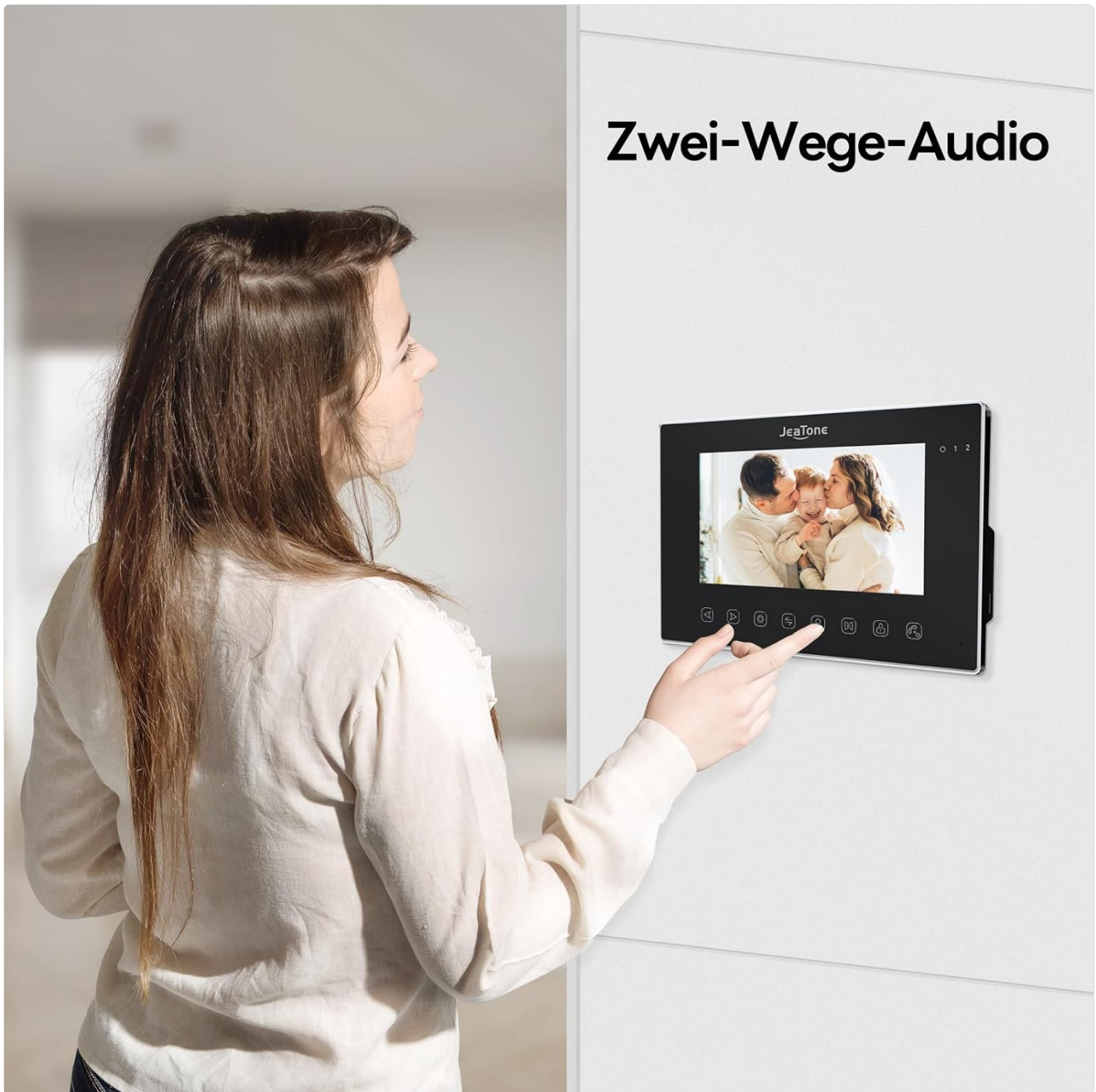
Figure 4.5: A person interacting with the indoor monitor, illustrating the two-way audio communication capability with visitors.