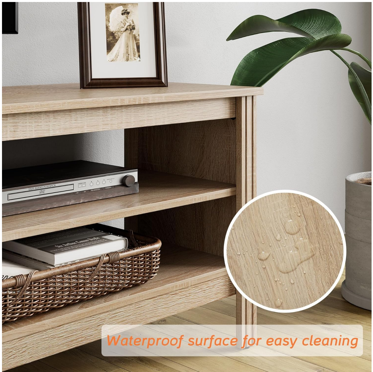
Image: Detailed view of the storage compartments, illustrating their practical use for organizing household items.