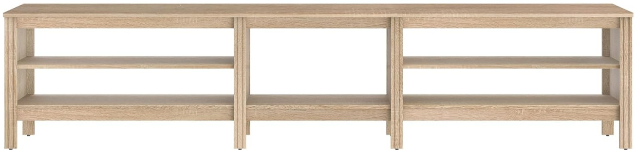
Image: Visual guide demonstrating the TV stand's capacity for different television sizes and its modular configuration.