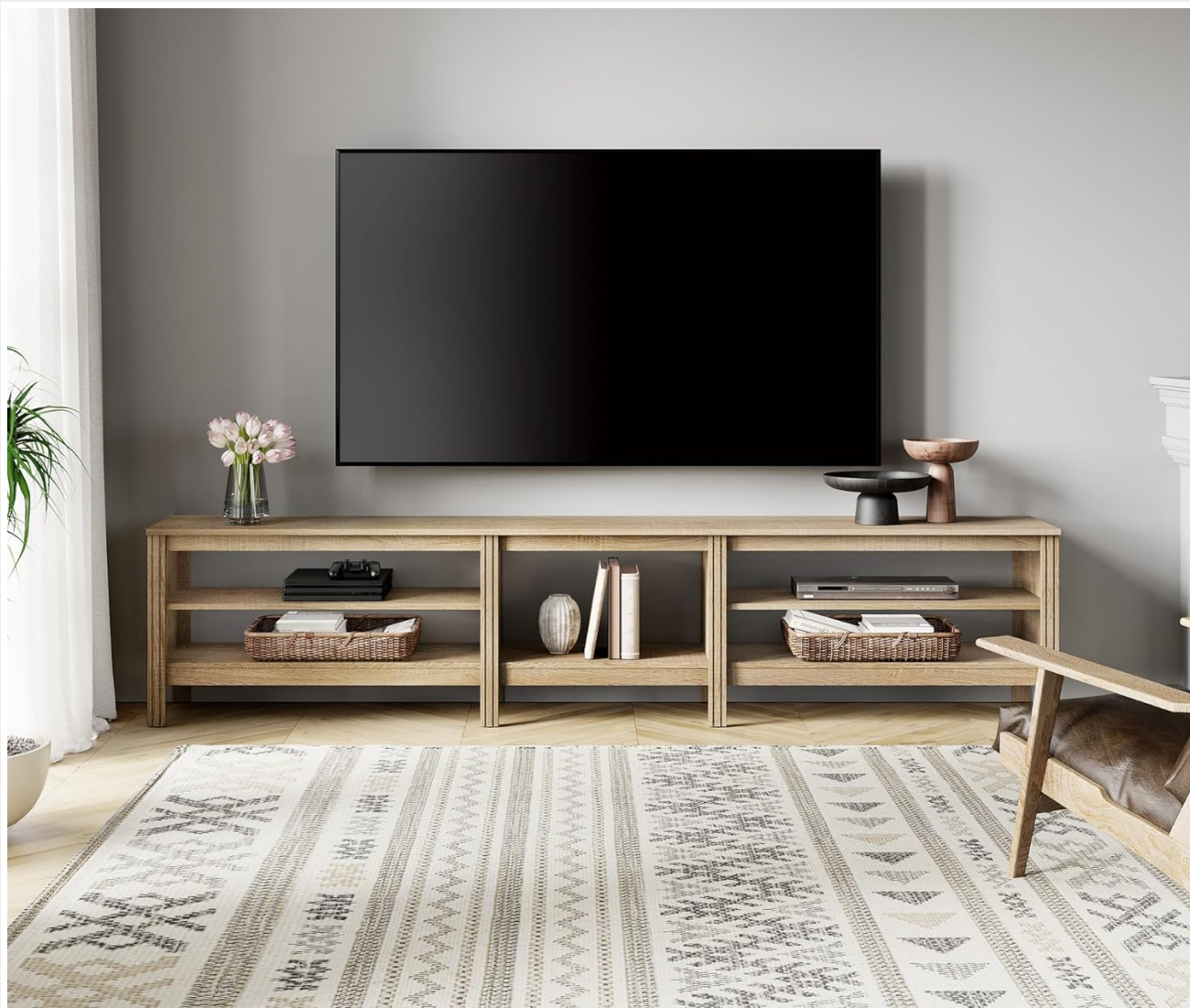
Image: The WAMPAT Sunbury TV Stand displayed in a living room, showcasing its design and capacity to hold various items in its cubbies.