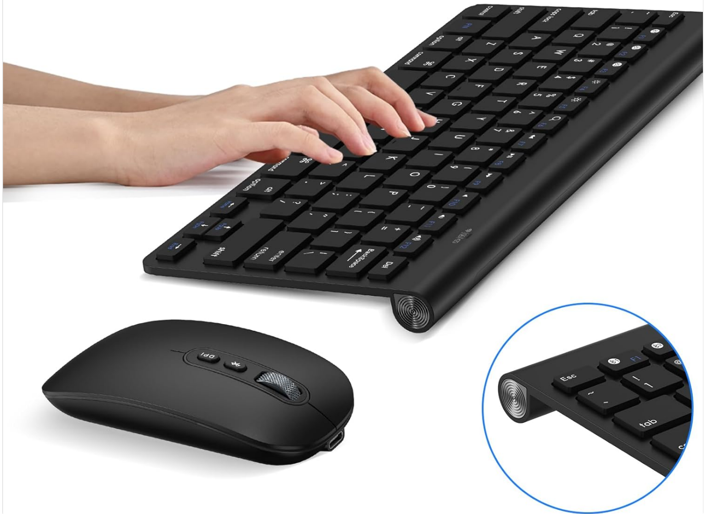
Image: A user's hands positioned on the keyboard, demonstrating its ergonomic design for comfortable typing, with the mouse visible next to it.