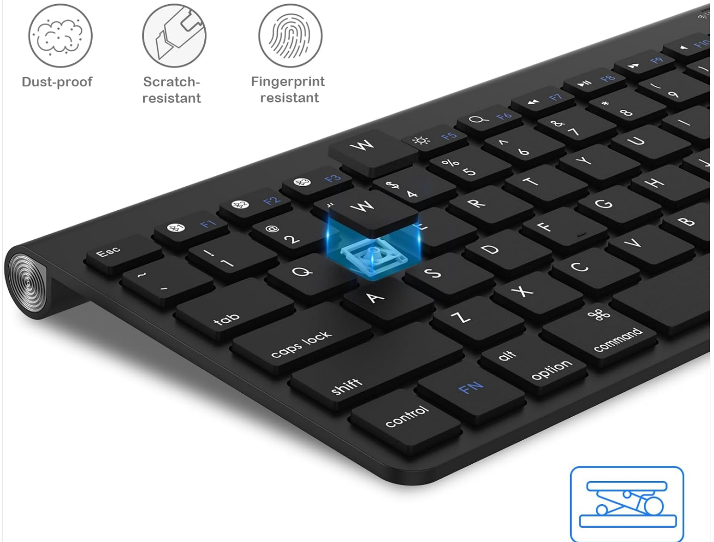
Image: A close-up view of the keyboard highlighting the scissor-switch key mechanism, which ensures responsive and quiet typing.