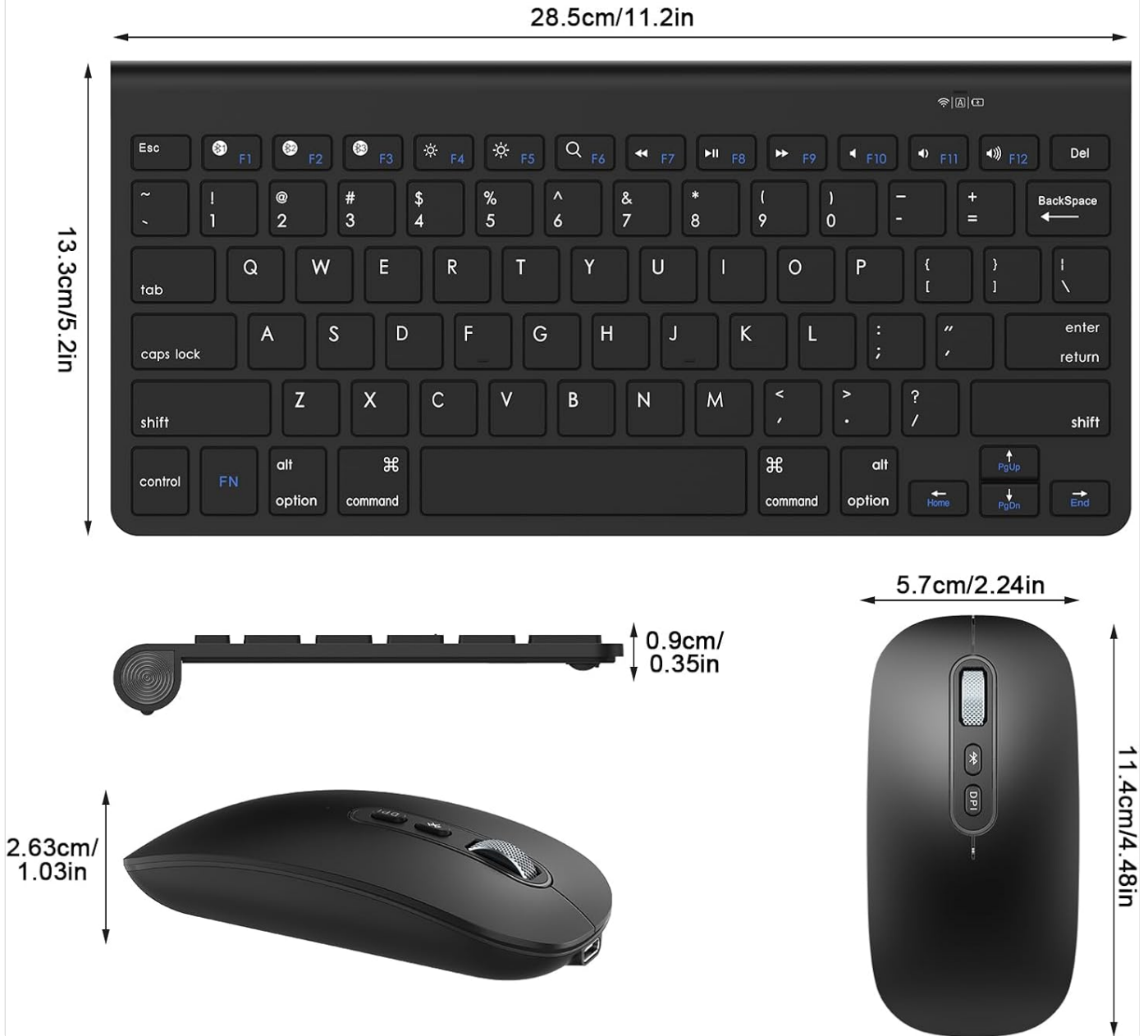
Image: Diagram showing the precise dimensions of both the cimeteck keyboard and mouse.