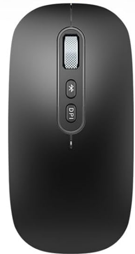
Image: The cimetech mouse, highlighting its silent click feature, positioned next to the keyboard.