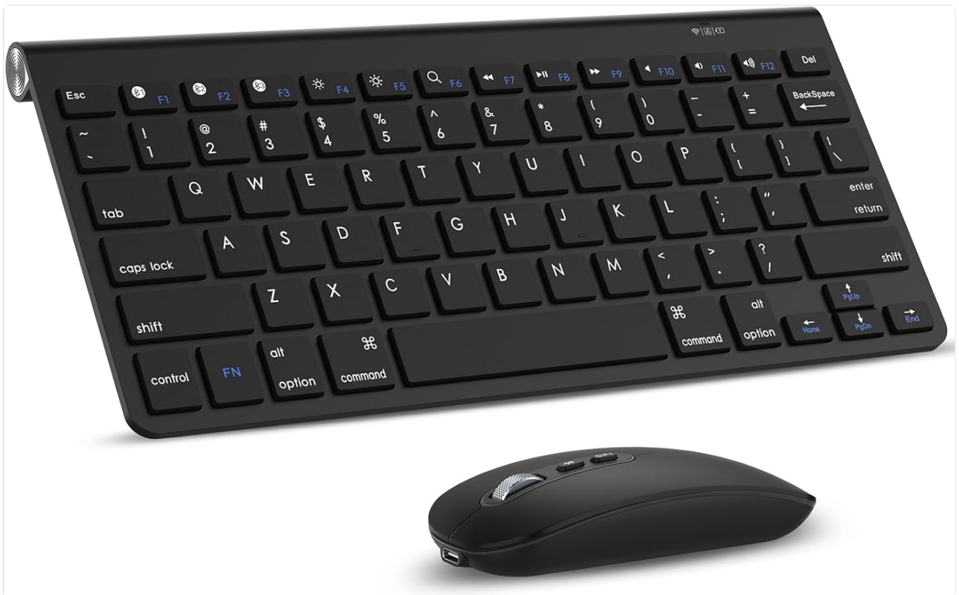
Image: The cimeteck Bluetooth Keyboard and Mouse combo, showcasing the sleek black design of both devices.