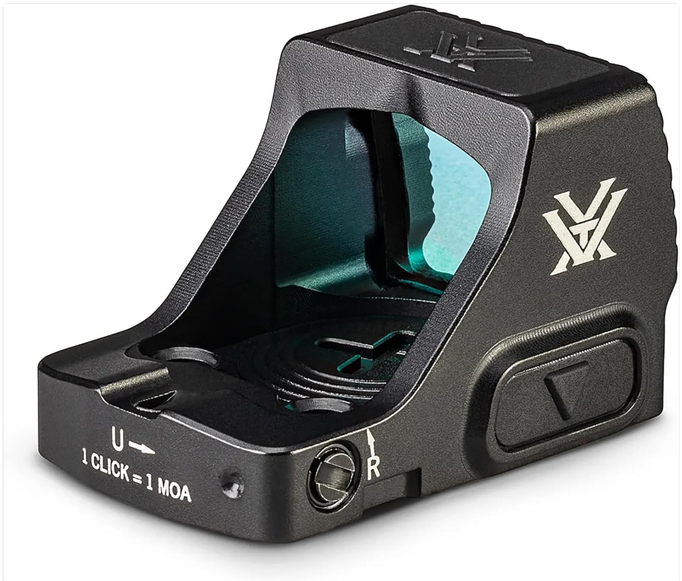
Figure 4.1: Underside of the Defender-CCW, illustrating mounting points.