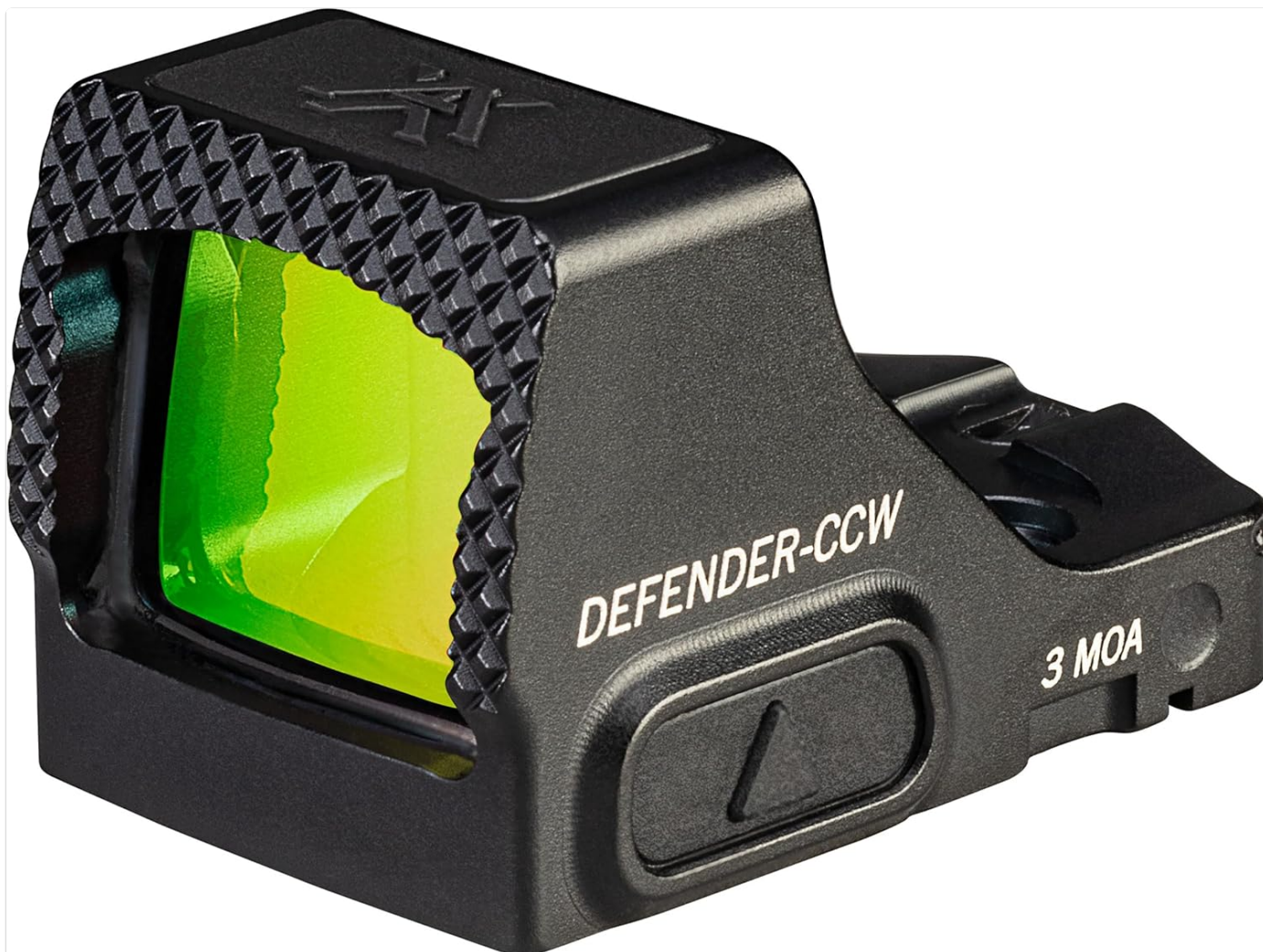
Figure 1.1: Front-side view of the Vortex Optics Defender-CCW Micro Red Dot Sight.

The Vortex Optics Defender-CCW Micro Red Dot Sight is engineered for compact everyday carry, offering a blend of concealment, reliability, and rapid target acquisition. It features a class-leading window size with minimal optical distortion, providing a clear and true sight picture. Adjustable brightness lets you find the perfect setting for your eye, while a button lockout feature prevents unintended adjustments. With motion activation and an auto-shutoff function, the Defender-CCW is designed to be ready when needed while conserving battery life.