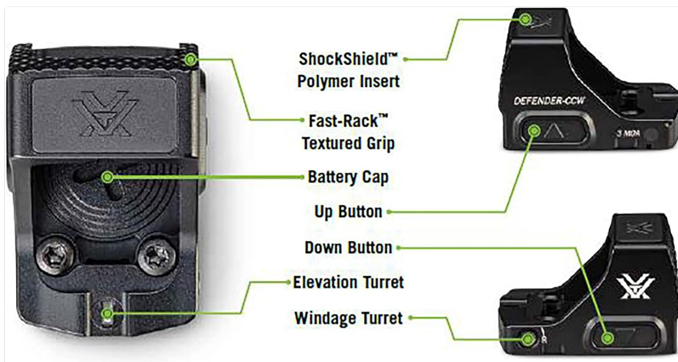
Figure 2.1: All included components in the Defender-CCW package.