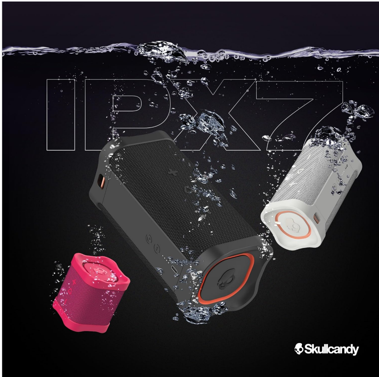
Image: Multiple Skullcandy Terrain speakers partially submerged in water, demonstrating their IPX7 waterproof capability.