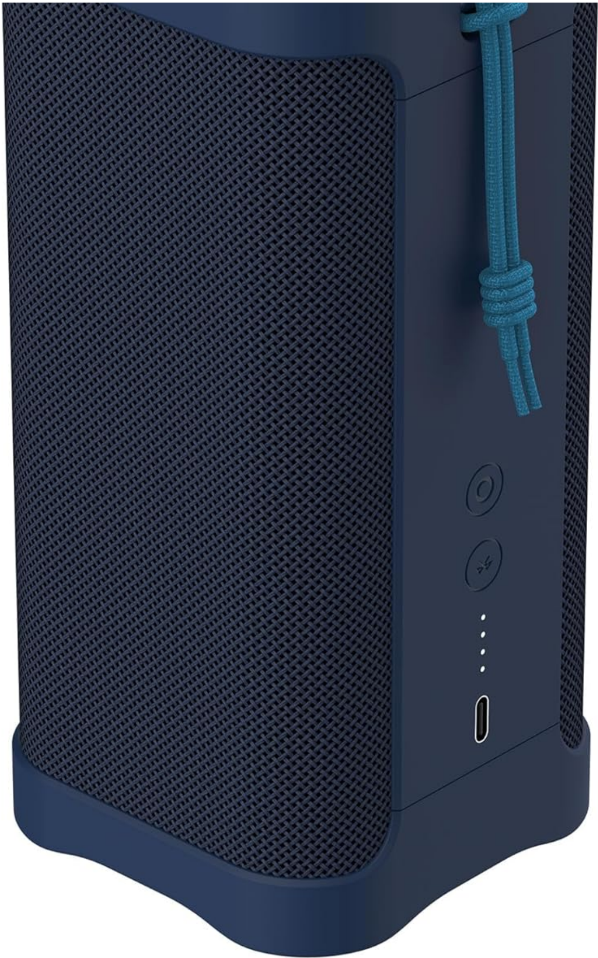
Image: The Skullcandy Terrain XL speaker in Navy color, shown with its packaging.