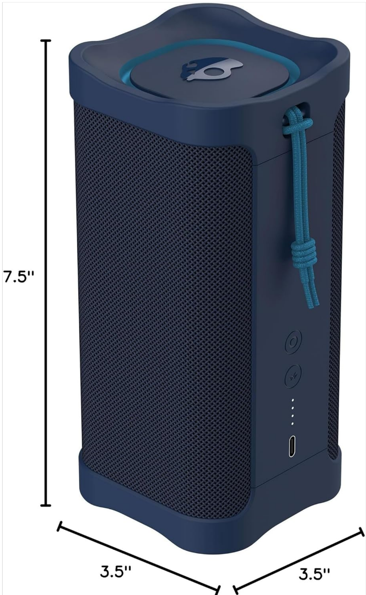
Image: A diagram showing the dimensions of the Skullcandy Terrain XL speaker: 7.5 inches tall, 3.5 inches wide, and 3.5 inches deep.