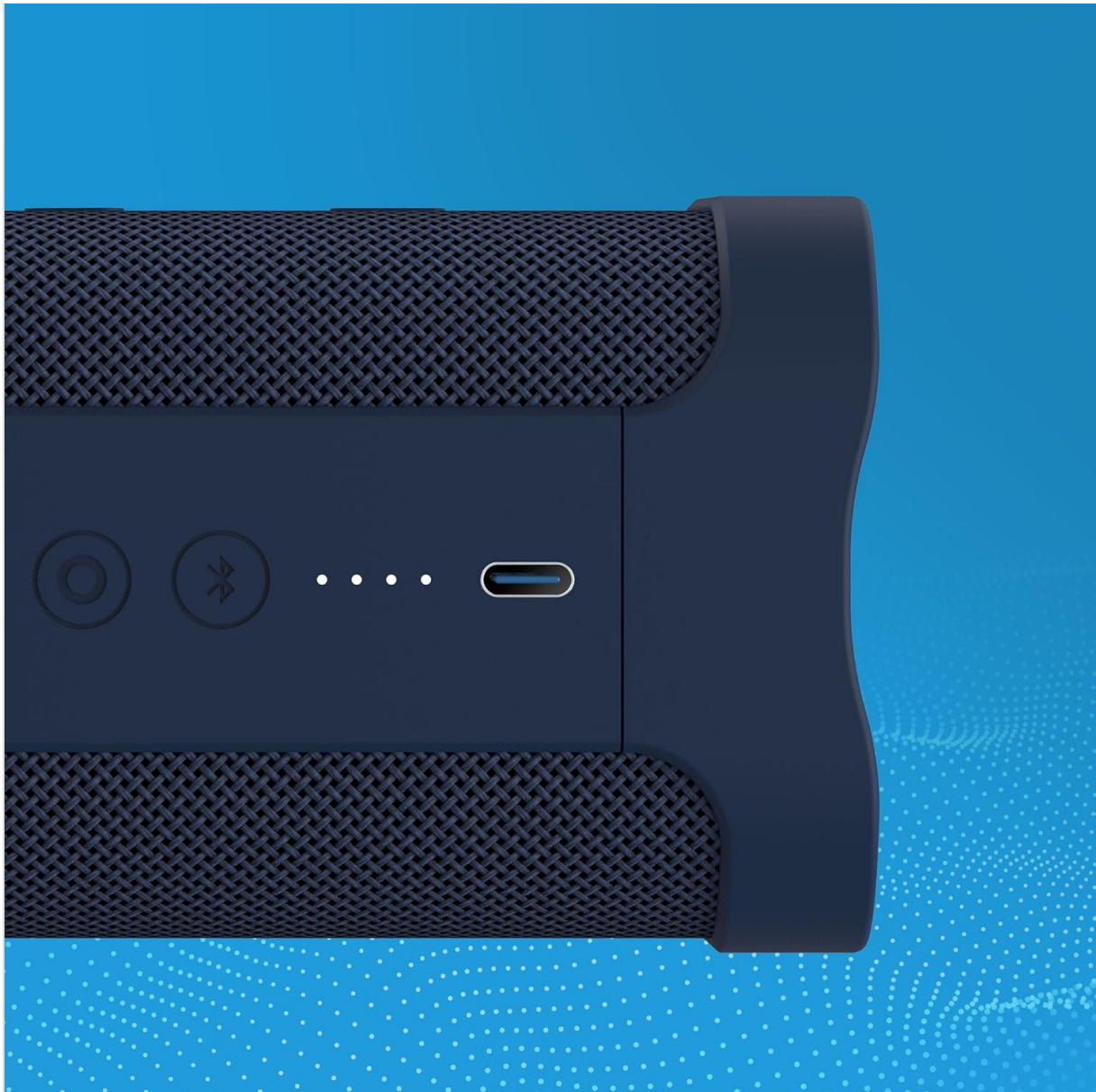
Image: A detailed view of the side panel of the Skullcandy Terrain XL speaker, showing the power button, Bluetooth button, LED indicators, and USB-C charging port.