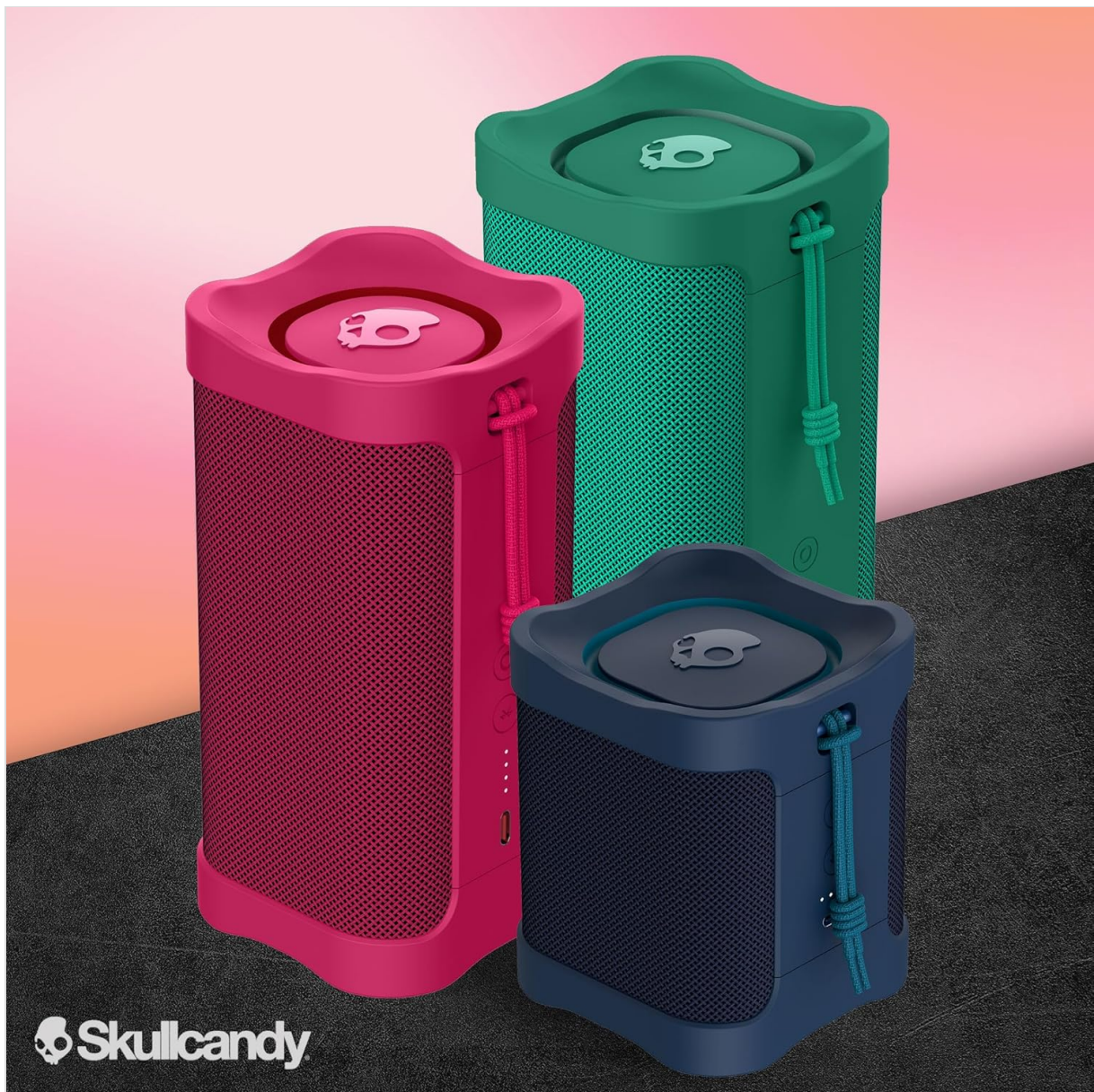
Image: Three Skullcandy Terrain speakers of different colors (pink, green, navy) shown together, illustrating the Multi-Link feature.