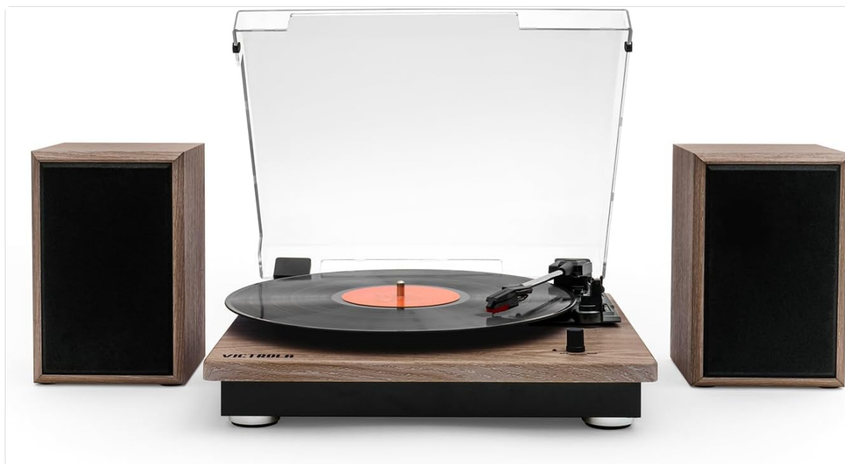
Figure 1: Victrola Montauk Vinyl Record Player with included stereo speakers.

This manual provides detailed instructions for the setup, operation, and maintenance of your Victrola Montauk Vinyl Record Player, Model VM-135-FNT. This belt-driven turntable system offers three playback speeds, integrated Bluetooth connectivity, and includes matching stereo speakers for a complete audio experience. Please read this manual thoroughly before use to ensure proper functionality and longevity of your product.