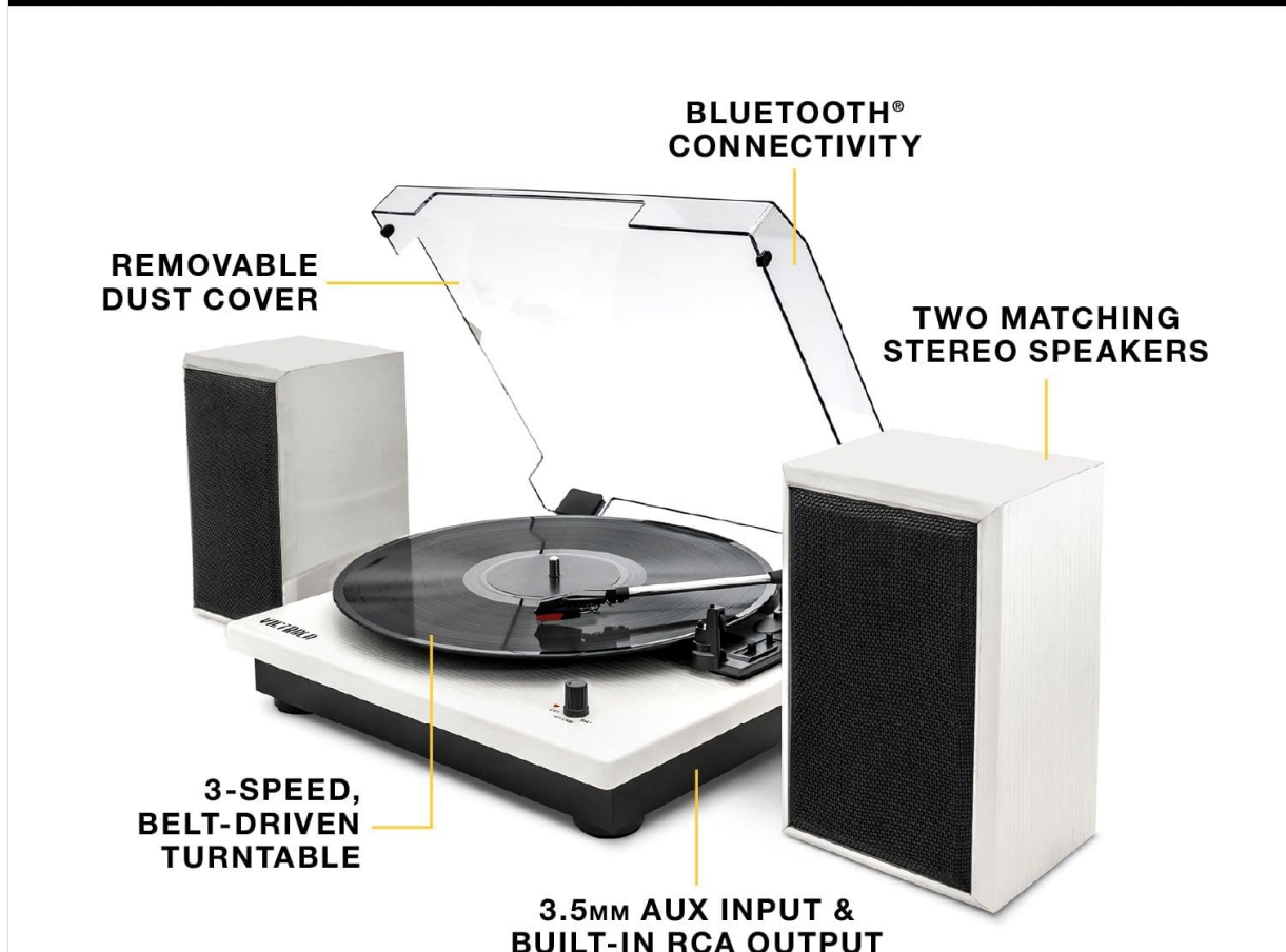
Figure 2: All components included in the Victrola Montauk package.