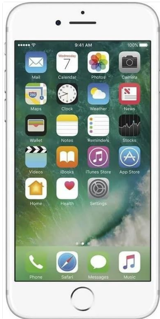
Image: The home screen of the Apple iPhone 7, showing the arrangement of default applications.