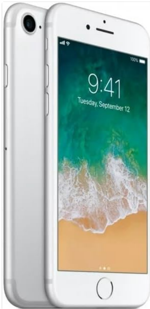
Image: Front and side view of the Apple iPhone 7 in Silver.