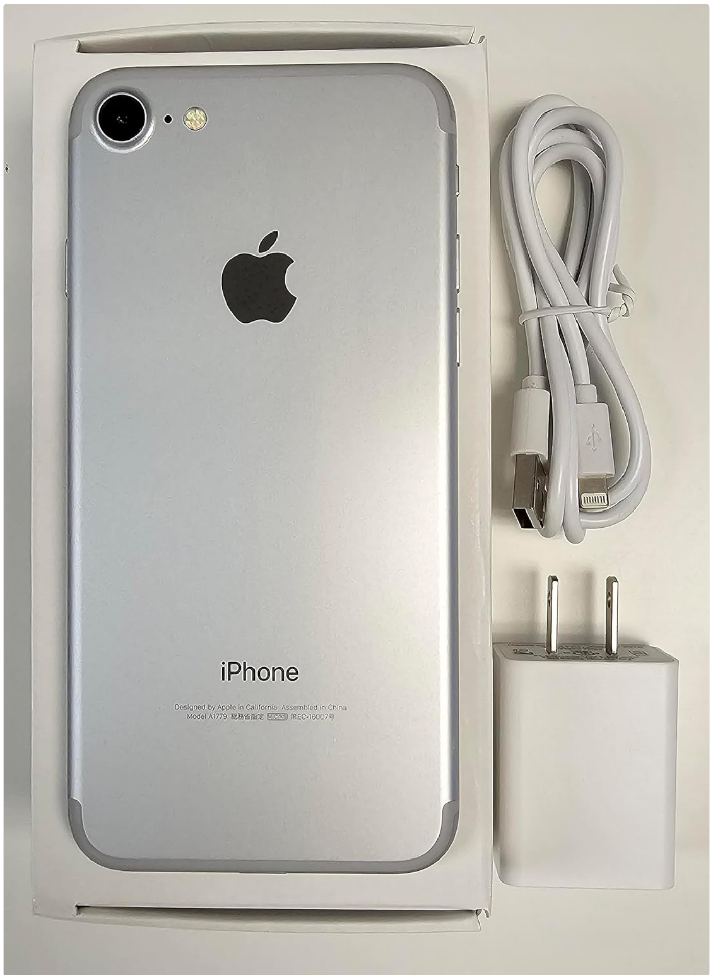
Image: Contents of the iPhone 7 package, including the device, charging cable, and wall adapter.