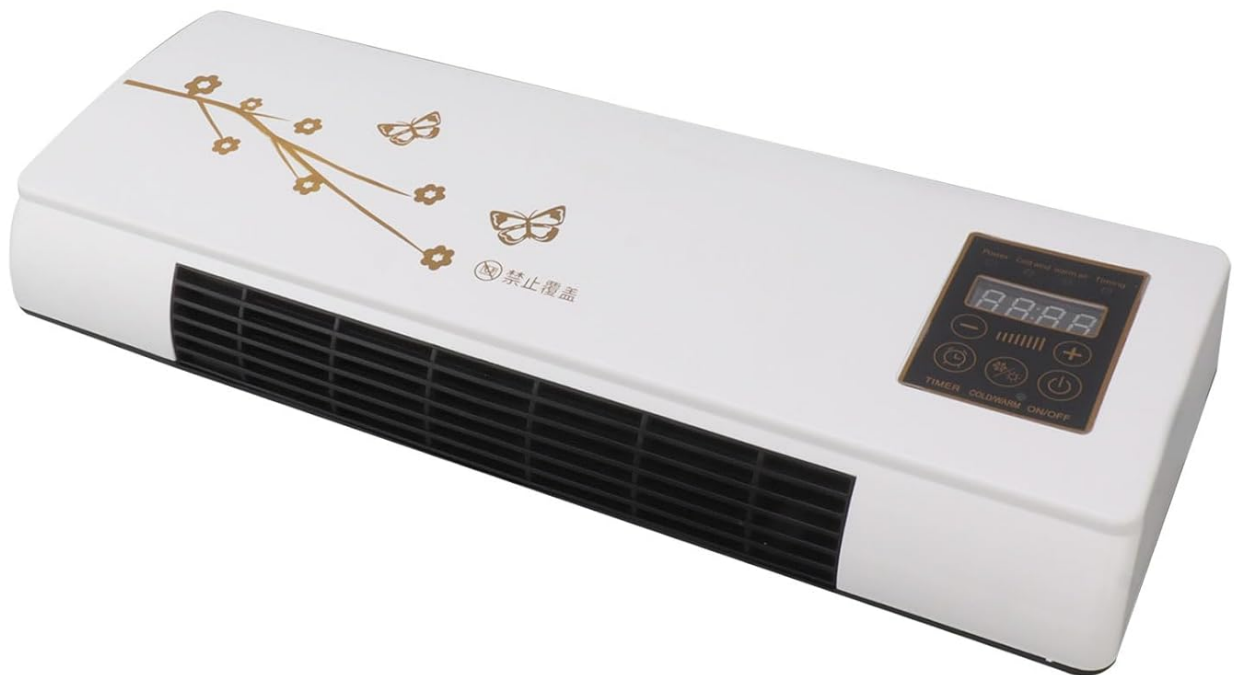
Image: The heating machine installed on a wall in a bedroom setting, illustrating its discreet placement and space-saving benefit.