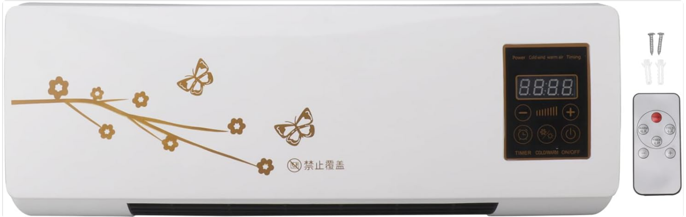
Image: The main unit, remote control, and mounting hardware included in the package.