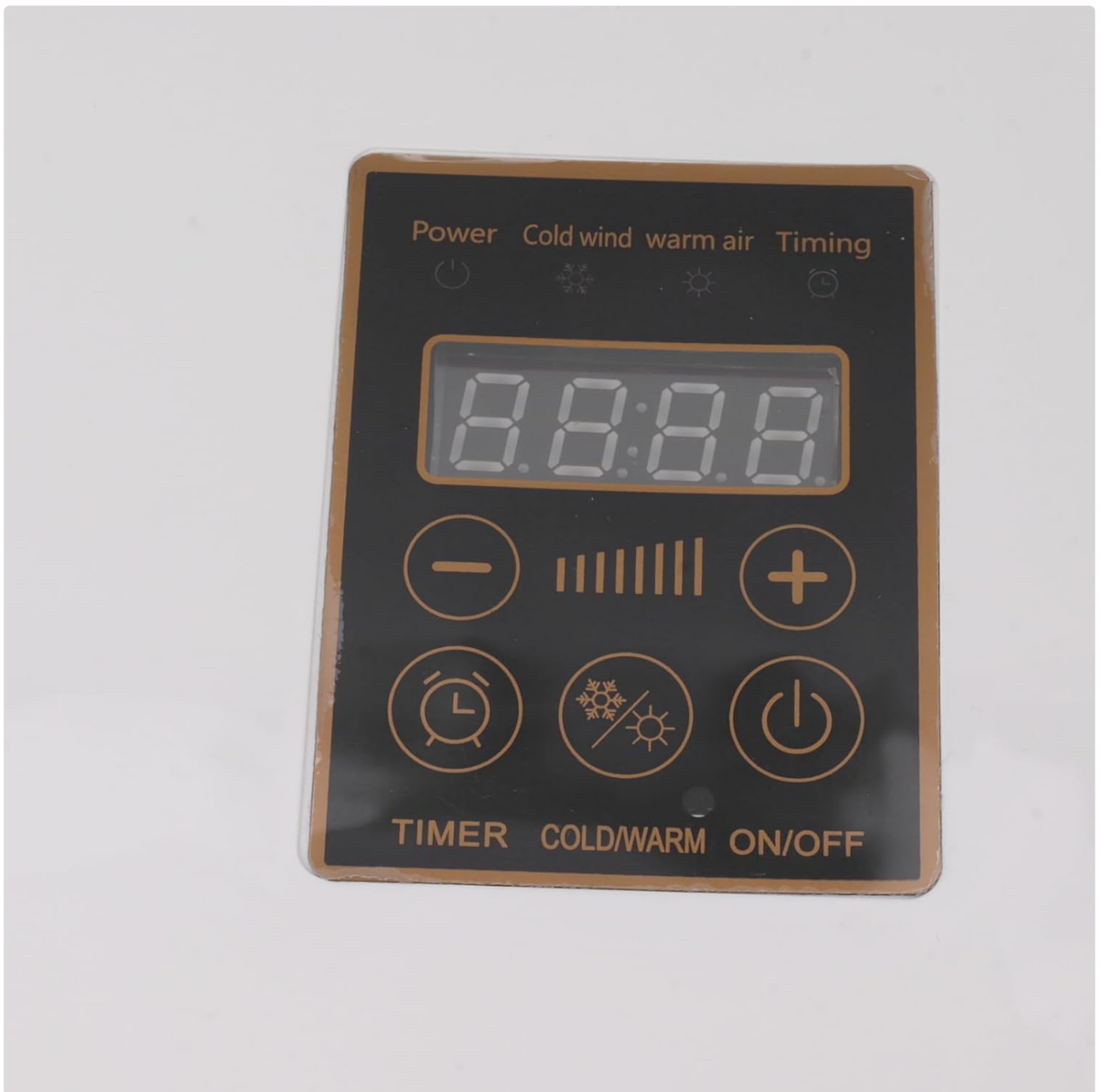
Image: Detailed view of the control panel with digital display and buttons for power, timer, and temperature/mode adjustment.