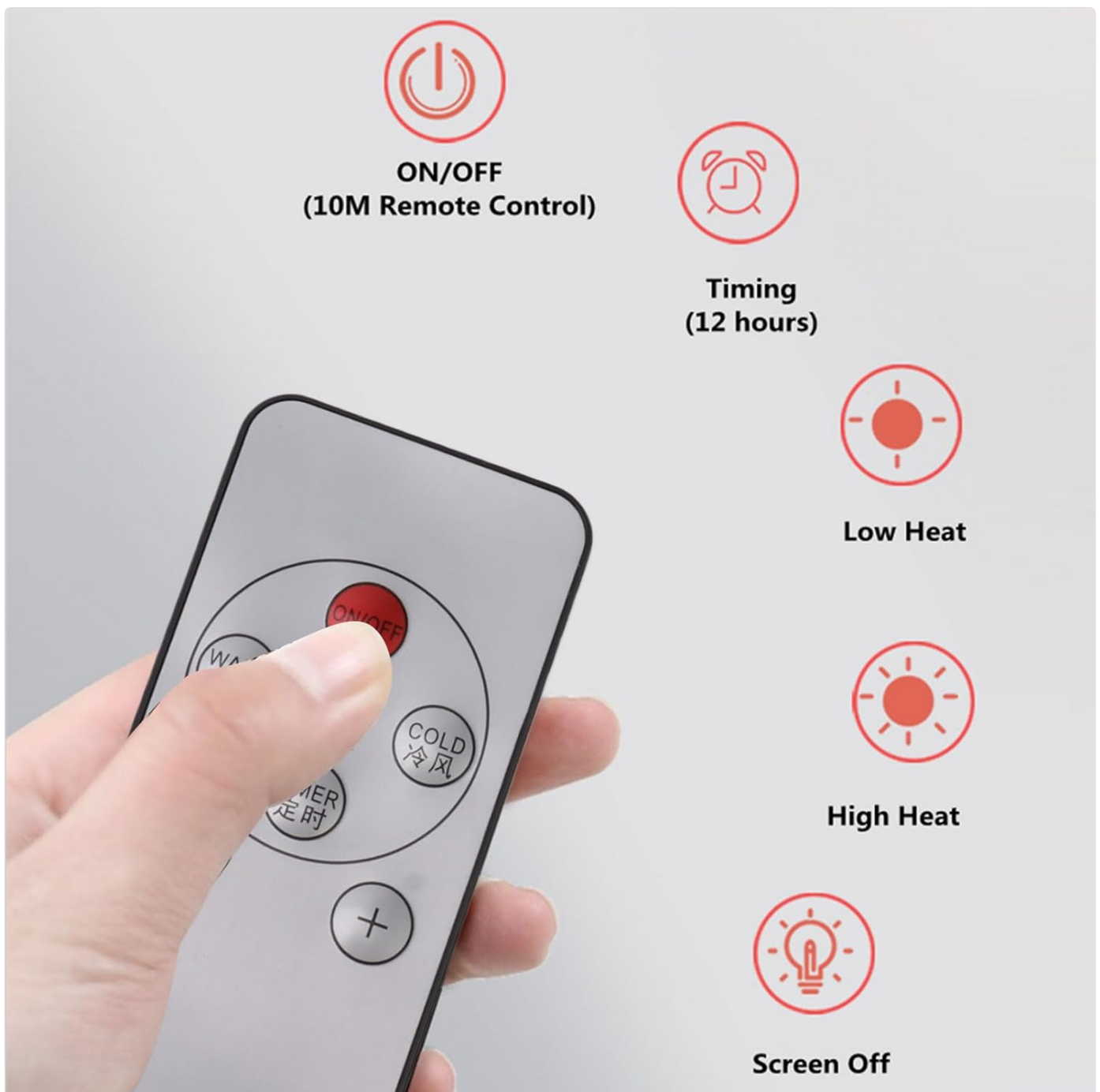
Image: The remote control, showing its various buttons and their corresponding functions, such as power, timer, and heat settings.