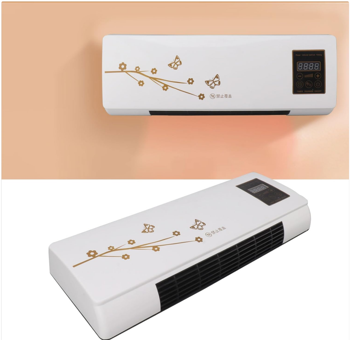
Image: The heating machine mounted on a wall, demonstrating its intended installation, and also shown resting on a surface, indicating its compact design.