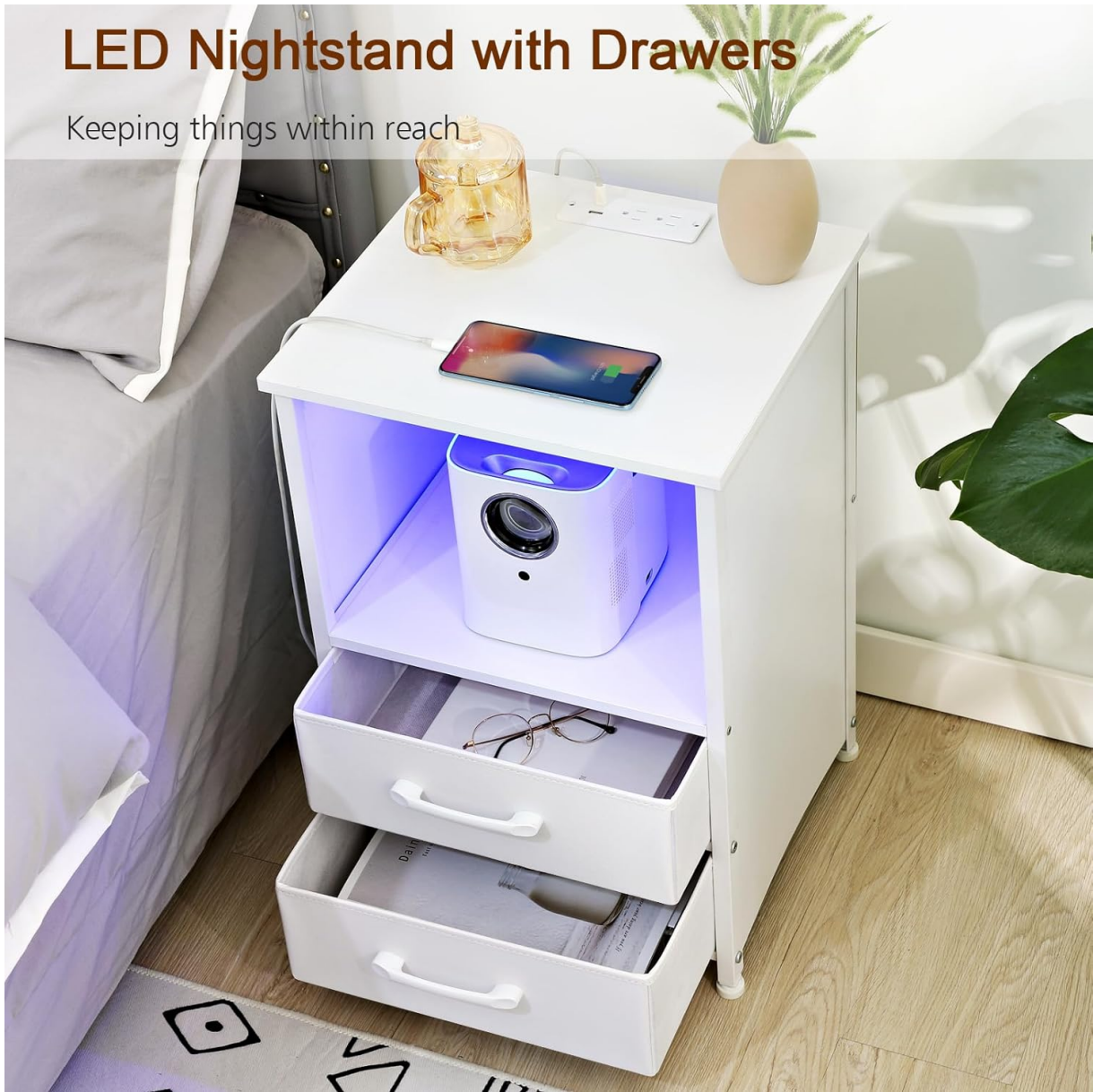
Image 5.1: Visual representation of LED light features and controls.