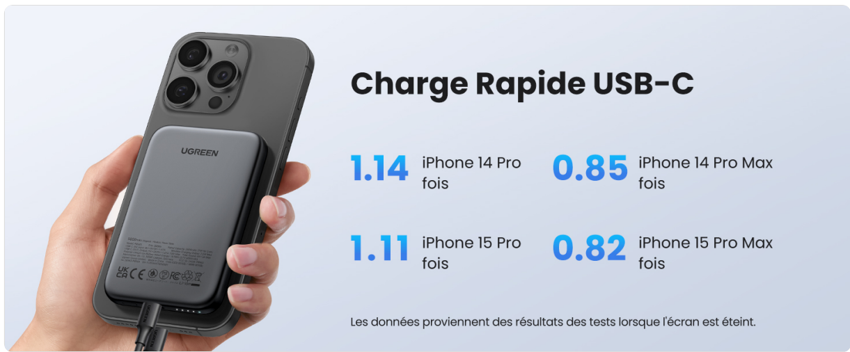
Image: Chart detailing wired USB-C fast charging performance for various iPhone models (iPhone 14 Pro, 14 Pro Max, 15 Pro, 15 Pro Max) with the UGREEN Nexode Mini Power Bank. Data is based on tests with the screen off.