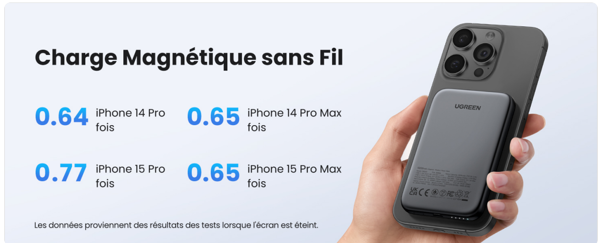
Image: Chart detailing wireless magnetic charging performance for various iPhone models (iPhone 14 Pro, 14 Pro Max, 15 Pro, 15 Pro Max) with the UGREEN Nexode Mini Power Bank. Data is based on tests with the screen off.

Image: Illustration showing the UGREEN Nexode Mini Power Bank's magnetic charging compatibility with MagSafe cases and incompatibility with non-magnetic cases. Ensure your device or case supports MagSafe for optimal magnetic attachment and charging.