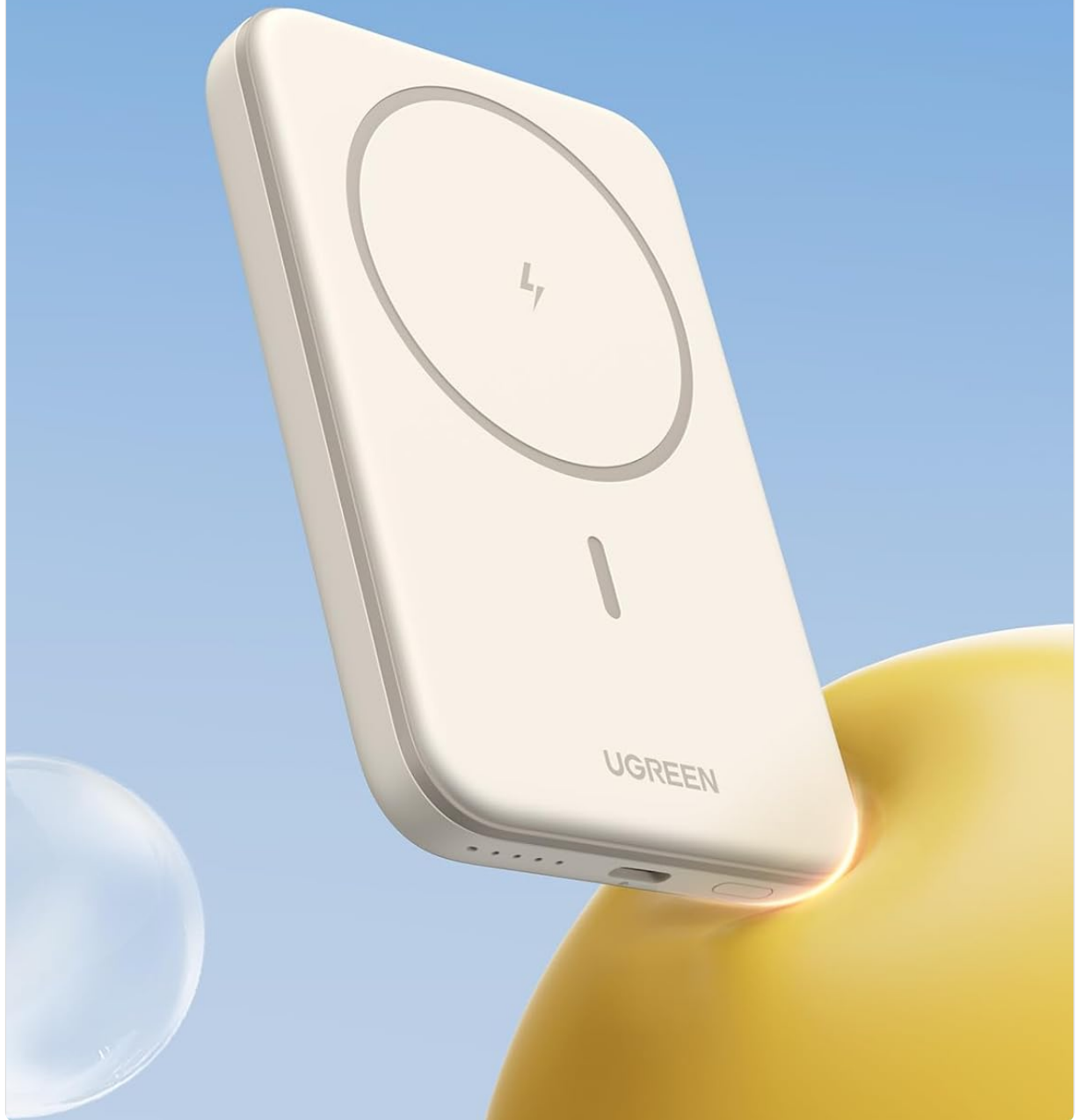
Image: UGREEN Nexode Mini Power Bank showing its non-slip silicone surface for secure attachment and comfortable handling.