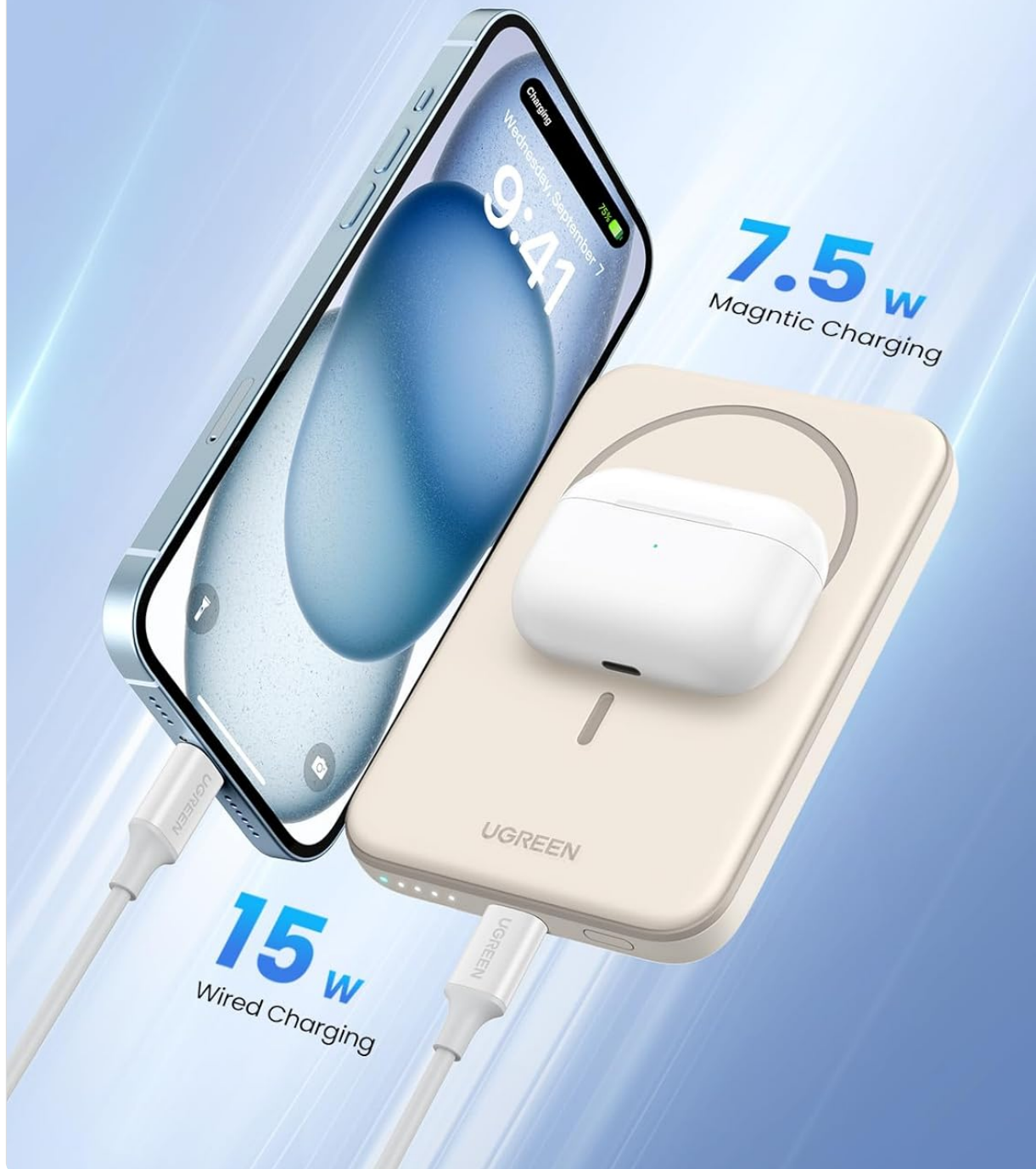
Image: UGREEN Nexode Mini Power Bank simultaneously charging an iPhone wirelessly (7.5W) and an AirPods case via wired USB-C (15W).