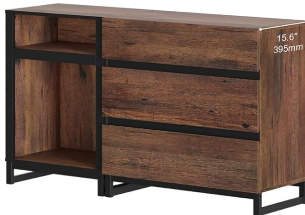
Image: Detailed diagram illustrating the dimensions of the individual components of the TV stand, including the open shelving unit and the three-drawer cabinet. This helps in identifying parts and understanding the overall structure.