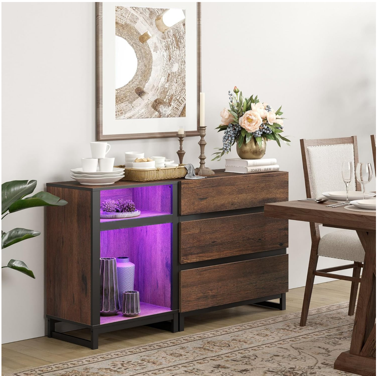
Image: The WAMPAT TV Stand positioned in a dining room, featuring the purple LED lighting in the open shelf area, demonstrating its versatility in different home environments.