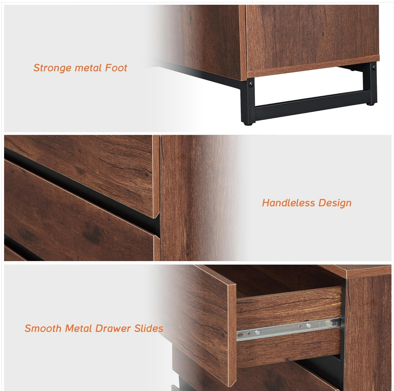
Image: Close-up details of the TV stand, highlighting the sturdy metal feet, the sleek handleless design of the drawers, and the smooth operation of