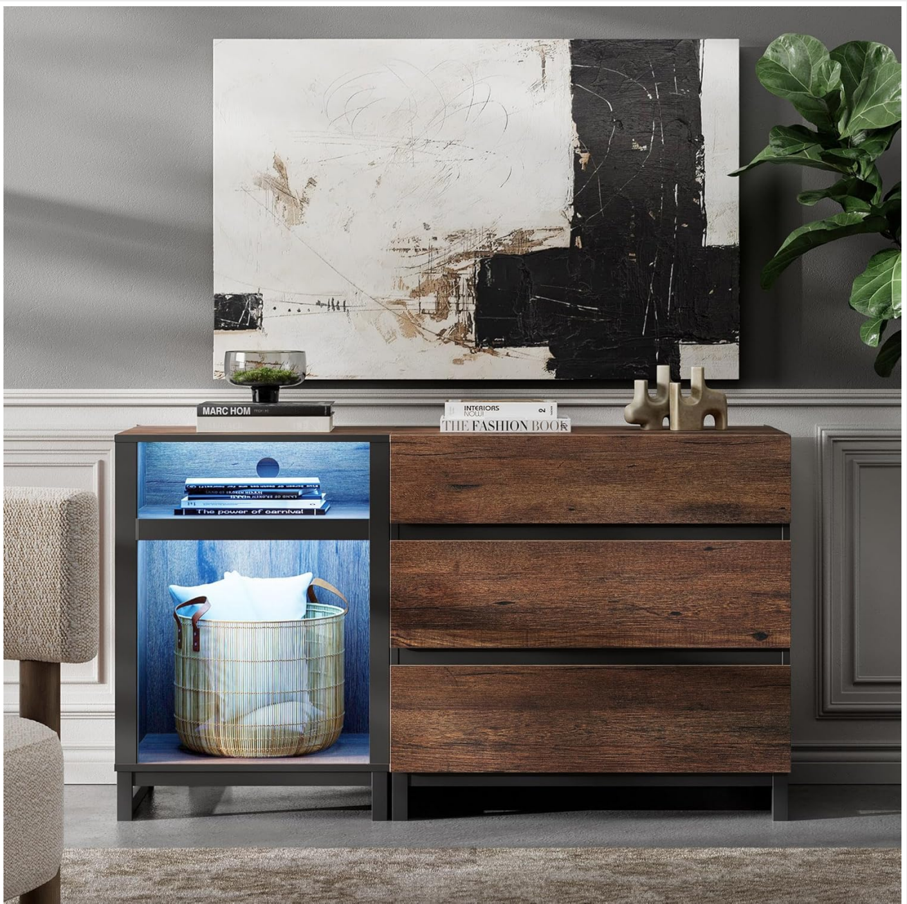
Image: The WAMPAT TV Stand displayed in a modern living room, showcasing the blue LED lighting within the open shelf, providing ambient illumination.