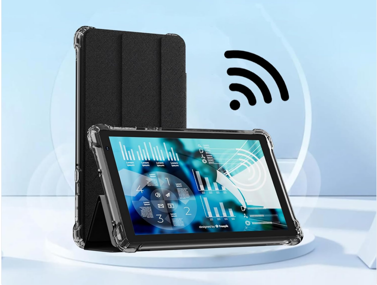
Image: The tablet positioned next to a Wi-Fi signal icon, illustrating its 5G and Wi-Fi 6 wireless capabilities for efficient internet access.

Fast 5G + WiFi 6 and efficient Wireless 5.0 wireless connectivity for uninterrupted access to the web and entertainment