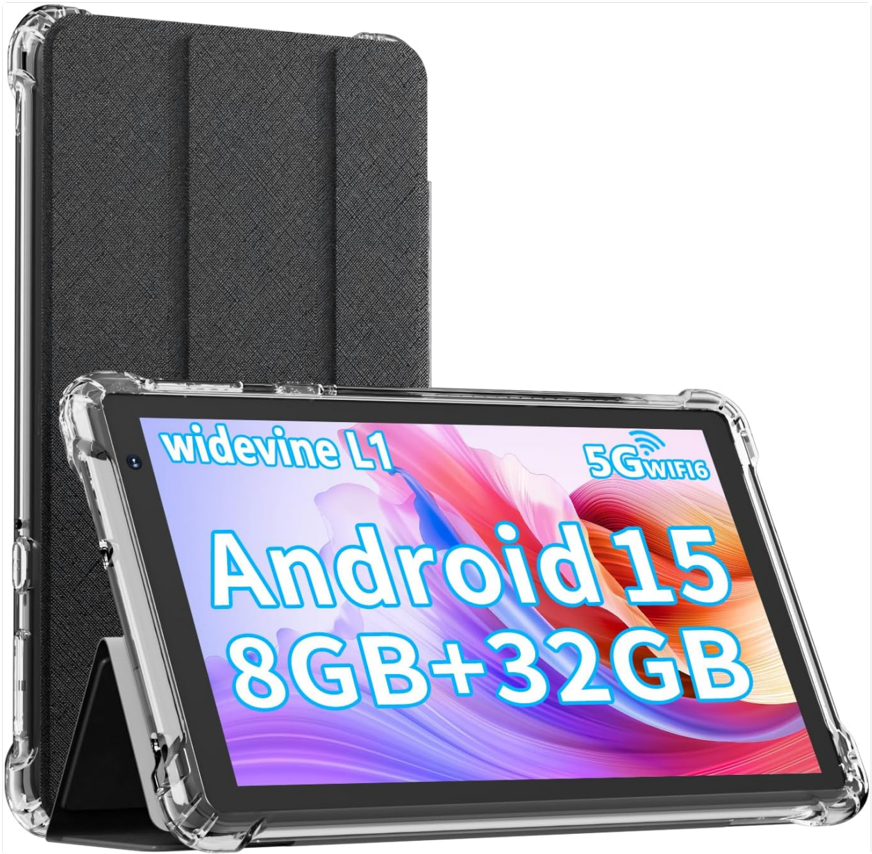
Image: The Iweggo Q2S Pro tablet shown with its protective case. The tablet screen displays "Android 15 8GB+32GB".