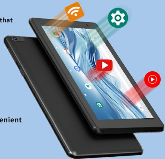
Image: A tablet screen illustrating key Android 15 features such as improved privacy and security management, a convenient taskbar for multitasking, parental controls, and an upgraded user interface design.