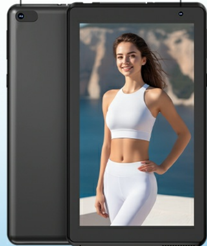
Image: A collage of images showing people enjoying various activities, demonstrating the tablet's ability to capture moments with its cameras.