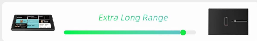
Image: A visual representation of the tablet's 3000mAh battery capacity, indicating extended usage time.