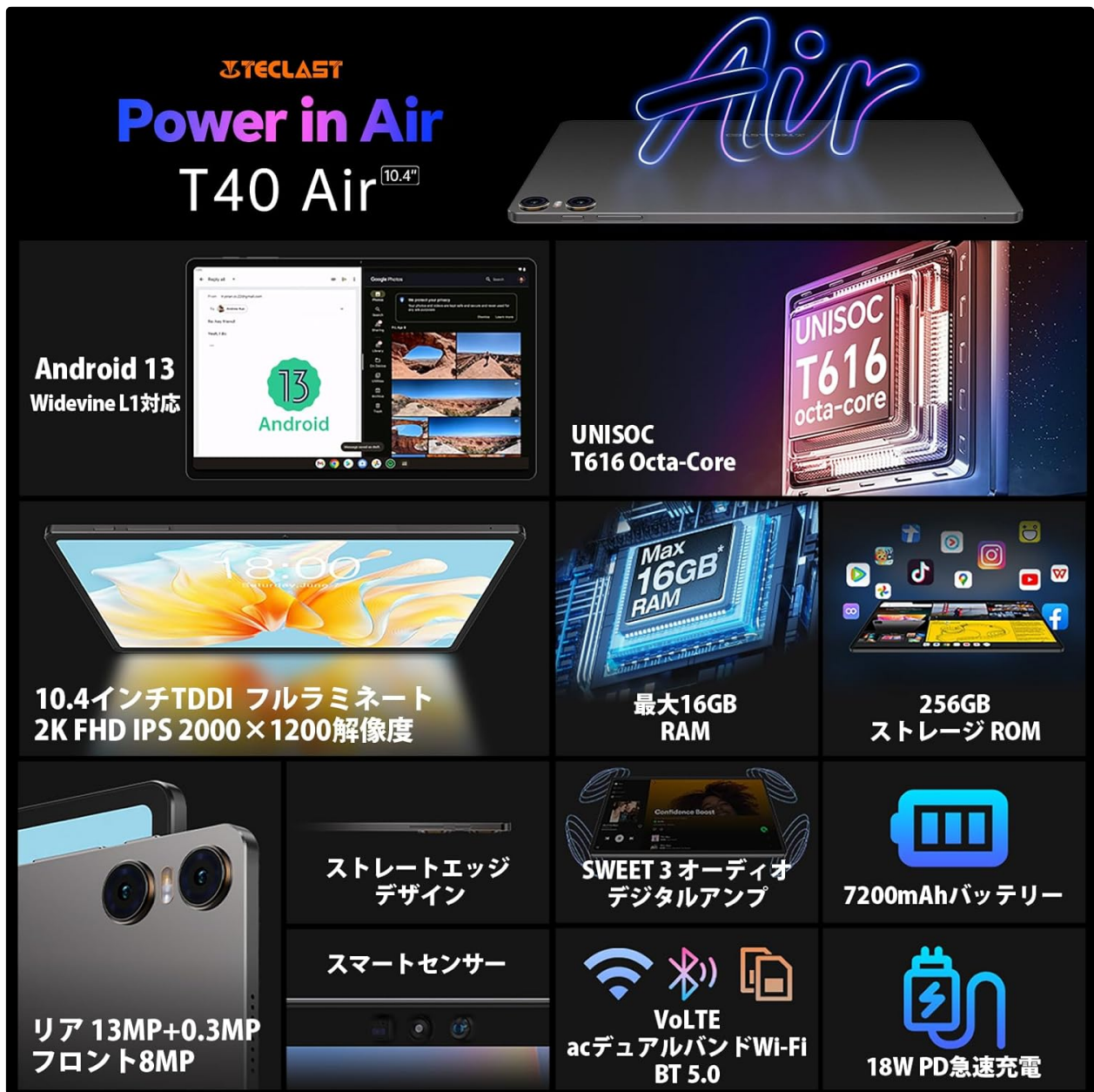
Image 1.1: Front and back view of the TECLAST T40Air Tablet, showcasing its sleek design and dual rear cameras.

Your browser does not support the video tag.