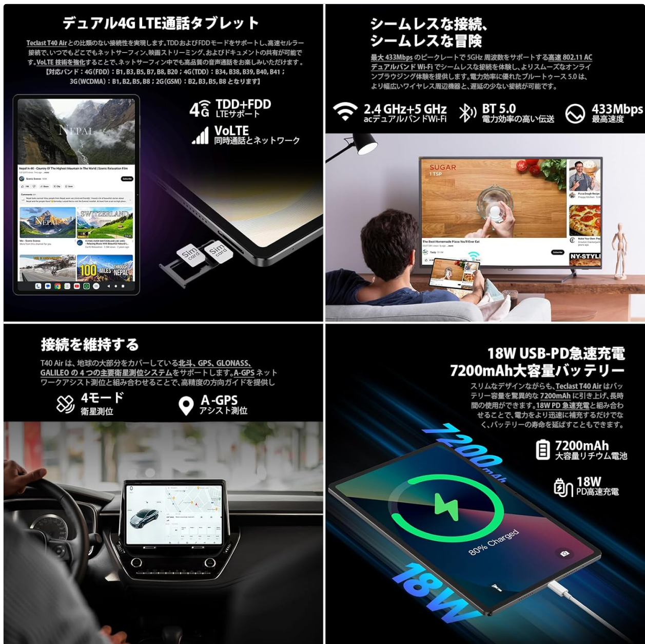
Image 2.1: The TECLAST T40Air Tablet highlighting its 4G LTE support and SIM card tray location.