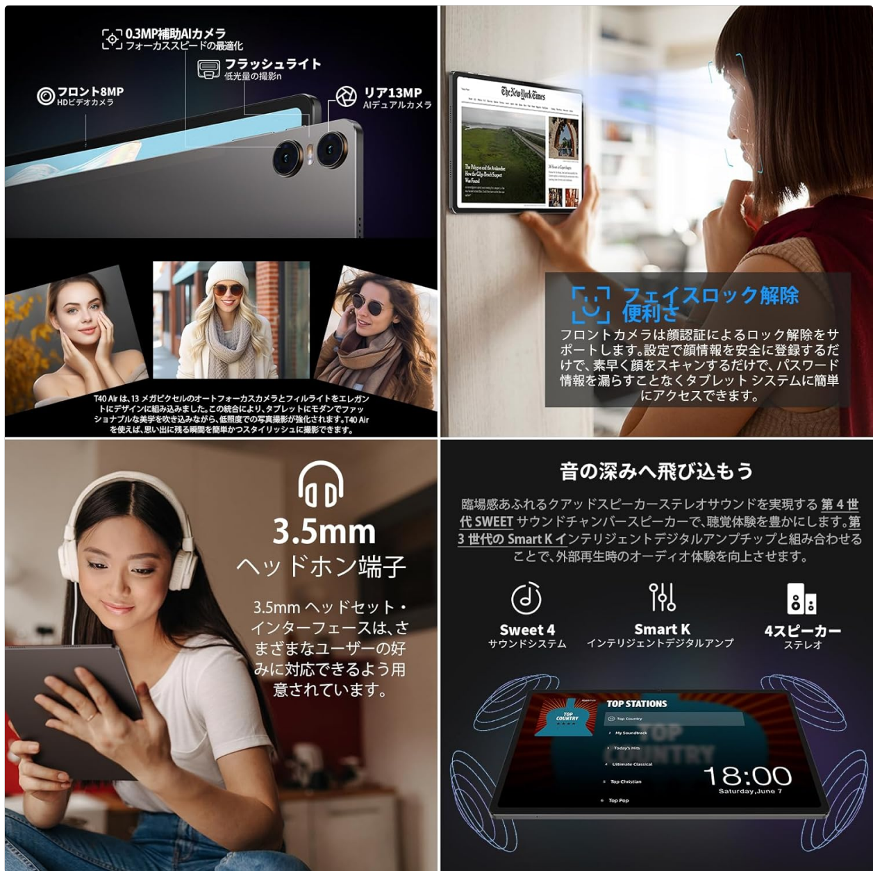
Image 3.3: The TECLAST T40Air Tablet showcasing its camera capabilities and 3.5mm headphone jack.