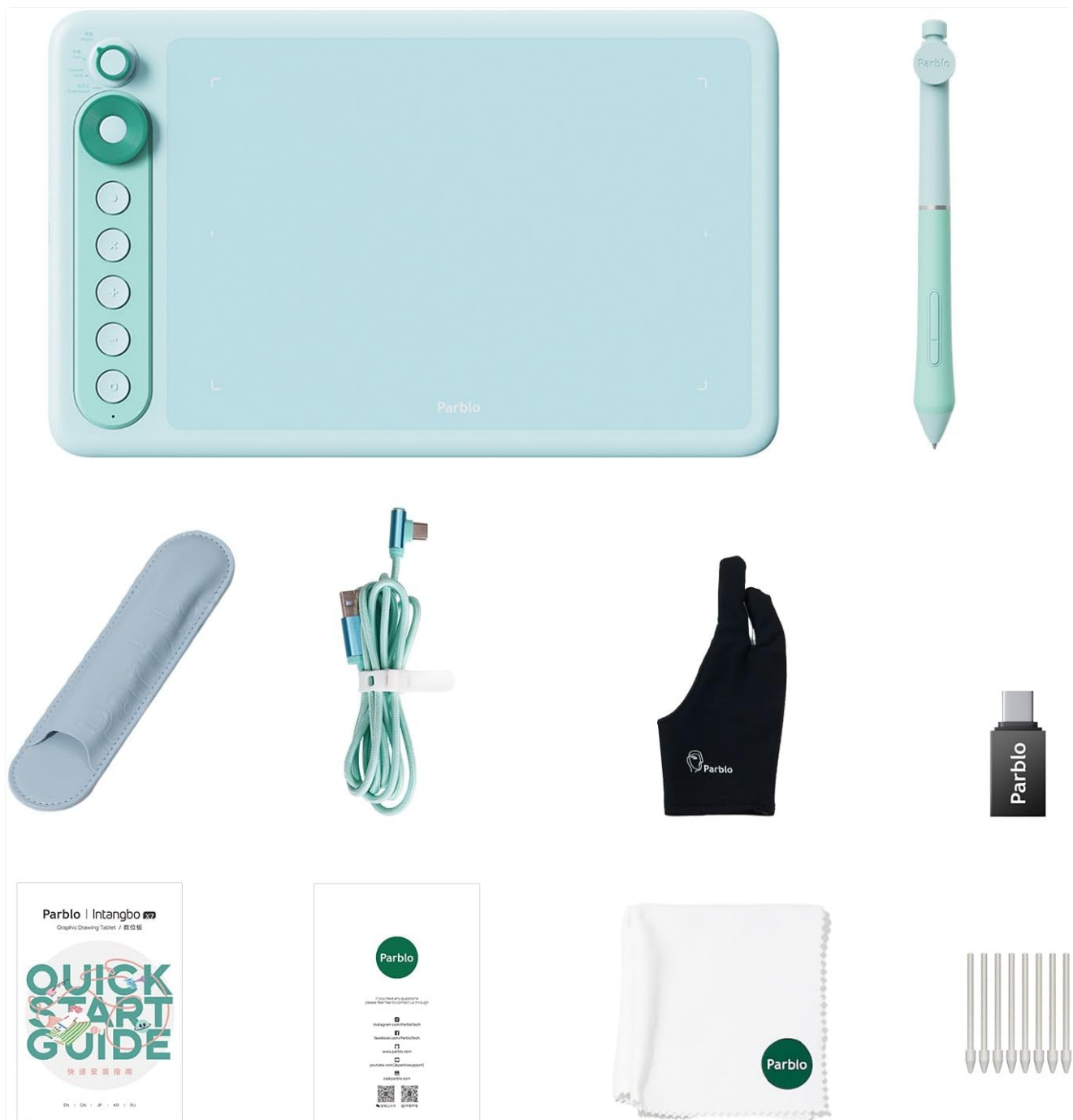
Image: All items included in the Parblo Intangbo X7 package, neatly arranged.