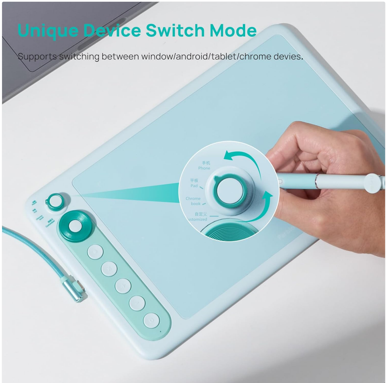
Image: Close-up of the tablet's mode switch knob, indicating options for Phone, Pad, Chromebook, and Customized modes.

Supports switching between window/android/tablet/chrome devies.