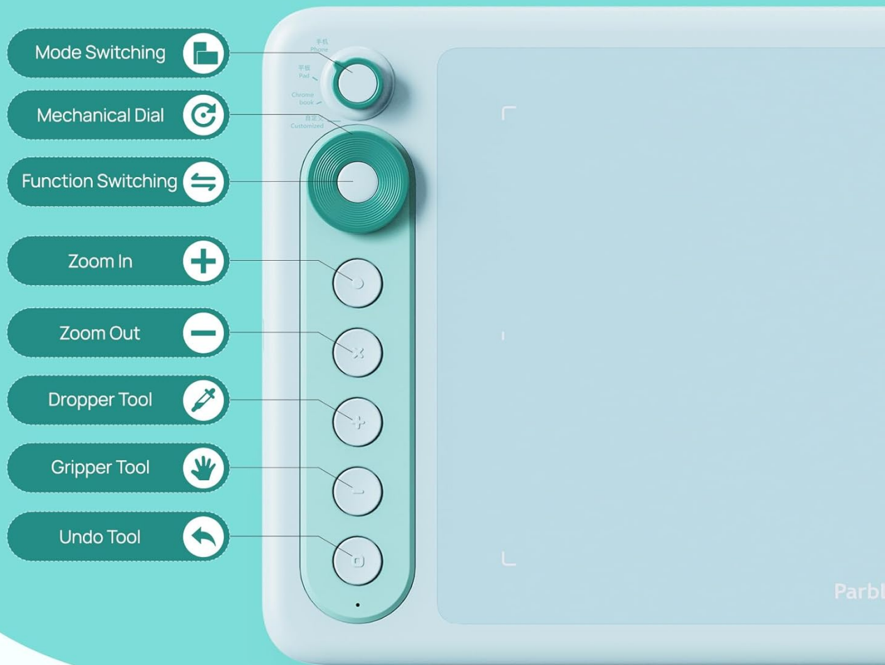
Image: The Parblo Intangbo X7 tablet highlighting its 6 customizable shortcut keys and mechanical dial, with labels for common functions like Zoom, Undo, and tool selection.