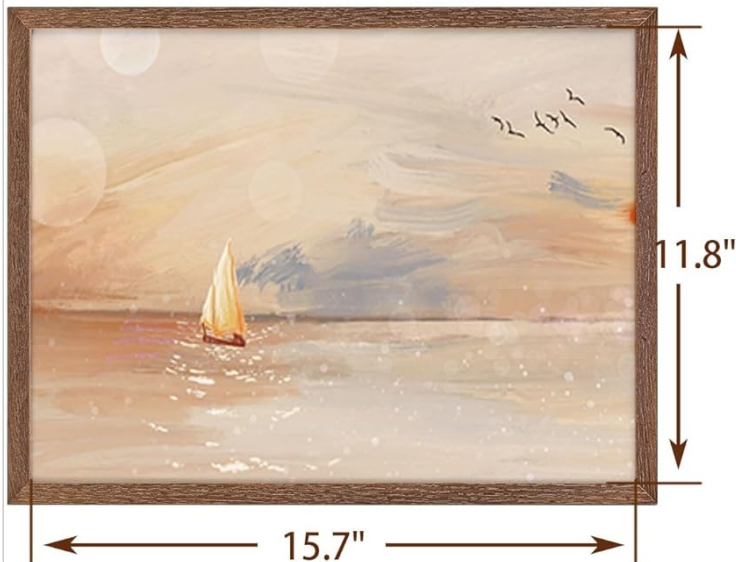
Display Size: 11.8"x15.7"