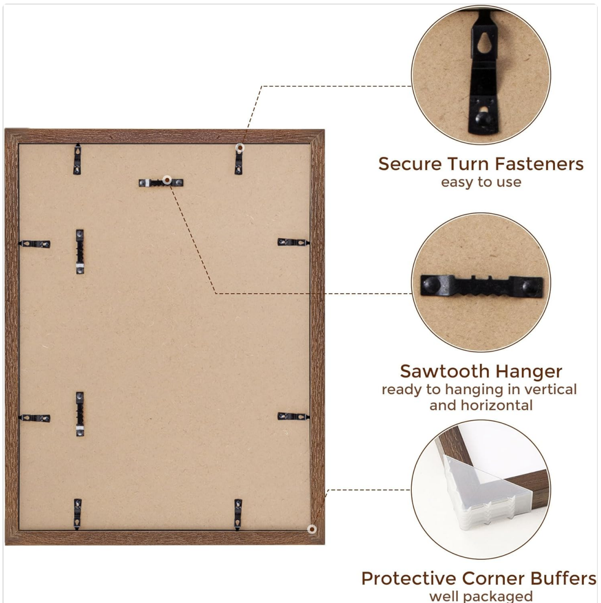
Image 3.1: Detailed view of the back of the frame, showing the secure turn fasteners and the sawtooth hanger for easy installation.