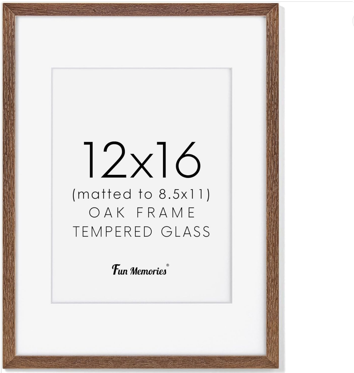
Image 1.1: The Fun Memories 12x16 Walnut Solid Oak Wood Picture Frame, showcasing its design and included mat.