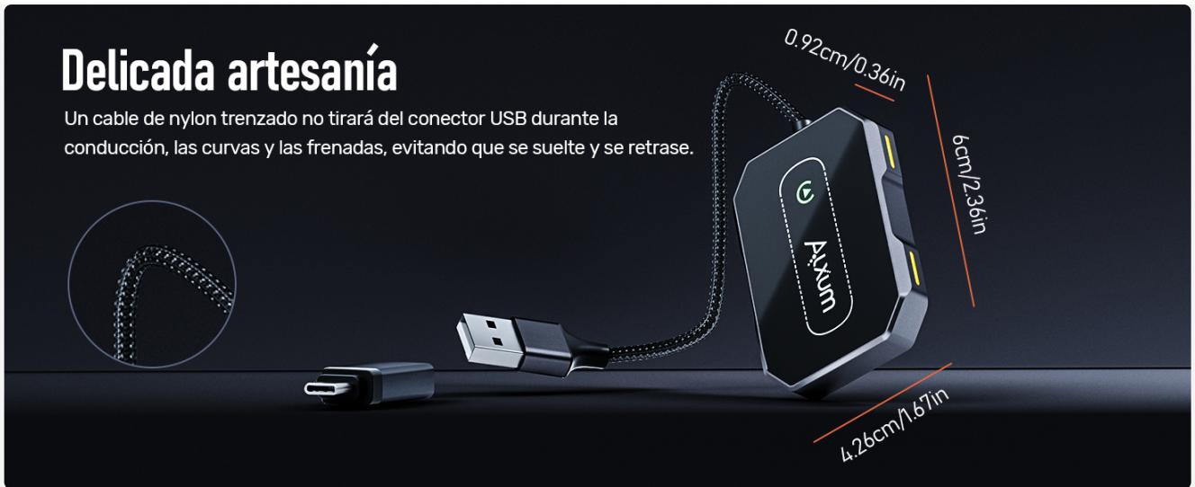
Image: Detailed view of the adapter's design and dimensions, highlighting its braided cable.

Un cable de nylon trenzado no tirará del conector USB durante la conducción, las curvas y las frenadas, evitando que se suelte y se retrase.