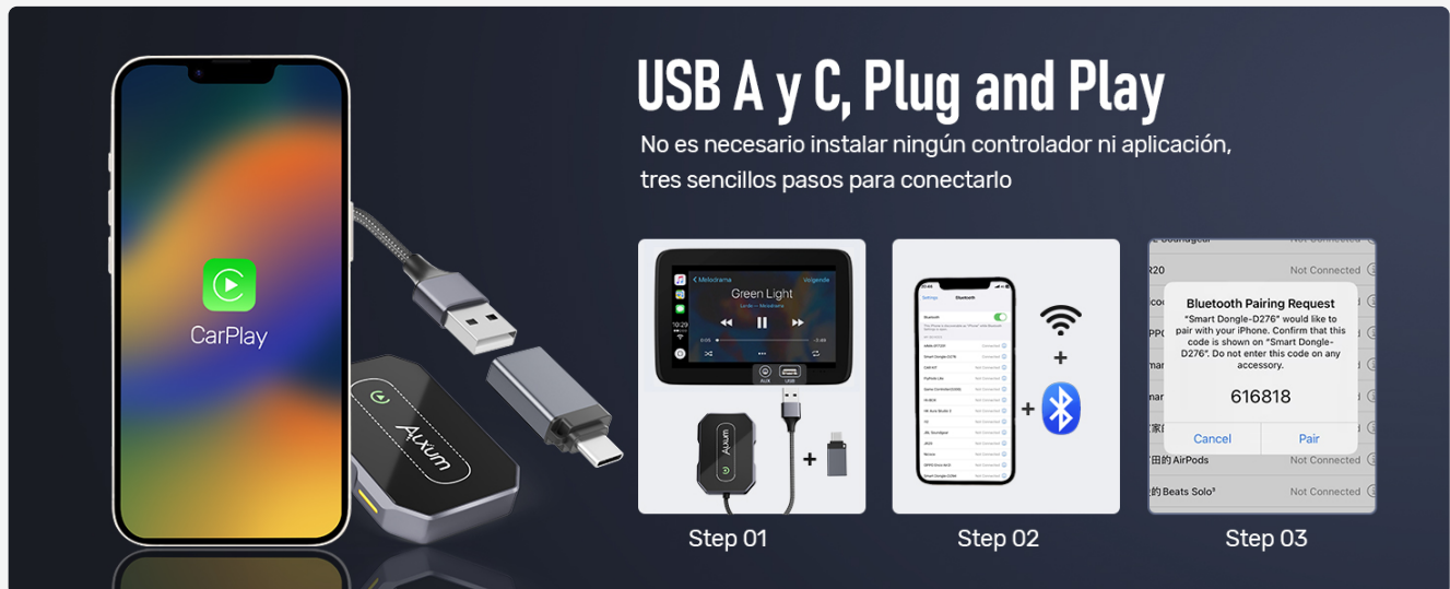
Image: Visual guide for the three-step setup process, including USB connection and Bluetooth pairing.

After the initial setup, the adapter will automatically connect to your iPhone and activate wireless CarPlay each time you start your car.