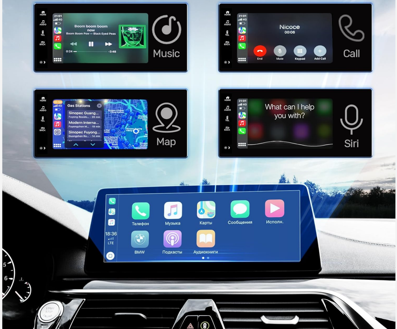
Image: CarPlay interface displaying multiple supported applications such as music, calls, maps, and Siri.