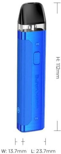
Image: An overview of the GEEKVAPE AQ (Aegis Q) Pod Kit's key features, including top fill, tri-proof protection, precise adjustments, built-in battery, 20W max output, dual activation, and MTL/RDL compatibility.