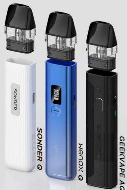
Image: Close-up view highlighting the tri-proof protection and durable design of the GEEKVAPE AQ (Aegis Q) Pod Kit, featuring robust metal and smooth leather textures.