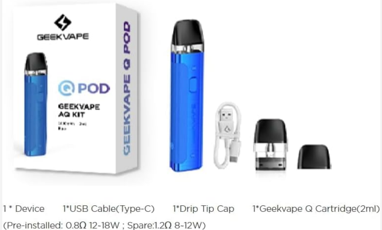
Image: Illustration of the GEEKVAPE AQ (Aegis Q) Pod Kit's durable built-in 1000mAh battery and its stable output, indicating charging via USB-C port.