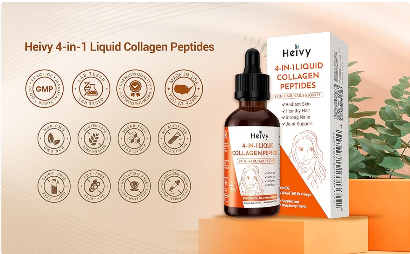
Image: Product packaging highlighting quality certifications and features.