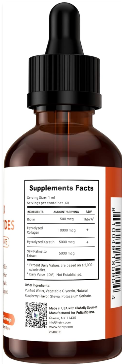
Image: Product back label with detailed storage and usage instructions.