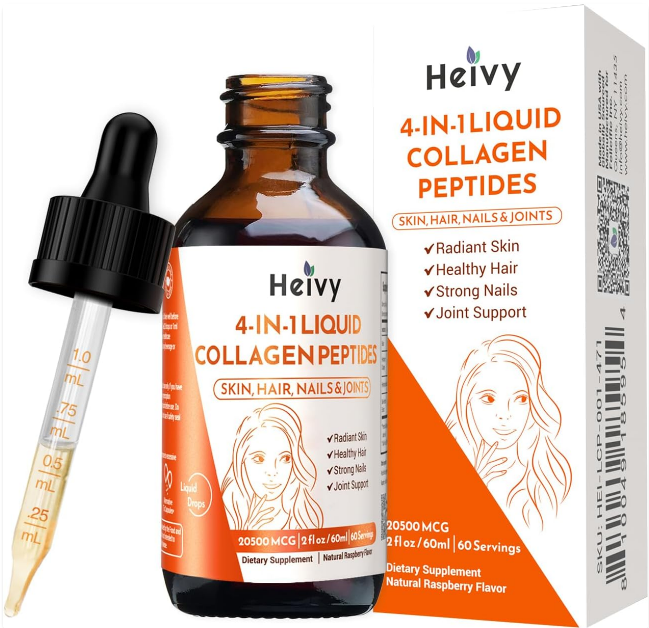
Image: Heivy 4-in-1 Liquid Collagen Peptides bottle with dropper and product box.