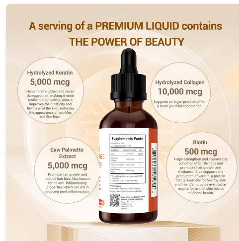
Image: Supplement Facts label detailing serving size, servings per container, and ingredient amounts.

Other Ingredients: Purified Water, Vegetable Glycerin, Natural Raspberry Flavor, Stevia, Potassium Sorbate.