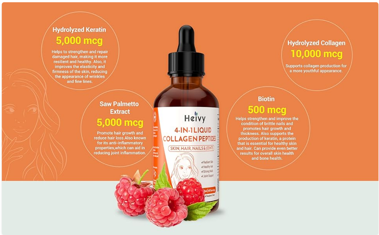
Image: Detailed information on the key active ingredients and their benefits.