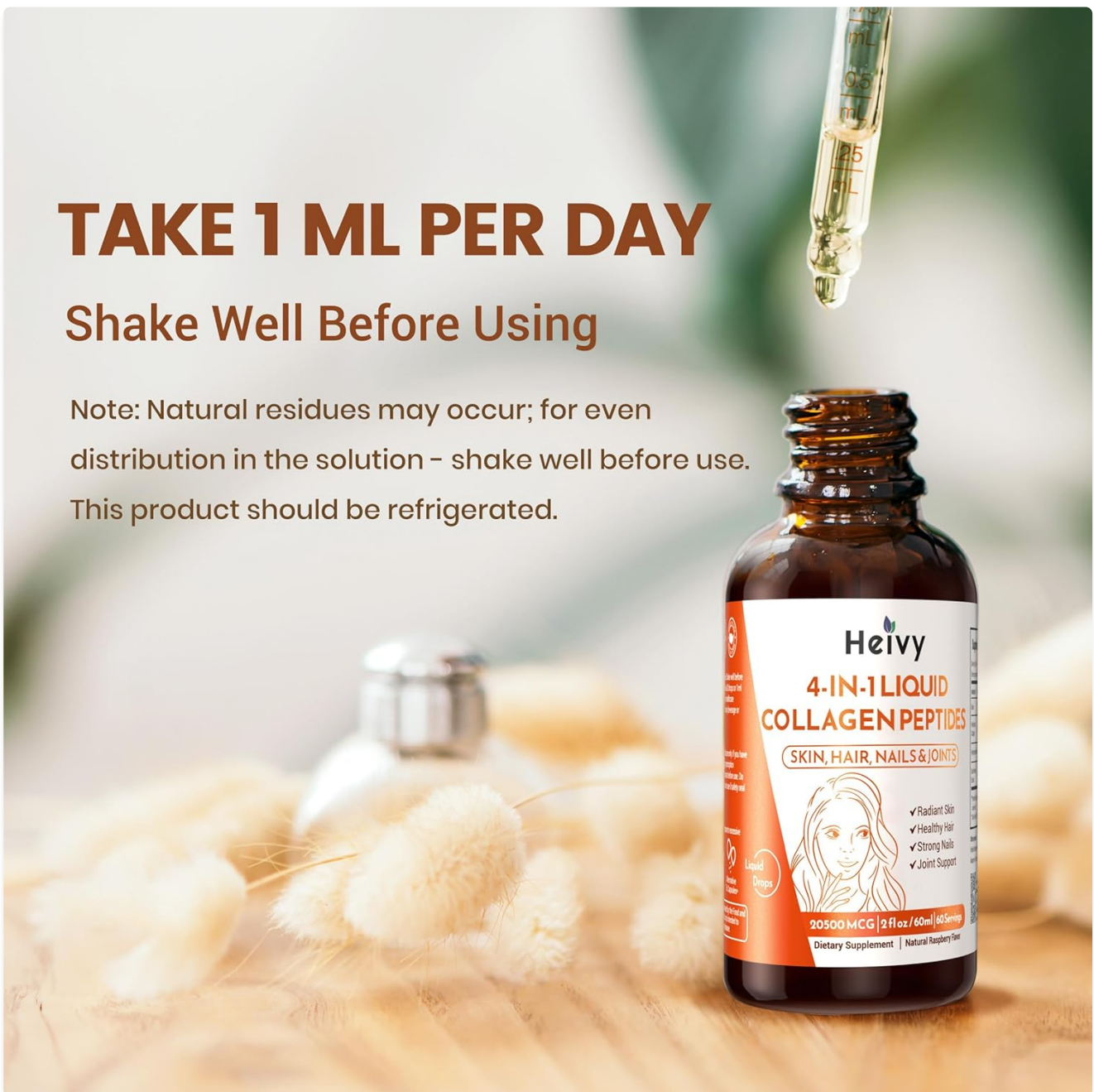
Image: Visual guide for taking 1 mL of the liquid collagen daily.

Note: Natural residues may occur; for even distribution in the solution - shake well before use. This product should be refrigerated.