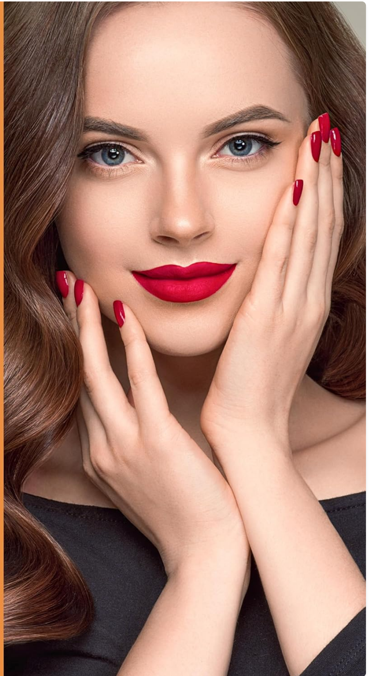
Image: Visual representation of the four primary benefits of the liquid collagen peptides.