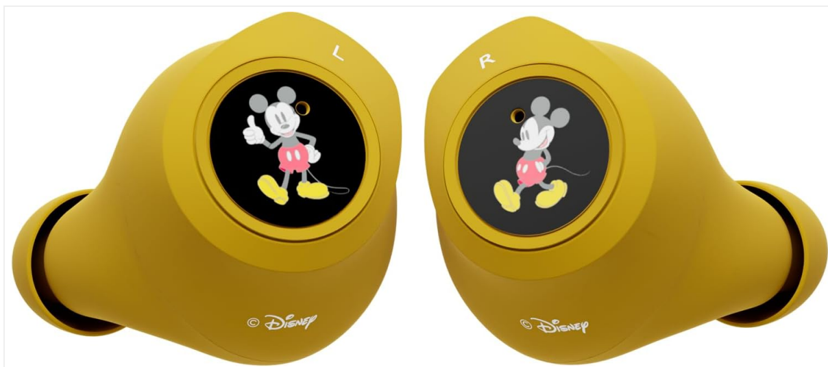
Image: The iJoy Disney Mickey Mouse Bluetooth Earbuds resting inside their open charging case.

The iJoy Disney Mickey Mouse Bluetooth Earbuds are designed for wireless audio playback and hands-free calling. They feature a compact design and come with a charging case for extended use.