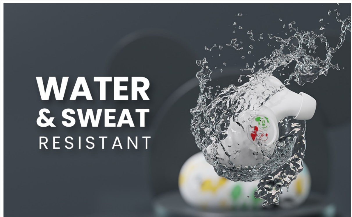
Image: An earbud being splashed with water, demonstrating its water and sweat resistant properties.

The earbuds are water and sweat resistant, making them suitable for various activities.