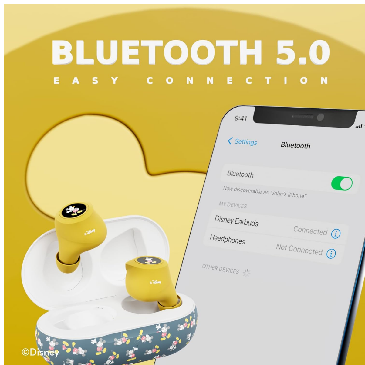
Image: A smartphone screen displaying Bluetooth settings, showing 'Disney Earbuds' as a connected device, illustrating the pairing process.