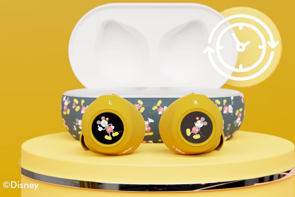
Image: The earbuds and charging case displayed with text indicating '30 Hours of Playtime', highlighting the extended battery life.