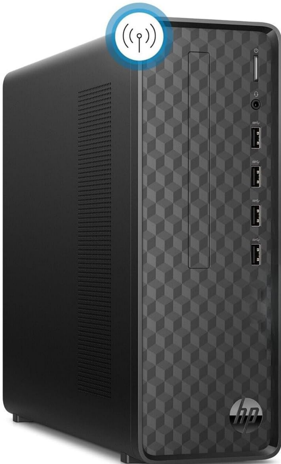
Figure 2: HP Slim Desktop highlighting wireless connectivity. This image illustrates the desktop's capability to connect to Wi-Fi and Bluetooth accessories, emphasizing its wireless technology.

Stay connected to Wi-Fi and to Bluetooth® accessories with wireless technology