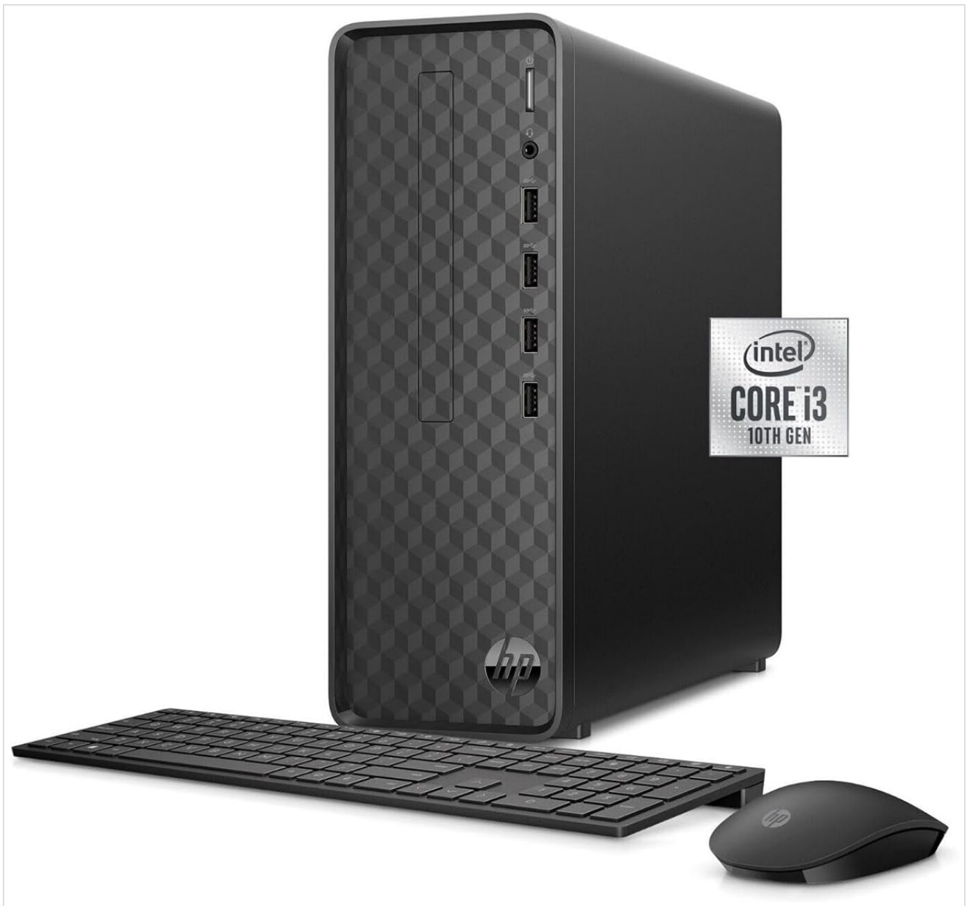
Figure 1: HP Slim Desktop with included wireless keyboard and mouse. This image shows the compact desktop tower alongside its wireless input devices, ready for connection to a monitor.