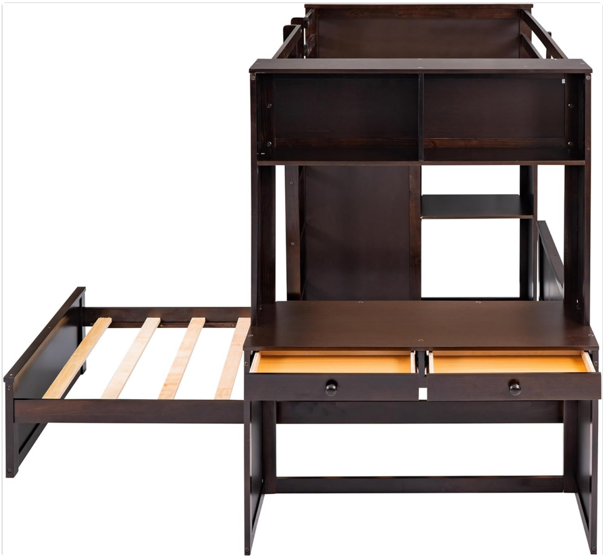
Figure 3: Close-up view of the integrated desk with two drawers and the adjacent storage shelves, designed for organization and study.