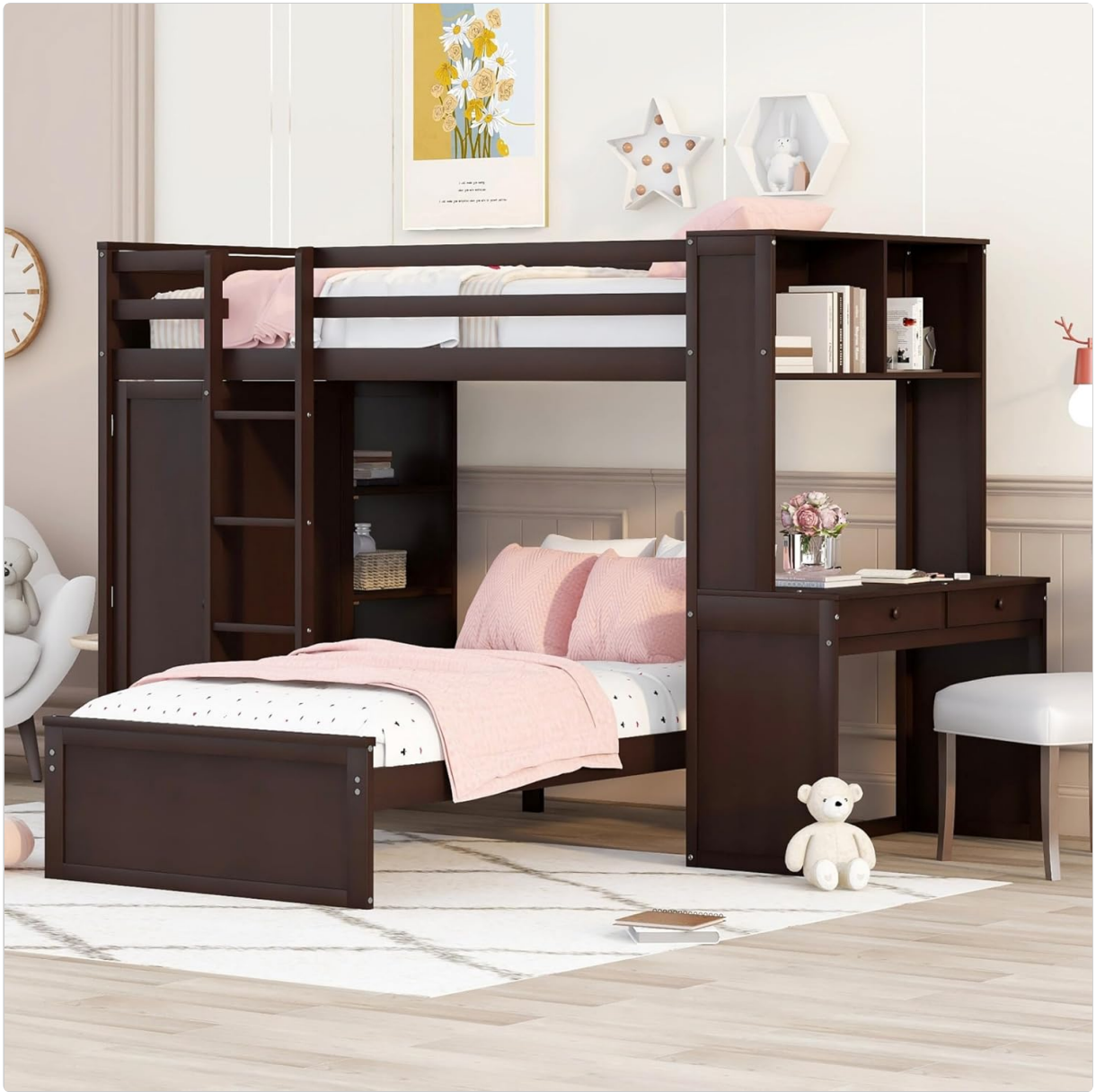
Figure 1: Fully assembled TRIPLE TREE Twin Size Loft Bed with Stand-Alone Bed in Espresso finish, showcasing the integrated desk, shelves, and wardrobe.