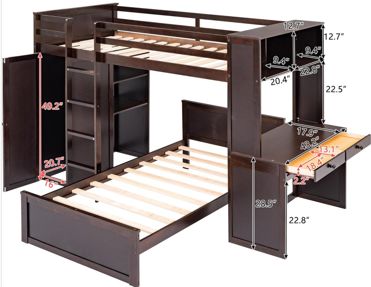
Figure 6: Internal dimension diagram, providing specific measurements for the wardrobe, shelves, desk, and bed frames.