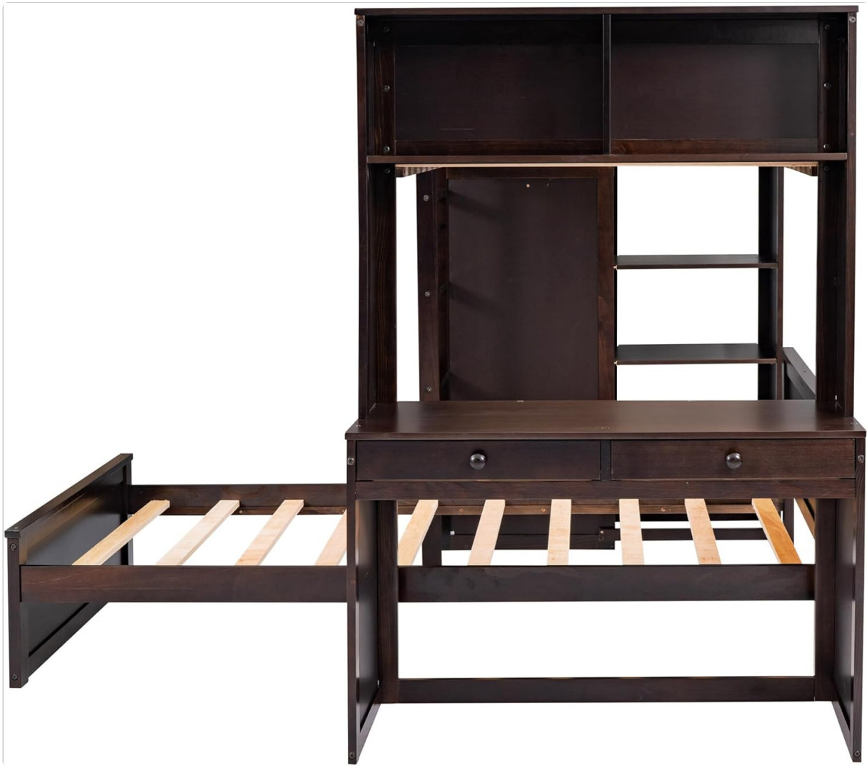
Figure 4: View showing the desk, shelves, and the stand-alone lower bed positioned away from the main loft structure, demonstrating its flexibility.