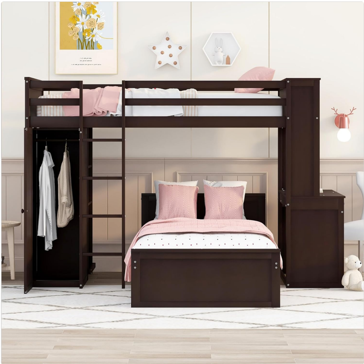
Figure 2: Front view of the loft bed with the wardrobe door open, revealing storage space. The stand-alone twin bed is positioned below.