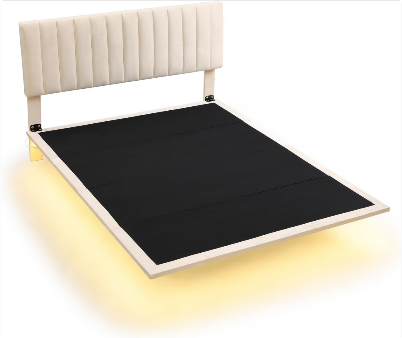
Image: The assembled bed frame, highlighting its floating design and integrated headboard.