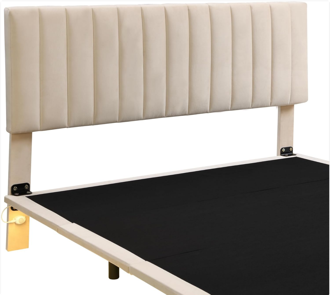
Image: Close-up view of the headboard with the LED light strip illuminated.