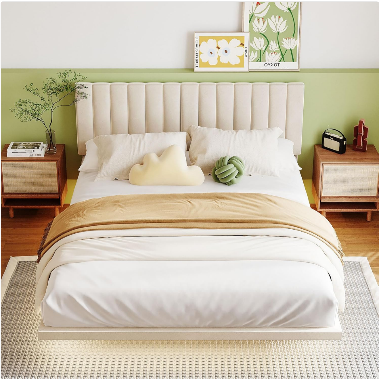
Image: The JIVOIT Queen Upholstered LED Bed Frame in a modern bedroom setting.