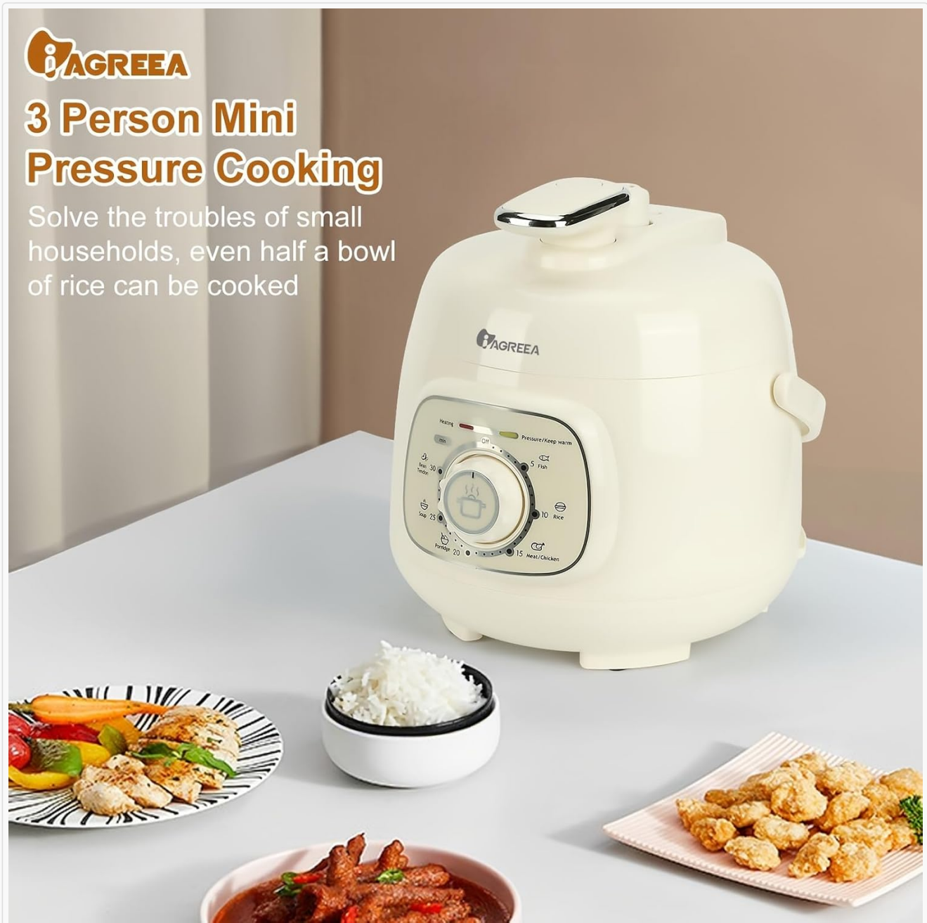
Figure 5.1: The IAGREEA Mini Electric Pressure Cooker in a kitchen setting.

The IAGREEA Mini Electric Pressure Cooker features a user-friendly control panel with 6 preset menu settings.