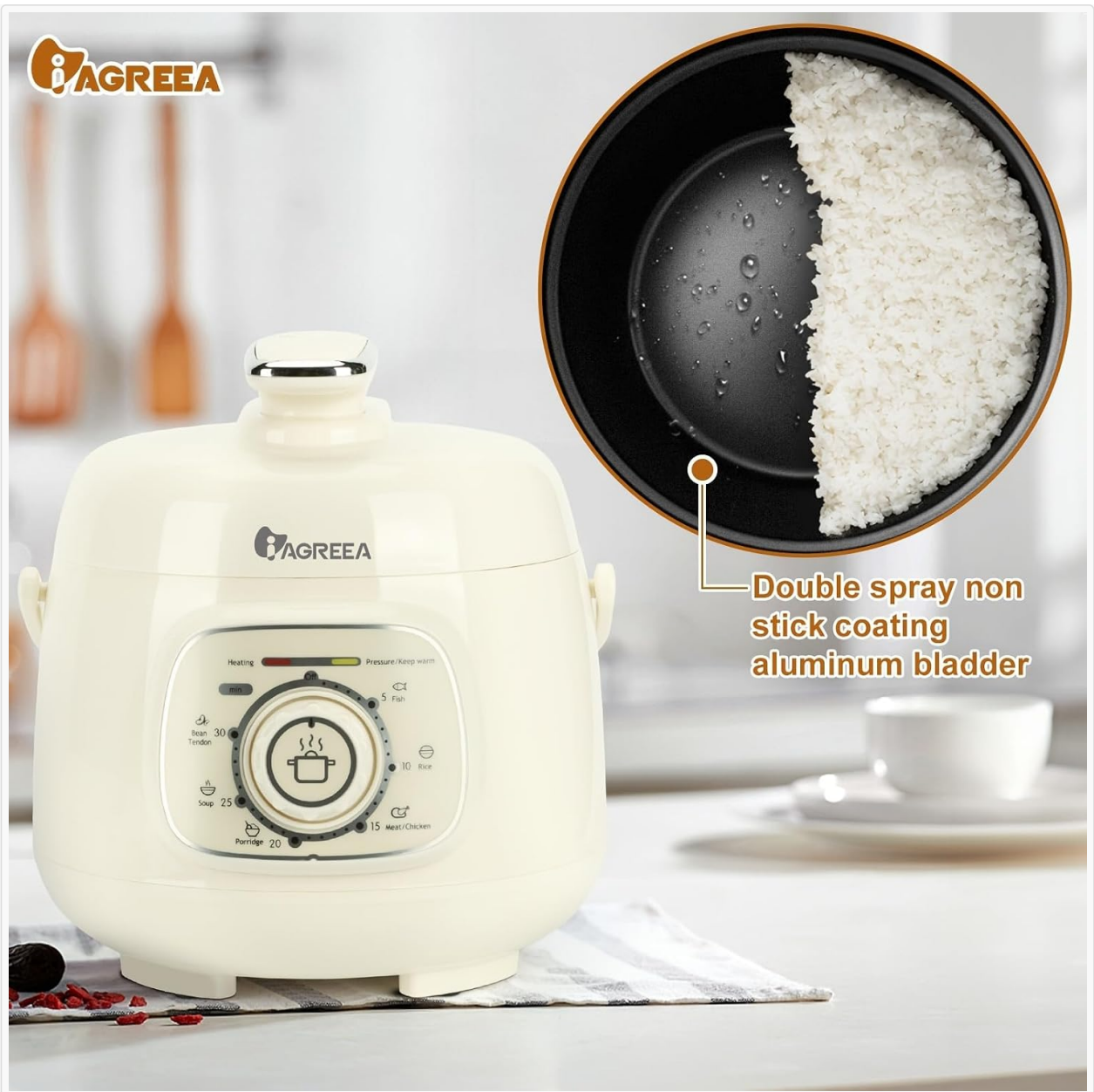
Figure 6.1: Illustration of the inner pot with double-spray non-stick coating.