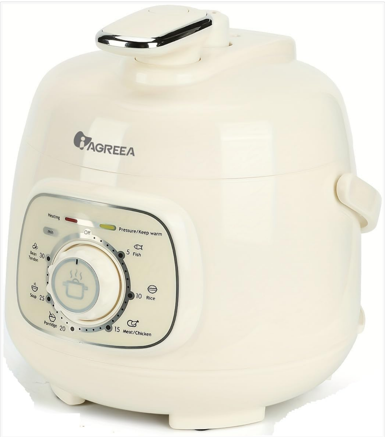
Figure 3.1: Front view of the IAGREEA Mini Electric Pressure Cooker, showing the control panel and lid.