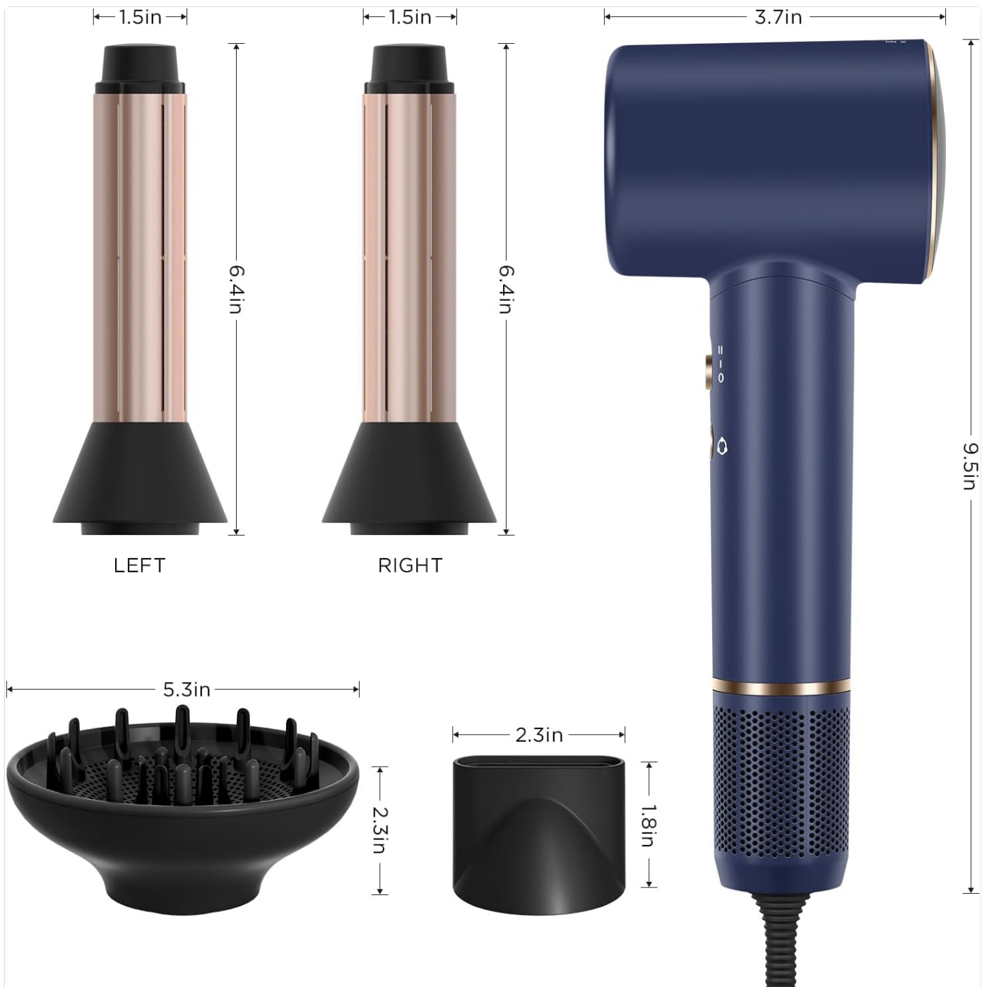
Image: A detailed diagram illustrating the dimensions of the hair dryer unit, the left and right auto-wrap curlers, the diffuser, and the smoothing nozzle.