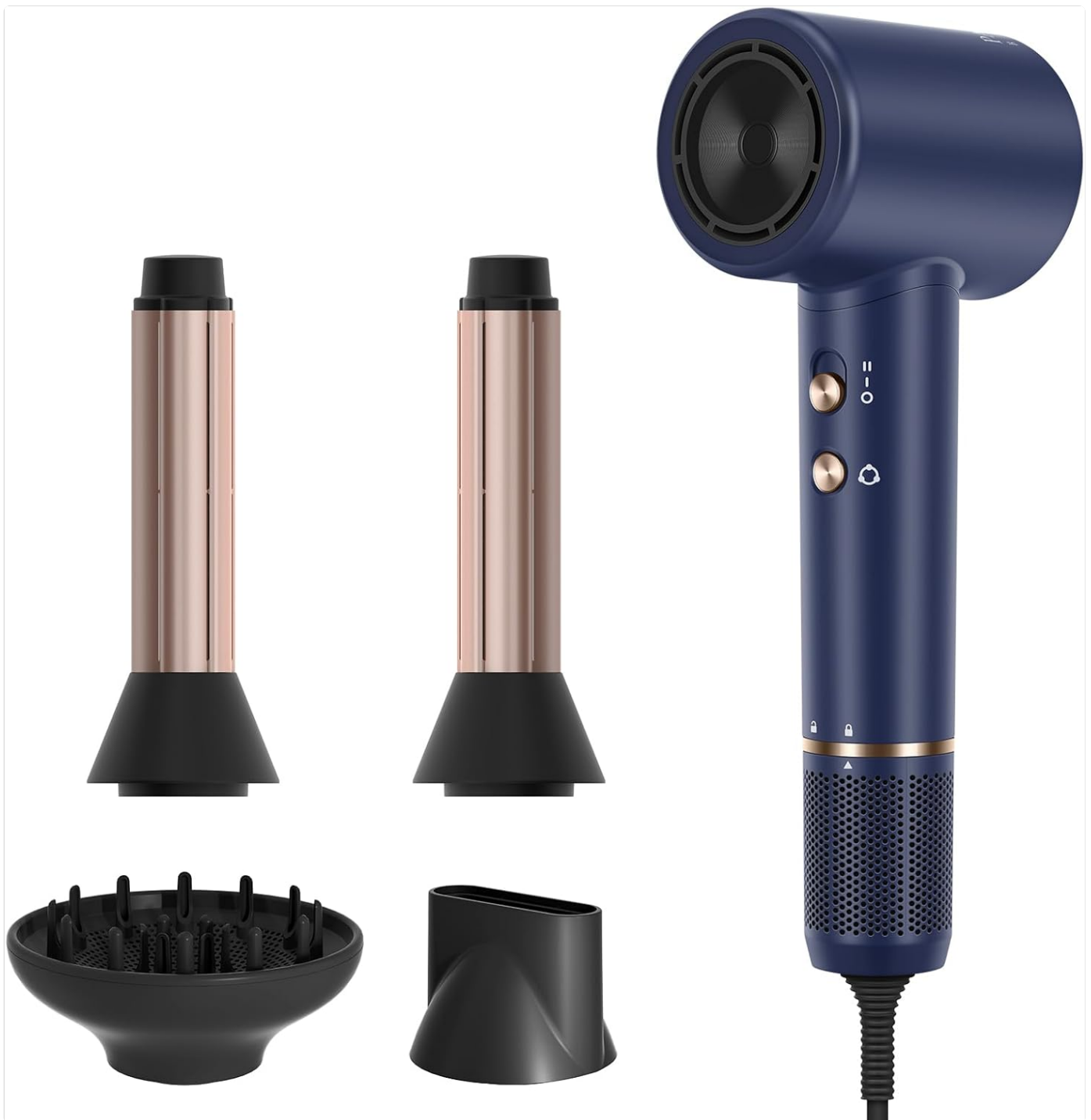
Image: The PARWIN PRO BEAUTY Air-Sonic Hair Dryer shown with its main body, two auto-wrap curlers, a smoothing nozzle, and a diffuser attachment.