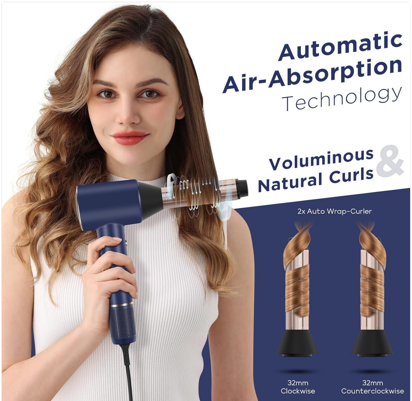
Image: Illustration of the Automatic Air-Absorption Technology with the auto-wrap curler, demonstrating how hair is drawn and wrapped to create voluminous, natural curls.

These attachments utilize the Coanda effect to automatically wrap hair around the barrel, creating curls without extreme heat. Use the left curler for clockwise curls and the right curler for anti-clockwise curls. For best results, use with the highest speed airflow and maximum temperature.