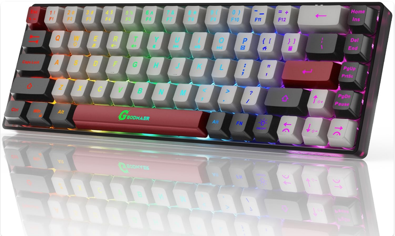
Figure 1: GEODMAER GM68 65% Wireless Gaming Keyboard. This image displays the compact 65% layout keyboard with RGB backlighting, featuring a mix of black, silver-gray, and red keycaps.

This manual provides detailed instructions for the setup, operation, maintenance, and troubleshooting of your GEODMAER GM68 65% Wireless Gaming Keyboard. Please read this manual thoroughly before using the product to ensure optimal performance and longevity.