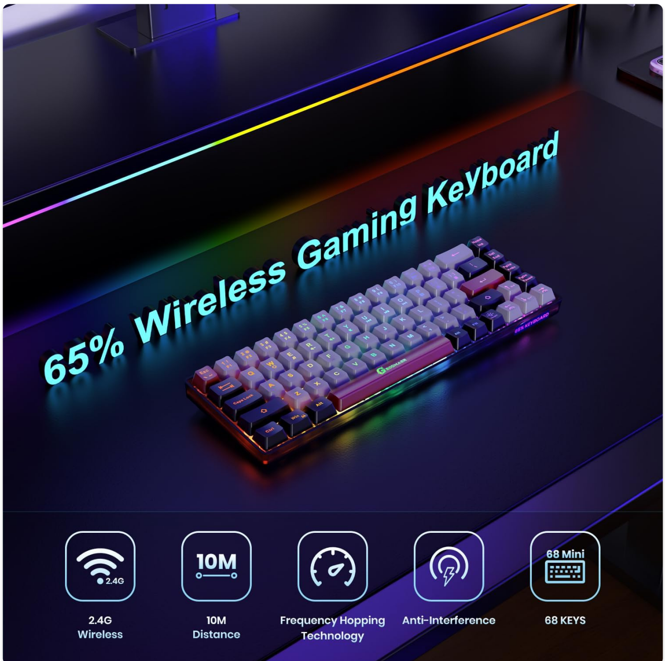
Figure 2: Wireless Connectivity Features. This image highlights the 2.4G wireless connection, 10M effective distance, frequency hopping technology for anti-interference, and the 68-key mini layout.