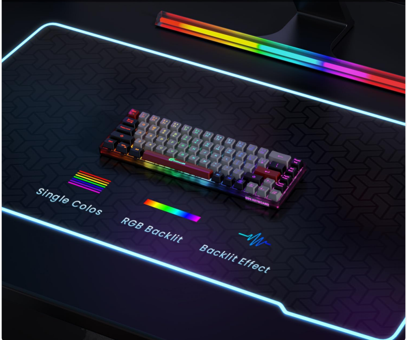
Figure 5: Wireless Keyboard with 14 Backlit Modes. This image demonstrates the various lighting options, including single colors, RGB backlighting, and different backlit effects.