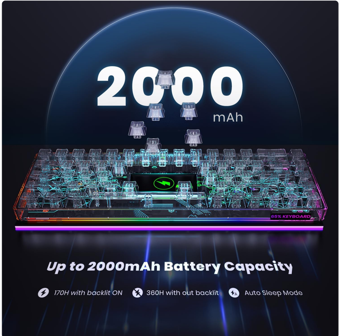
Figure 3: Battery Capacity. This image illustrates the 2000mAh battery capacity, indicating approximately 170 hours of use with backlight on, 360 hours without backlight, and an auto-sleep mode for power saving.

The keyboard is equipped with a 2000 mAh rechargeable battery. To charge, connect the keyboard to a USB power source using the provided Type-C cable. A red indicator light will typically illuminate during charging and turn off when fully charged. The keyboard can be used while charging.