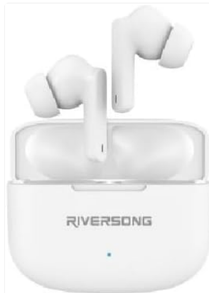
Image: The Riversong Airfly L6 TWS Earbuds, white in color, resting inside their matching white charging case. The case is open, revealing the earbuds. The Riversong logo is visible on the front of the case.

Thank you for choosing the Riversong Airfly L6 TWS Earbuds. This manual provides detailed instructions on how to set up, operate, and maintain your earbuds to ensure optimal performance and longevity. Please read this manual carefully before use.