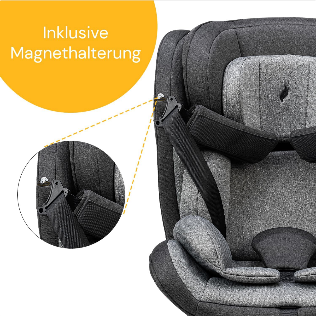
Figure 5: Magnetic buckle holders for convenience.

than two fingers can fit between the strap and your child's collarbone.