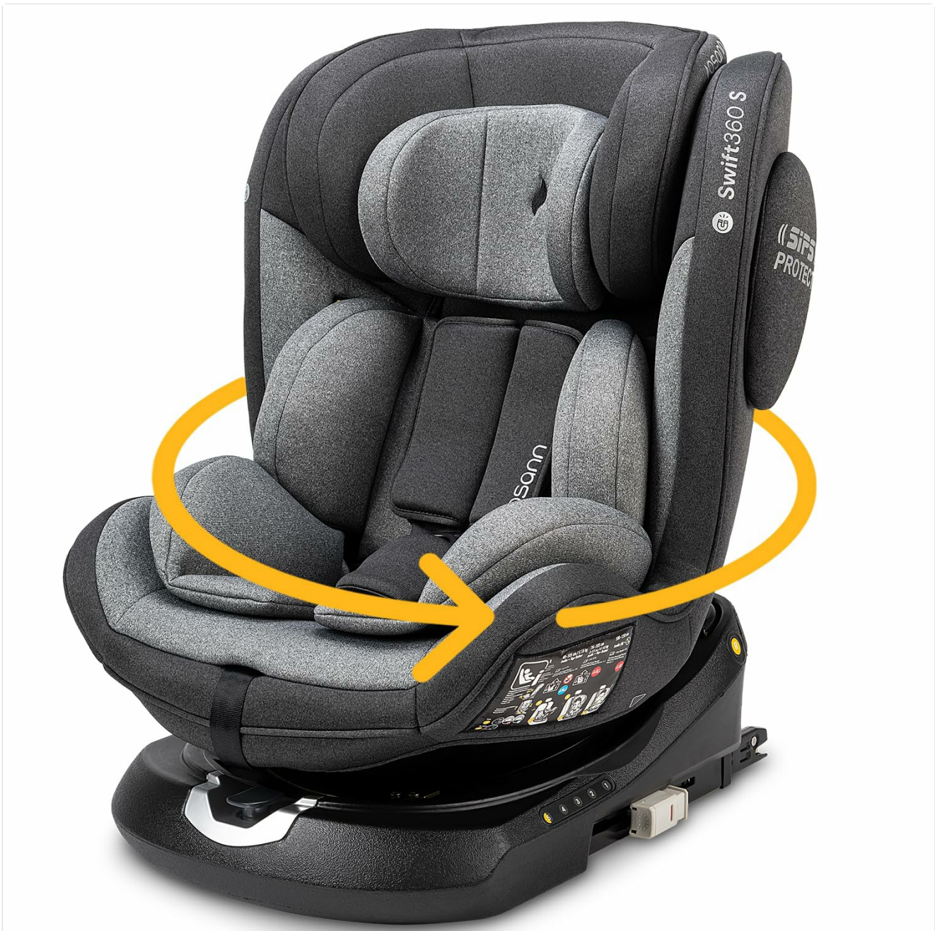
Figure 1: Front view of the Osann Swift360 S i-Size car seat in grey.