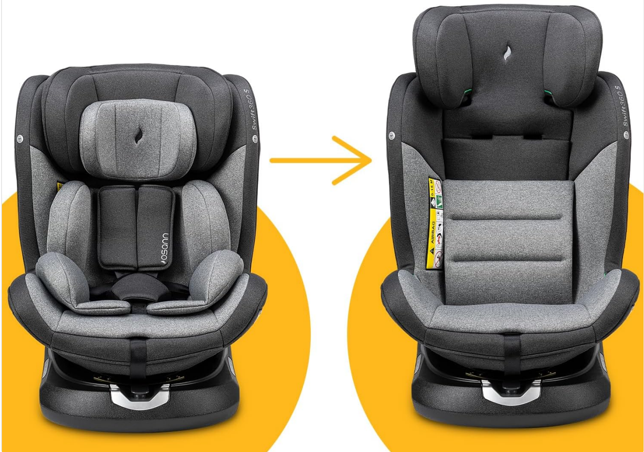
Figure 8: Headrest adjustment mechanism.