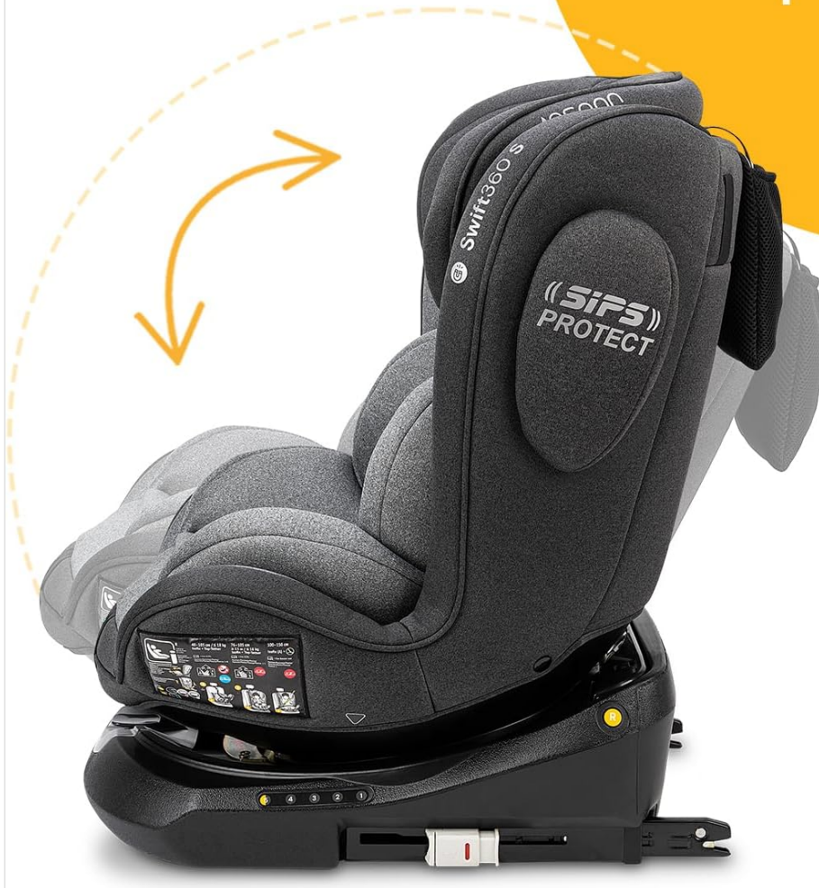
Figure 9: Car seat in various recline positions.