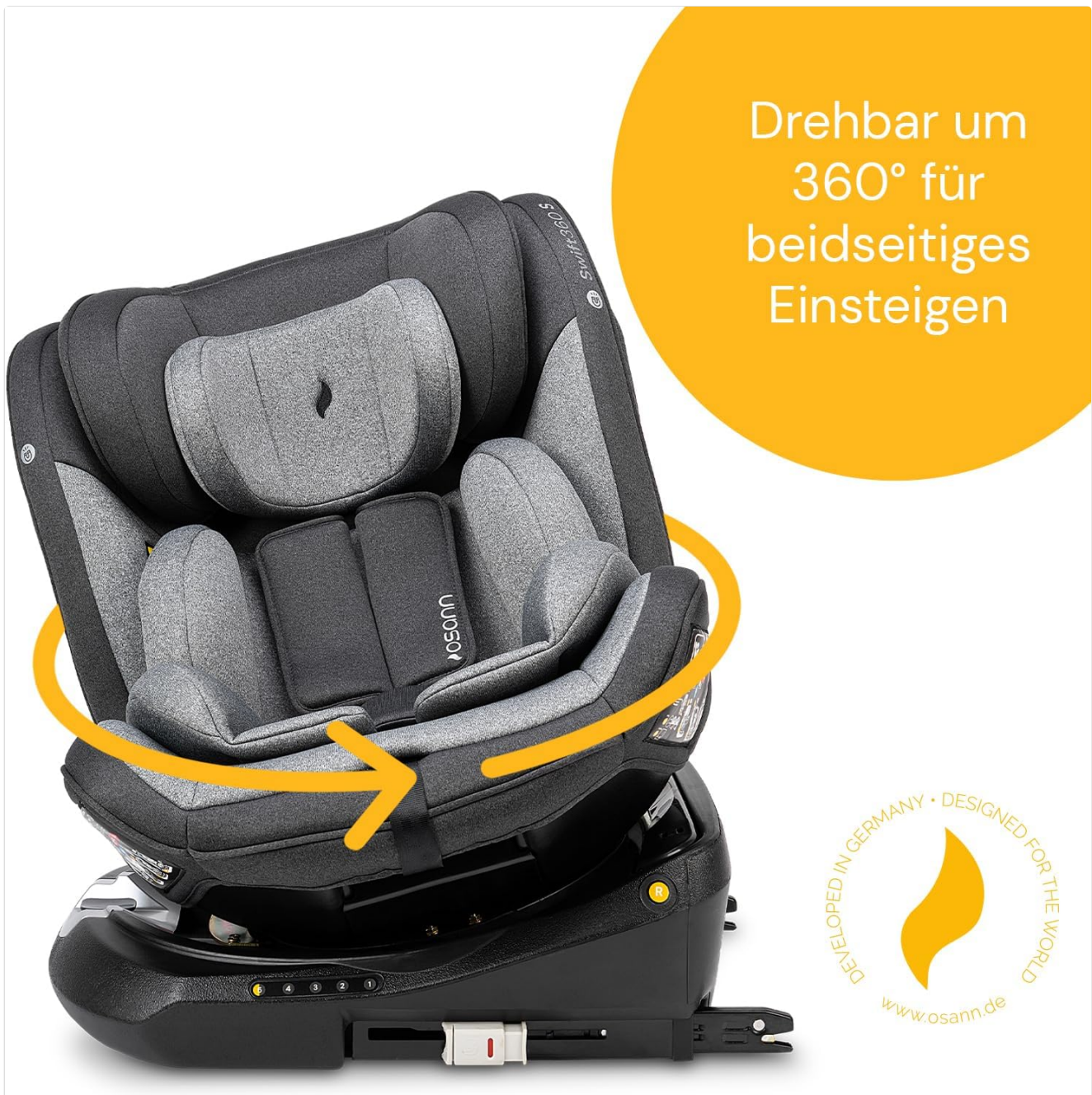
Figure 4: Demonstrating the 360° swivel function.