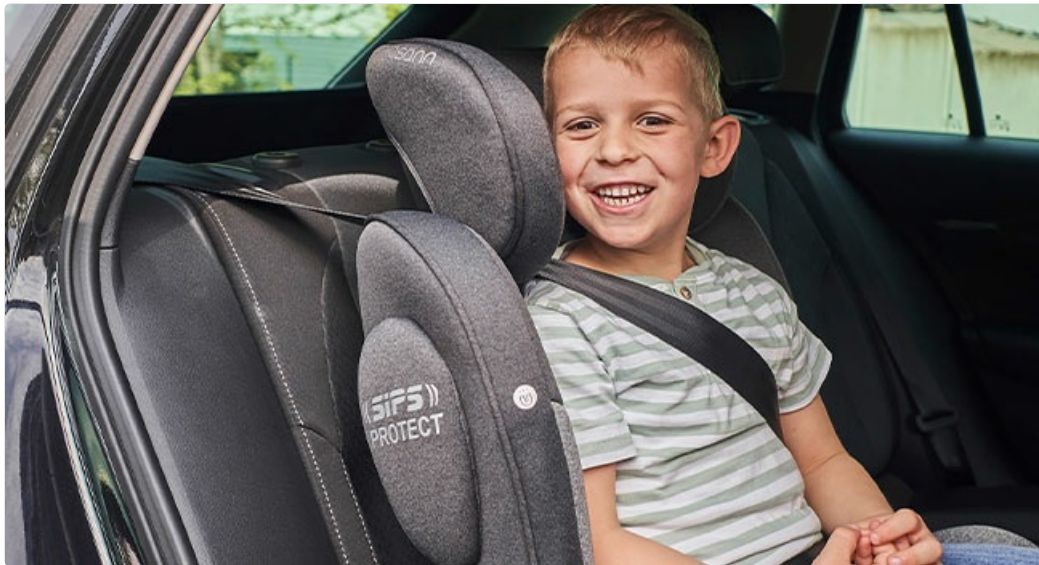
Figure 7: Child secured with vehicle's 3-point seatbelt.