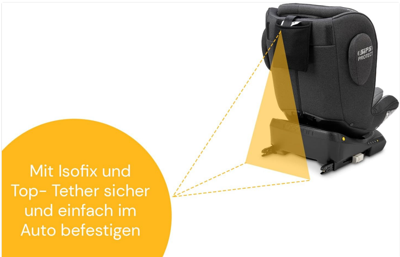
Figure 3: ISOFIX and Top-Tether attachment points.