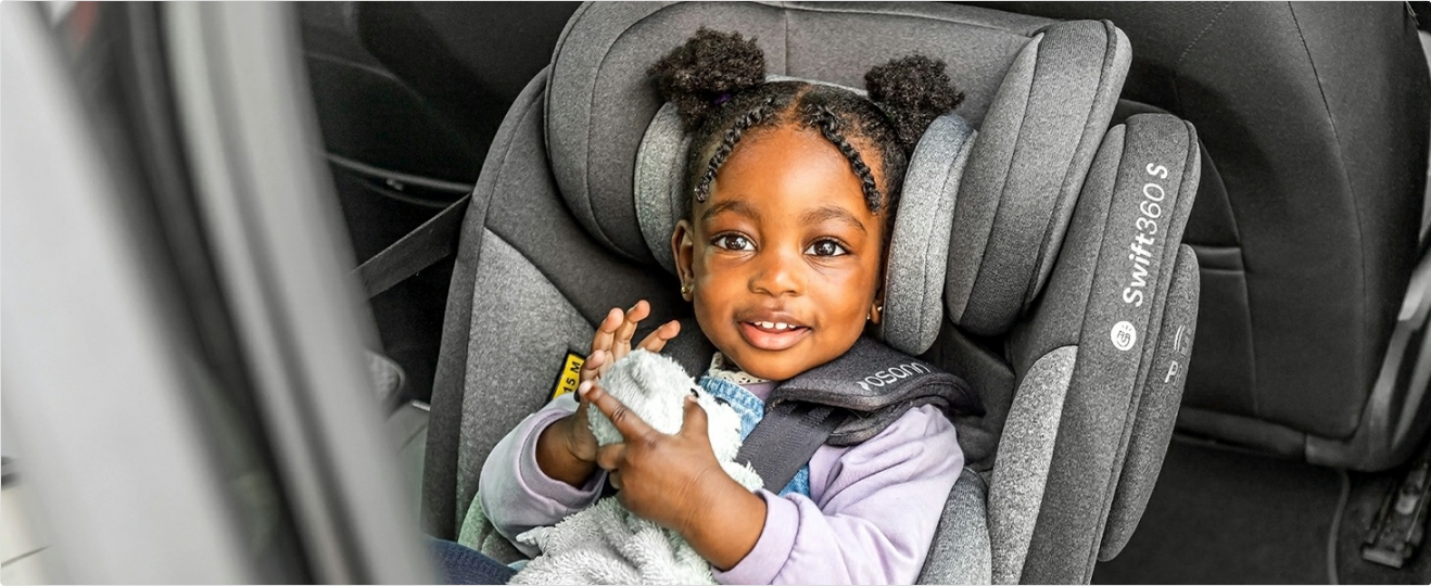
Figure 6: Child secured in the 5-point harness.