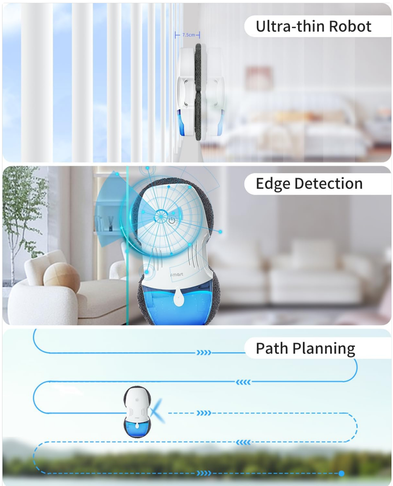
Image 6.1: The Fmart T10 showcasing its ultra-thin profile, advanced edge detection system, and intelligent path planning for efficient window cleaning.