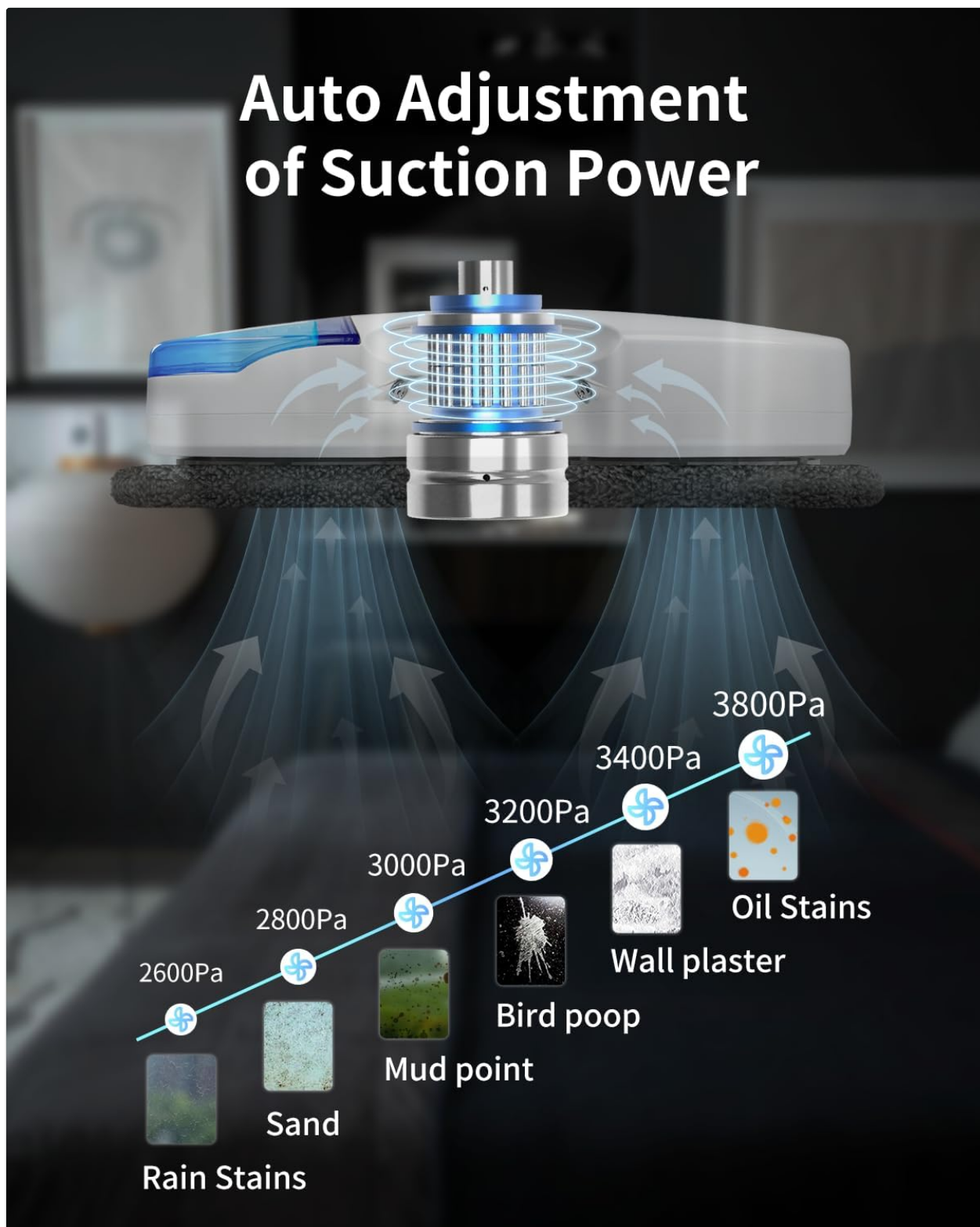
Image 6.2: The Fmart T10's automatic suction power adjustment feature, illustrating how it adapts suction from 2600Pa for light rain stains to 3800Pa for heavy oil stains, ensuring optimal cleaning performance.