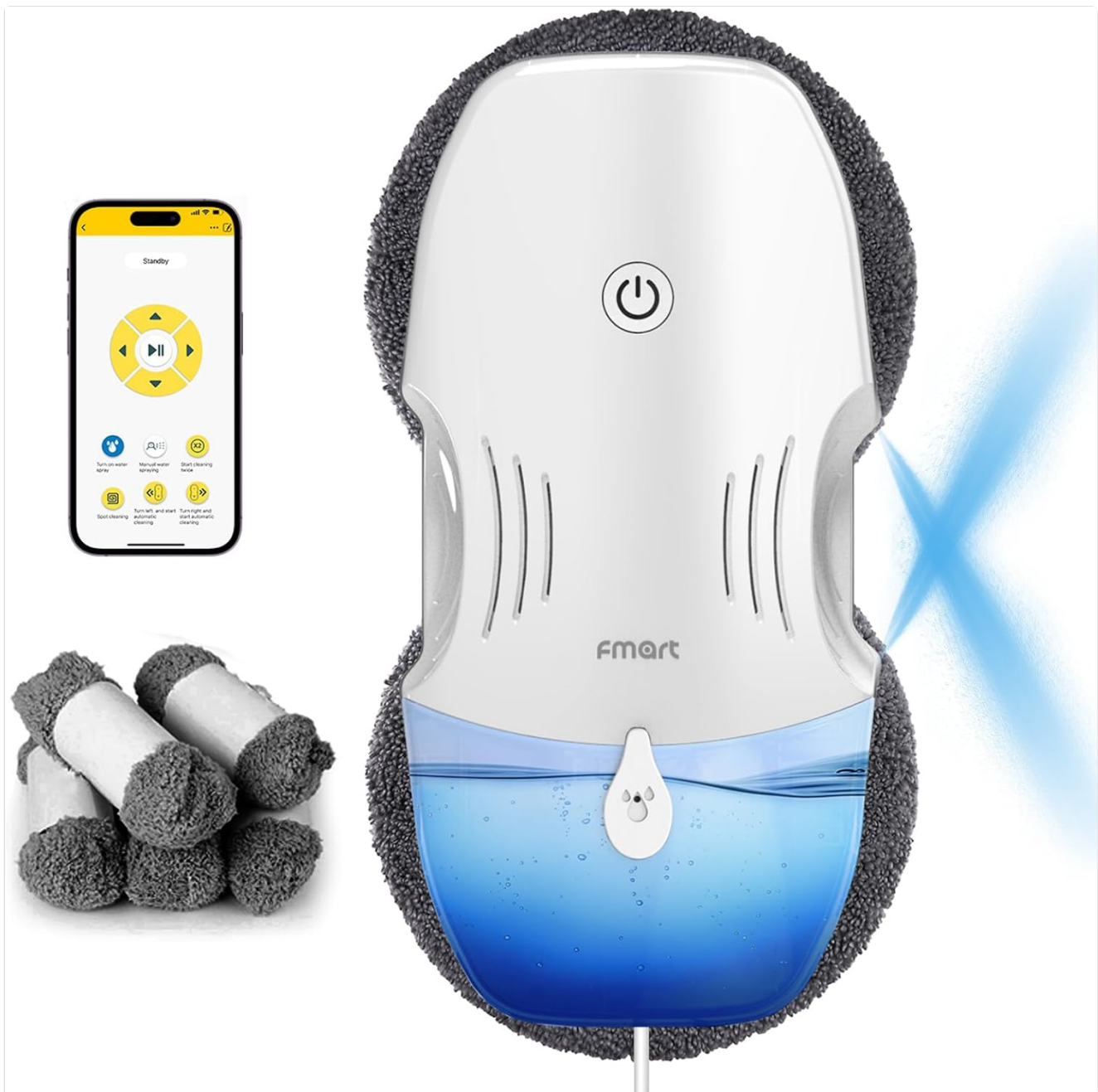
Image 1.1: The Fmart Robot Window Cleaner T10, showcasing its sleek design, accompanying remote control application interface, and a set of cleaning pads.