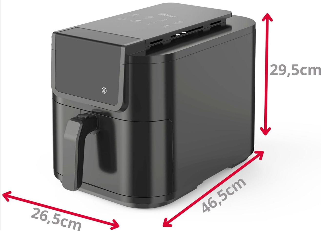
Figure 9.1: Product dimensions for the ARDES ARFRYA05L INFINITY 8L Air Fryer.