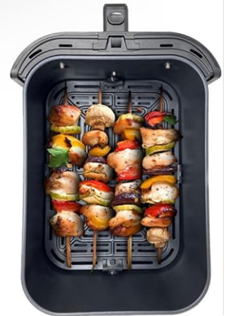
Figure 6.1: Examples of food that can be cooked in the air fryer: fish, meat, chicken, and skewers.