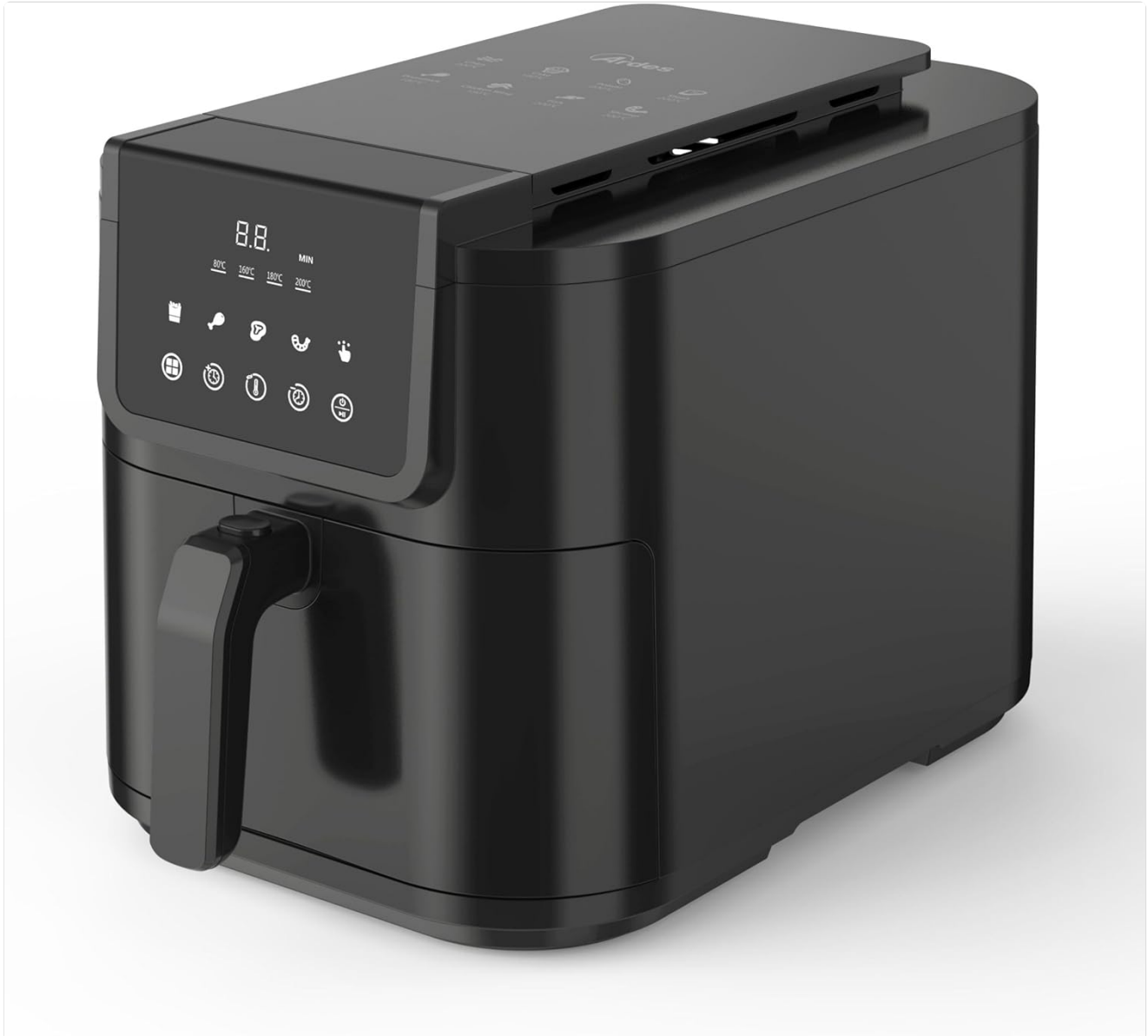
Figure 3.1: Front-side view of the ARDES ARFRYA05L INFINITY 8L Air Fryer.

The ARDES ARFRYA05L INFINITY 8L Air Fryer features a sleek design with an extra-deep cooking cavity, allowing for versatile cooking options.