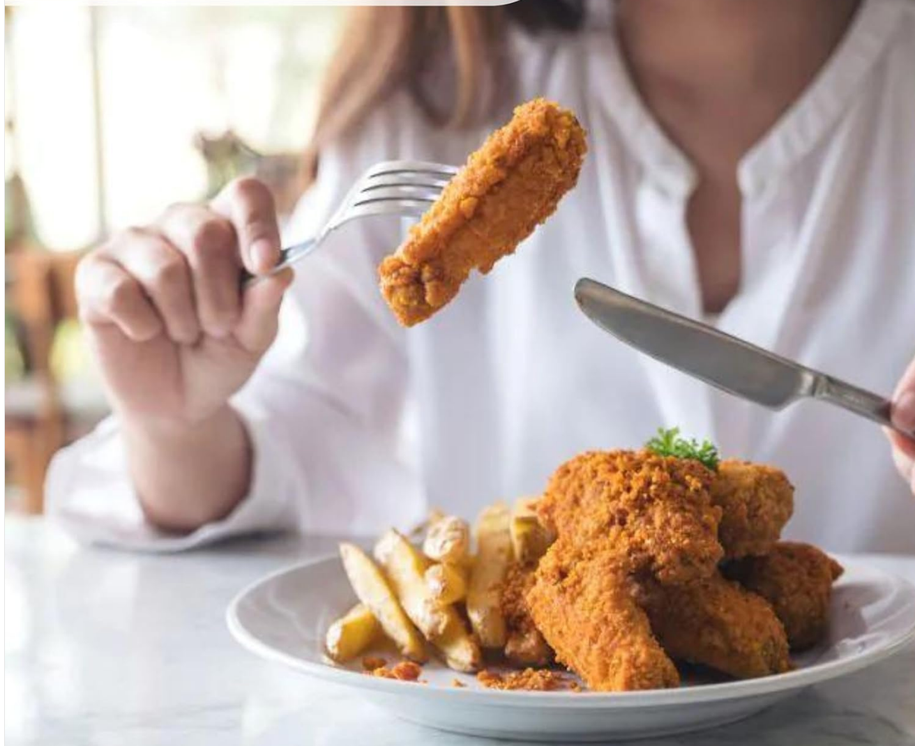
Figure 6.2: Enjoying healthy, crispy food cooked with significantly less oil.