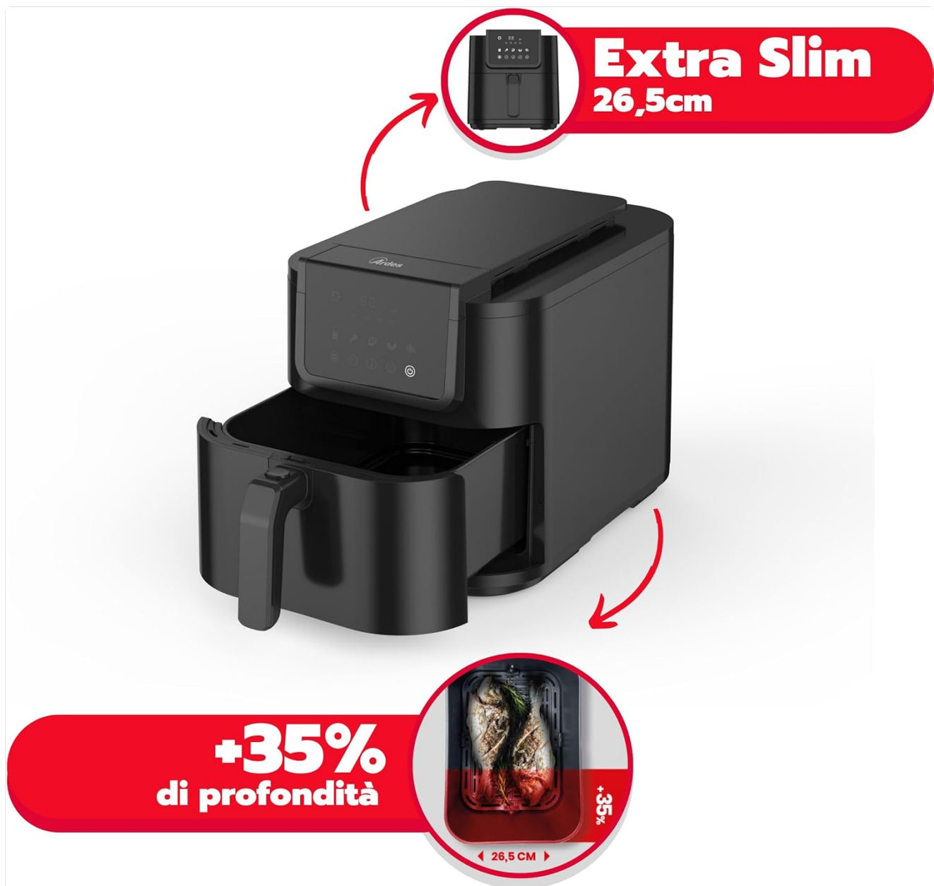
Figure 3.3: Illustration of the air fryer's slim profile and deep basket design.