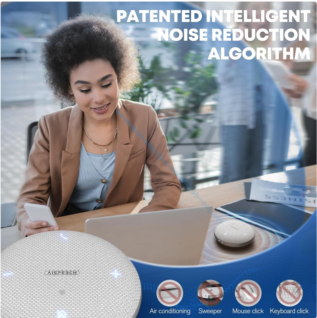
Figure 3: The speakerphone's patented intelligent noise reduction algorithm effectively suppresses background sounds for enhanced clarity.