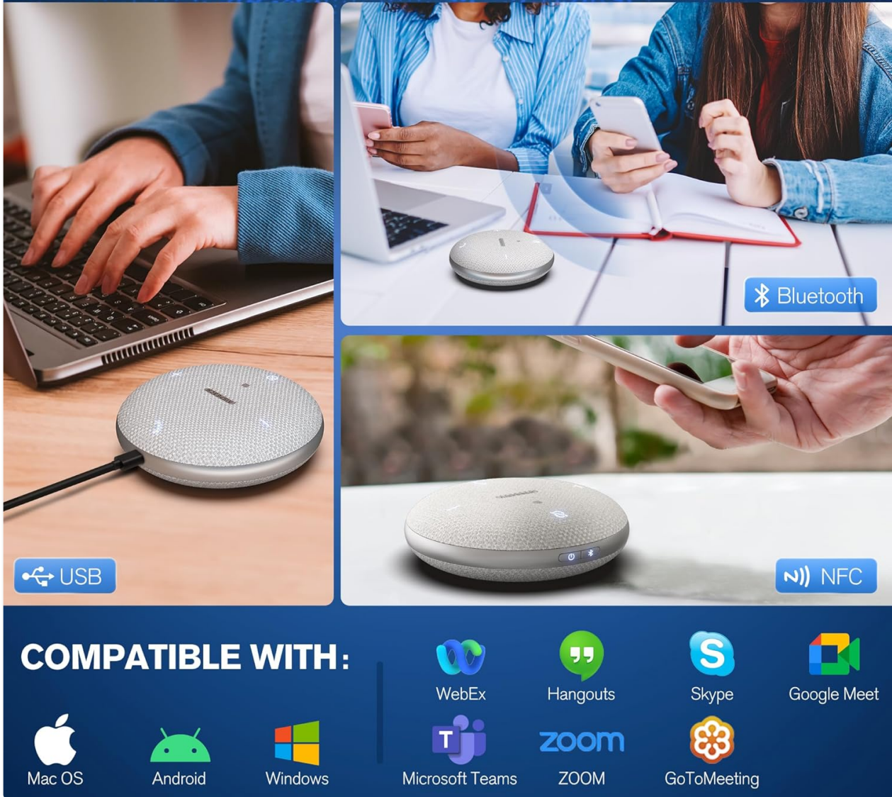
Figure 2: The AISPEECH M4 offers versatile connectivity options including USB, Bluetooth, and NFC, compatible with various operating systems and conferencing platforms.