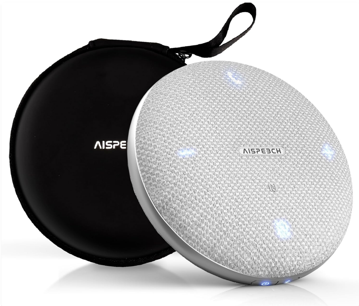
Figure 1: AISPEECH M4 Bluetooth Conference Speakerphone and its portable case.